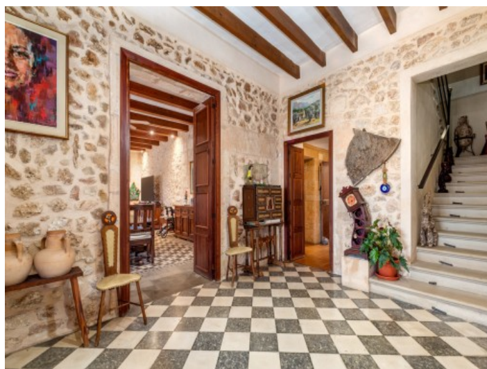
View of the floor