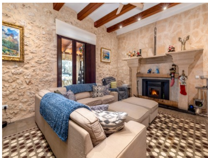
Cozy living area with fire place