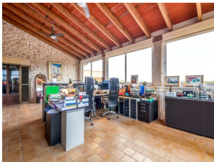
Light flooded office area