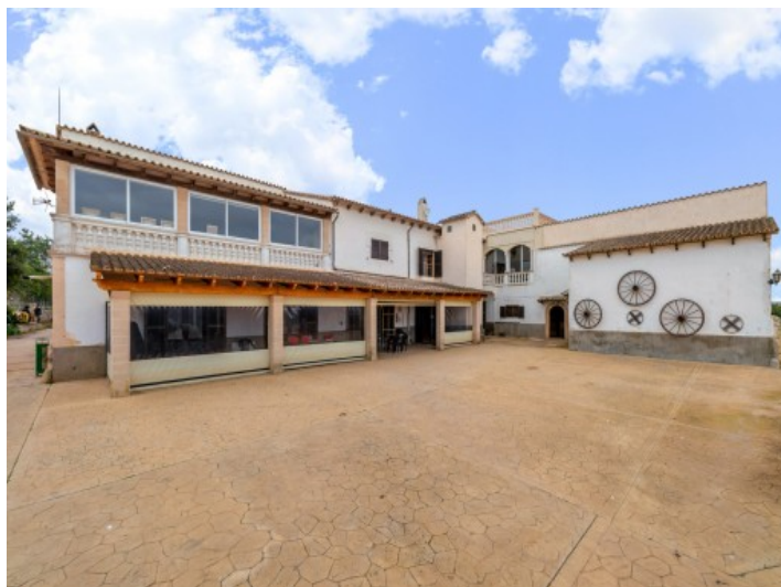
Exterior view and large outdoor area