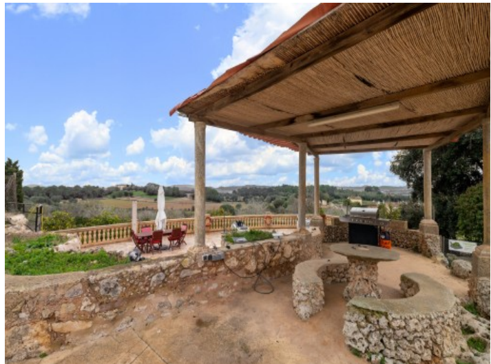
Fantastic barbecue area