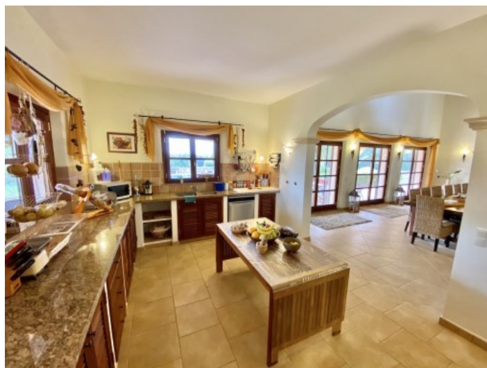
Rustic kitchen with cooking island

All information is correct to the best of our knowledge. Errors and prior sale excepted. This prospectus is purely for information purposes. Only the notarized deed of sale is legally binding.