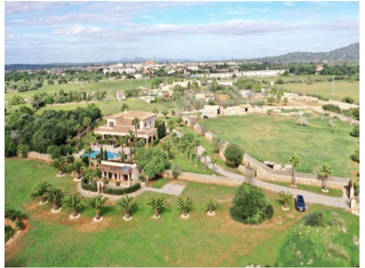
Idyllic landscape view