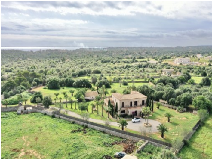
Exterior view of the property

All information is correct to the best of our knowledge. Errors and prior sale excepted. This prospectus is purely for information purposes. Only the notarized deed of sale is legally binding.