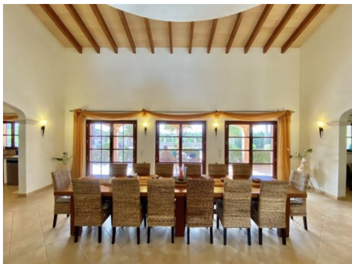
Alternative view of the dining area