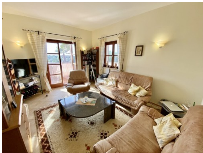
Separate living area