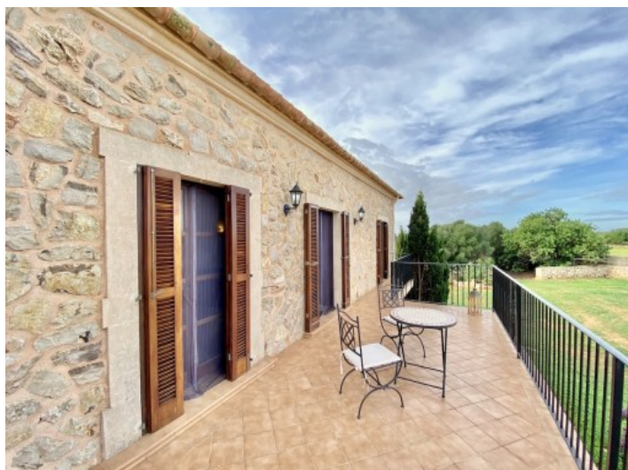
Balcony with sitting area