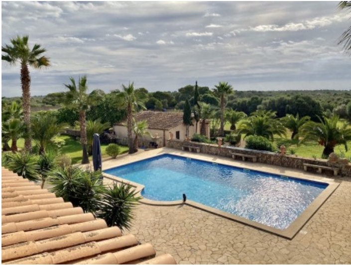
View to the pool area