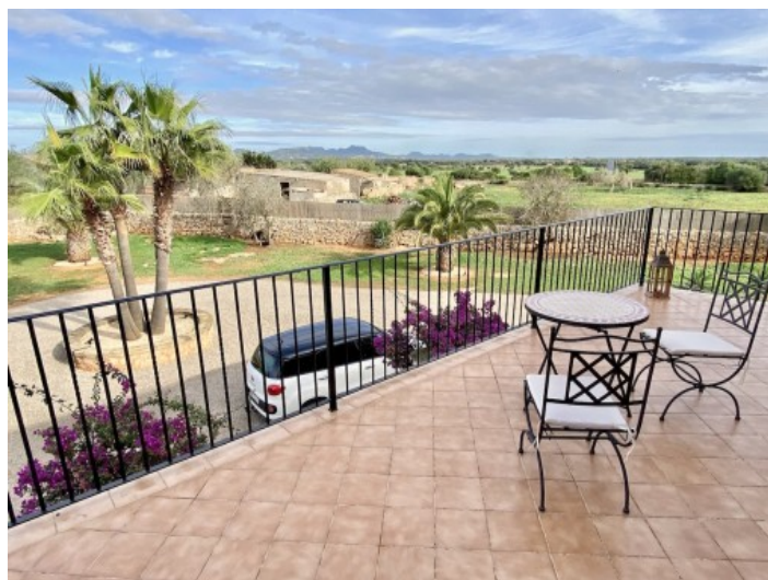
View of the balcony

All information is correct to the best of our knowledge. Errors and prior sale excepted. This prospectus is purely for information purposes. Only the notarized deed of sale is legally binding.