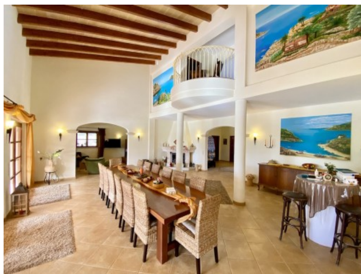
Impressive dining area