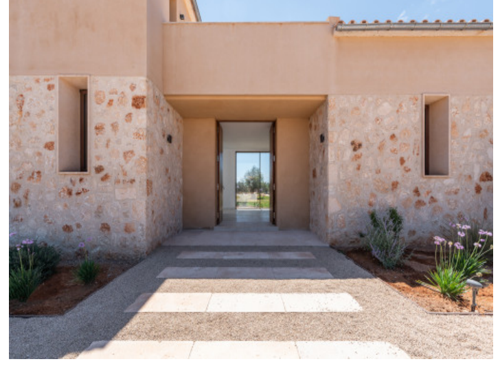
Nice entrance area