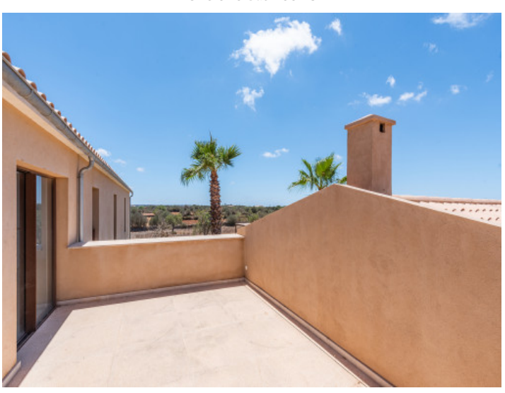
Bedroom with private terrace