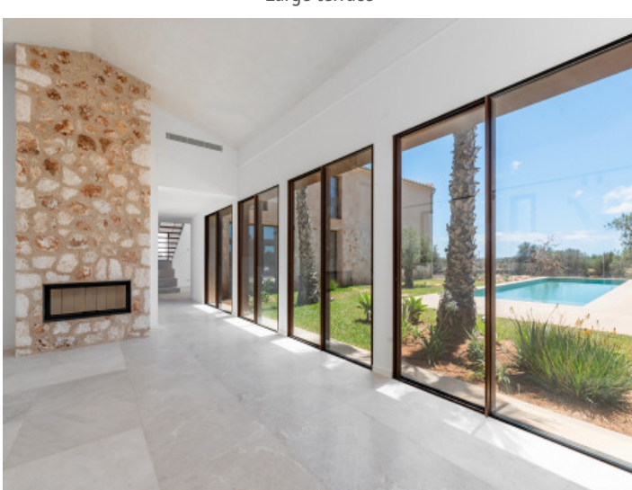
Entrance hall Living area with fireplace All information is correct to the best of our knowledge. Errors and prior sale excepted. This prospectus is purely for information purposes. Only the notarized deed of sale is legally binding.