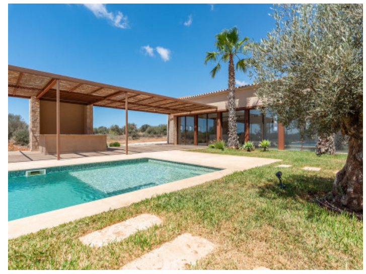
Pool and terrace