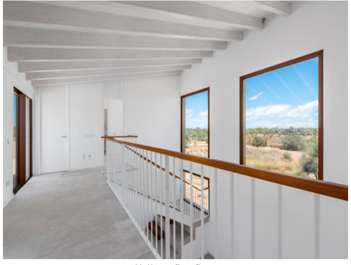
Hallway first floor