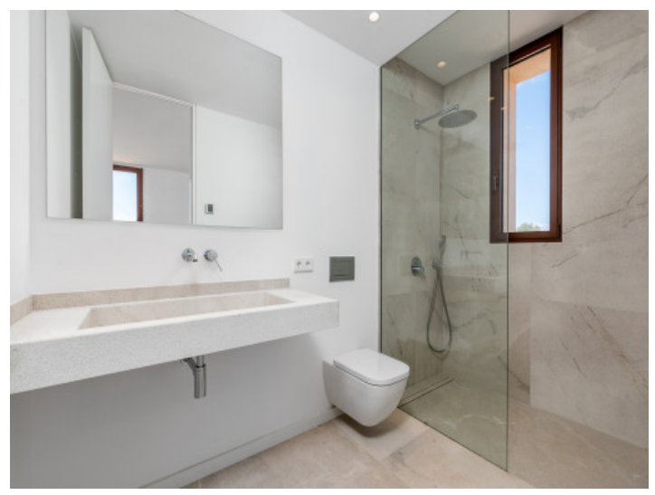
One of 6 bathrooms

PORTA MALLORQUINA® Your home. Our passion.