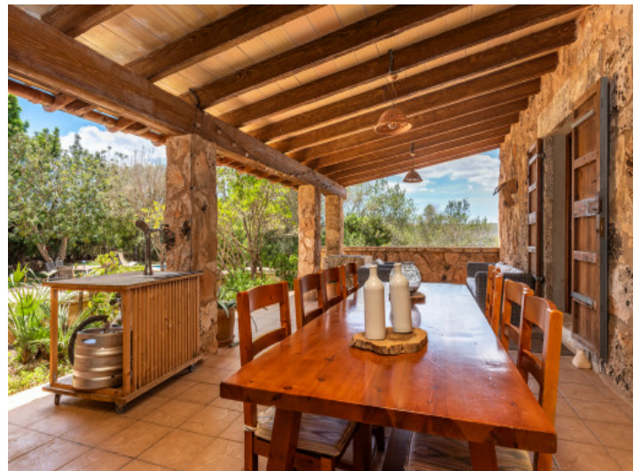
Terrace with dining area