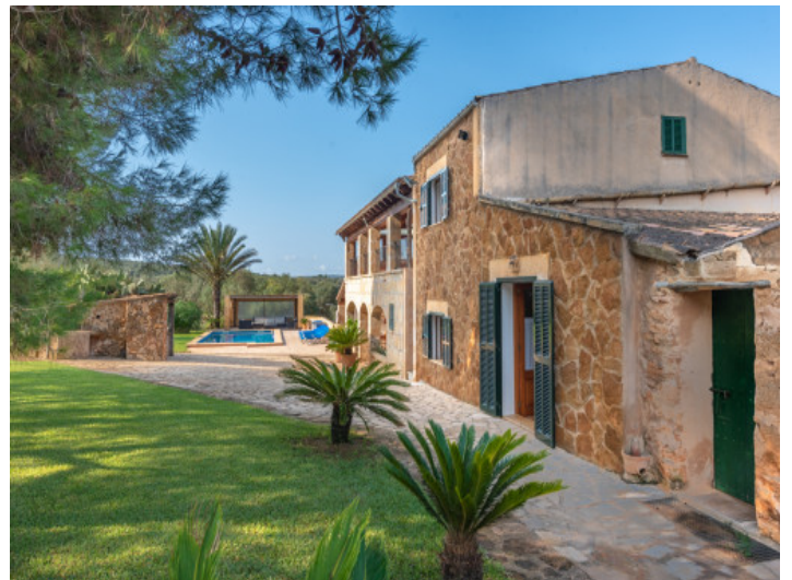
Finca with lots of charme