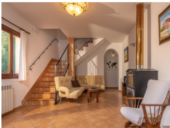
Rustic living area with fireplace