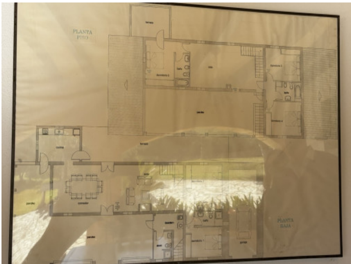
Floor plan ground and upper floor

All information is correct to the best of our knowledge. Errors and prior sale excepted. This prospectus is purely for information purposes. Only the notarized deed of sale is legally binding.