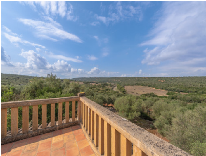
Terrace with views over the extensive plot