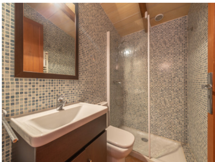
One of 10 bathrooms