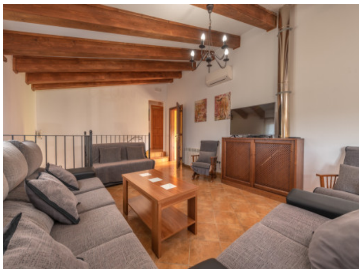
Comfortable living room on the upper floor