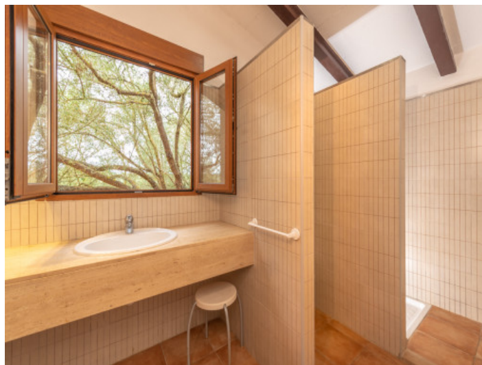
Shower bathroom with garden views