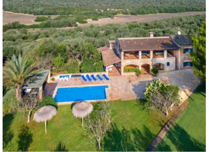
Large finca property surrounded by nature close to Manacor