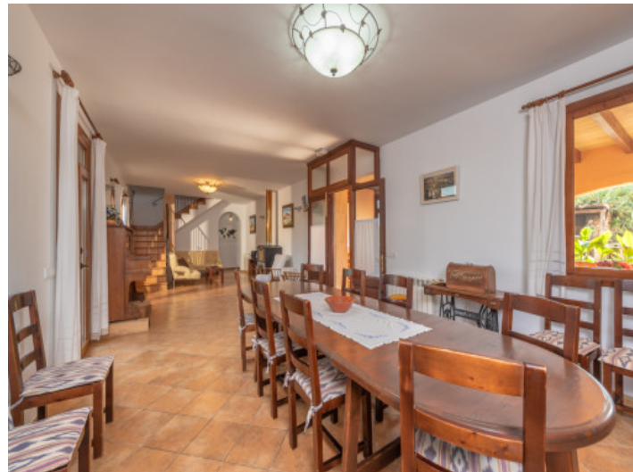
Entrance and large dining area