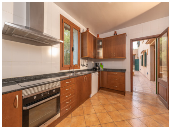
Spacious kitchen with access to the outside