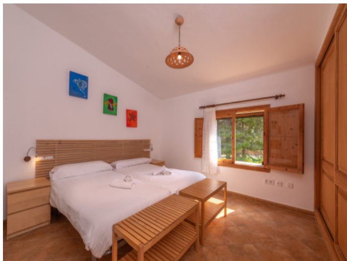
One of 10 bedrooms