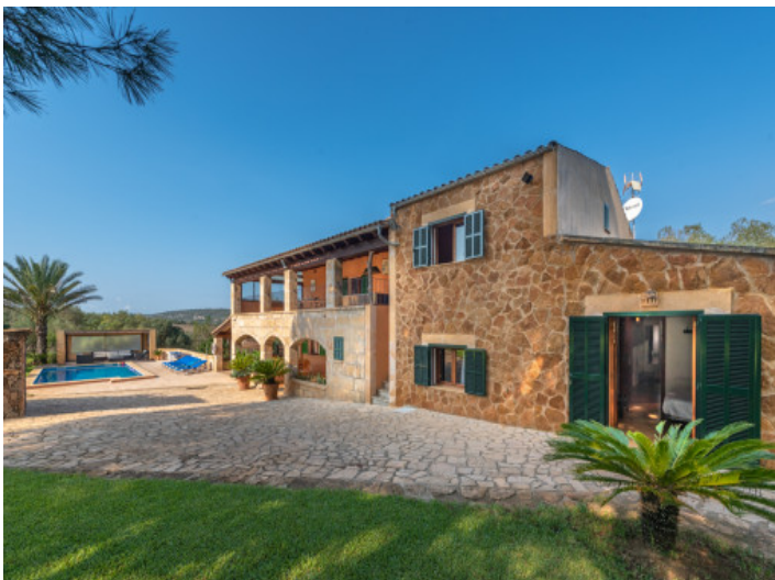
Exterior view and pool area