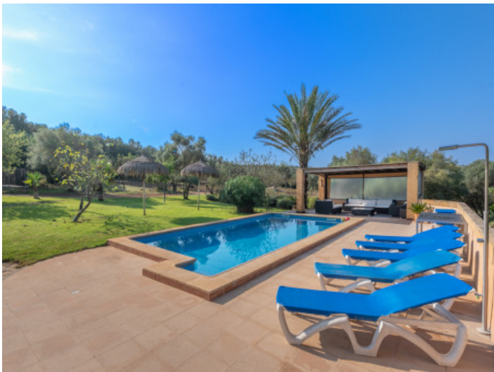
Beautiful pool and garden area