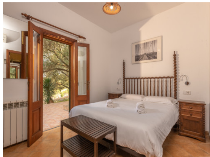
On eof 10 bedrooms

All information is correct to the best of our knowledge. Errors and prior sale excepted. This prospectus is purely for information purposes. Only the notarized deed of sale is legally binding.