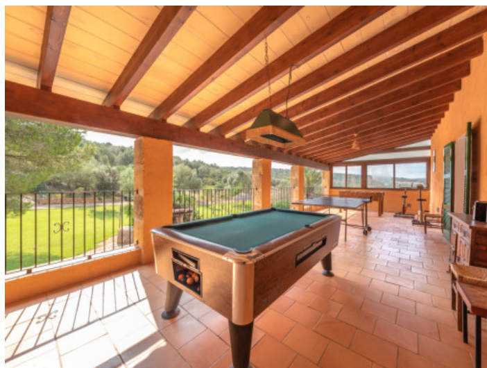
Covered terrace with billiard on the upper floor

All information is correct to the best of our knowledge. Errors and prior sale excepted. This prospectus is purely for information purposes. Only the notarized deed of sale is legally binding.