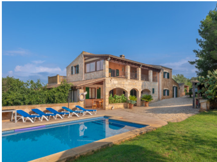
Beautifully laid-out outdoor area