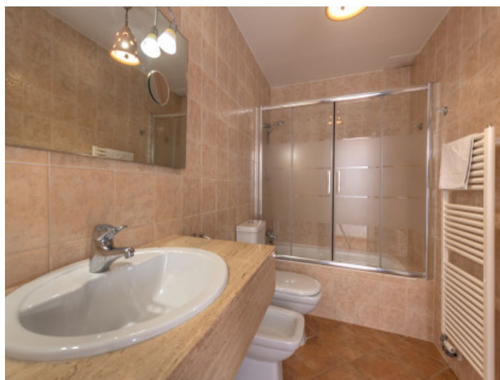
One of 10 bathrooms