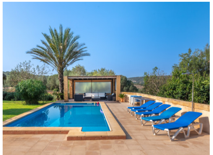
Very private pool area with sun terrace

All information is correct to the best of our knowledge. Errors and prior sale excepted. This prospectus is purely for information purposes. Only the notarized deed of sale is legally binding.