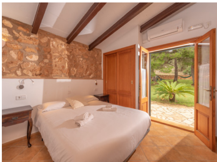
Bedroom with direct garden access