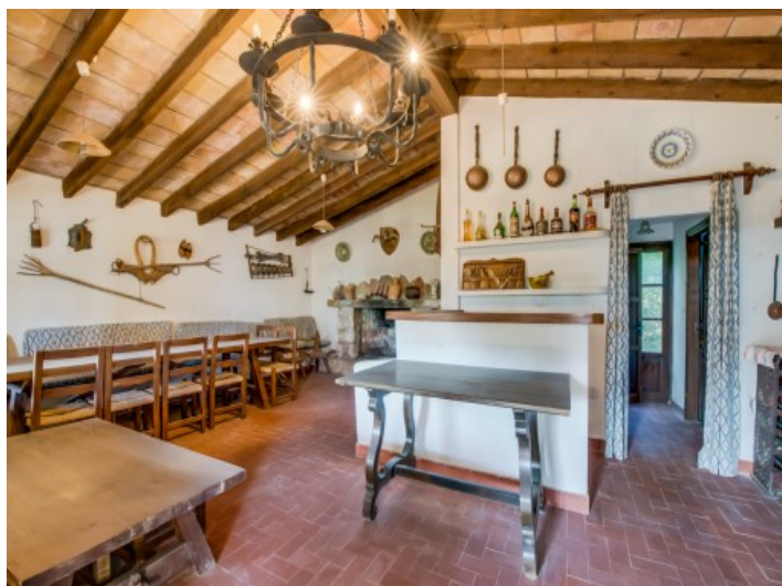
Rustic bbq house with wooden beams