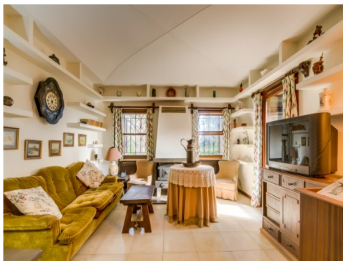
Rustic living area with terrace access