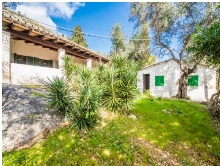
View of the guest houses