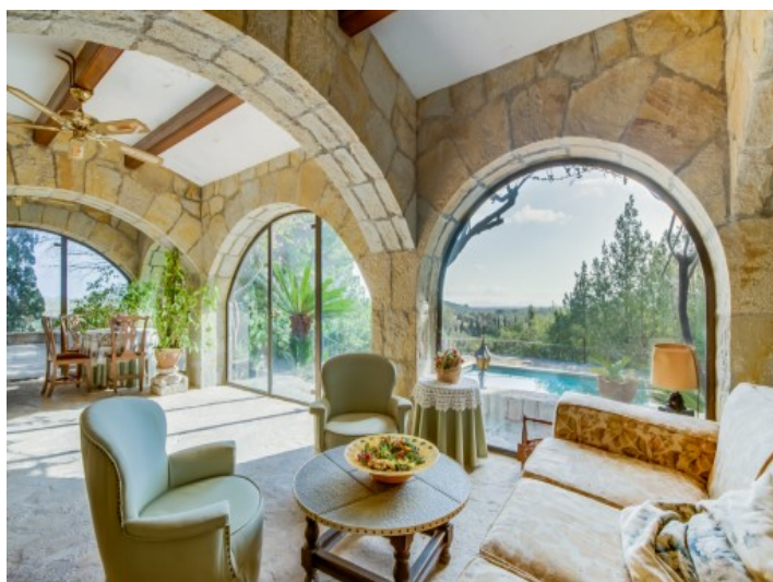
Lightflooded wintergarden with a view