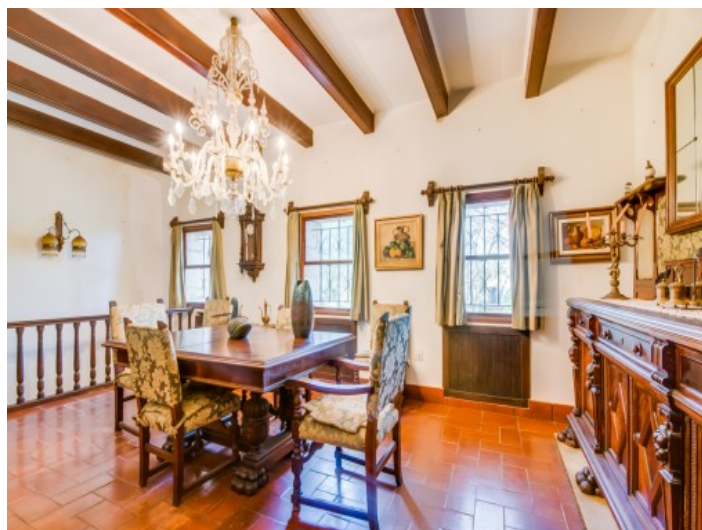
Rustic dining area on the upper floor

All information is correct to the best of our knowledge. Errors and prior sale excepted. This prospectus is purely for information purposes. Only the notarized deed of sale is legally binding.