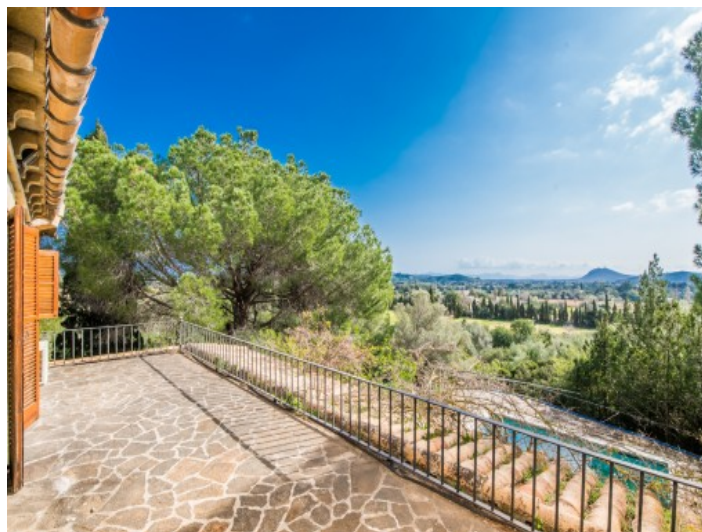
Stunning panoramic views from the terrace