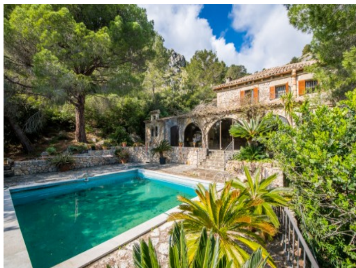
Pool area in the middle of nature

All information is correct to the best of our knowledge. Errors and prior sale excepted. This prospectus is purely for information purposes. Only the notarized deed of sale is legally binding.