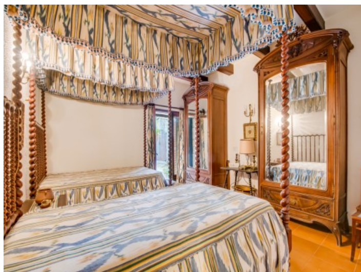
One of in total 11 bedrooms