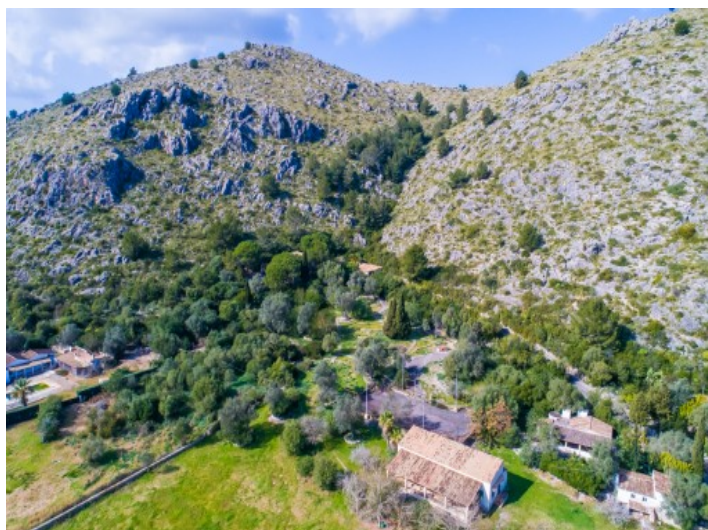
Property with tennis court from above