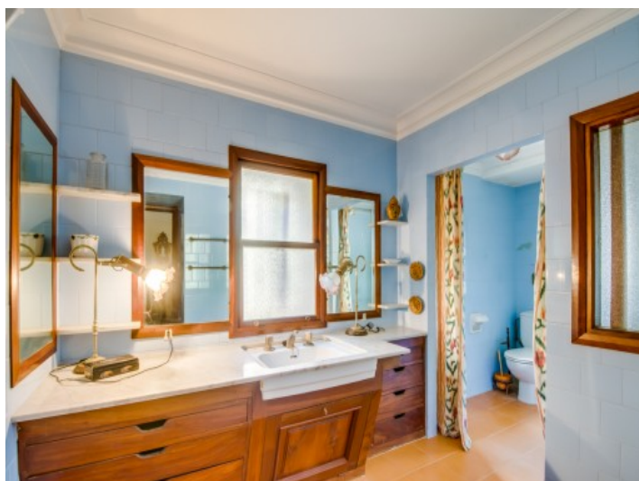
One of in total 9 bathrooms