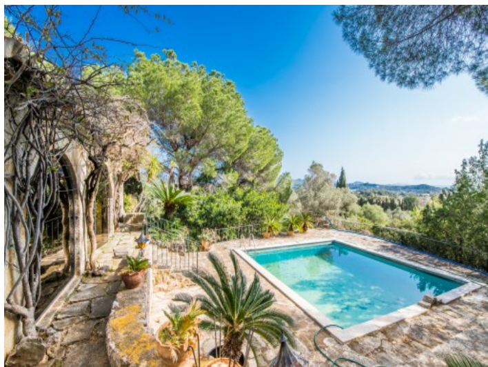
Pool area in absolute privacy with distant views