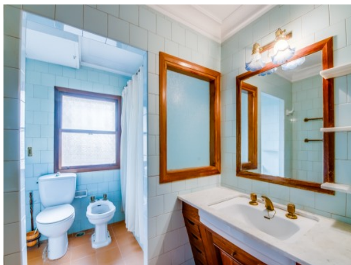
One of in total 9 bathrooms