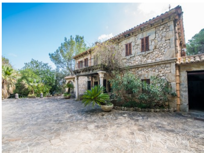
Front view of the main house with stone facade