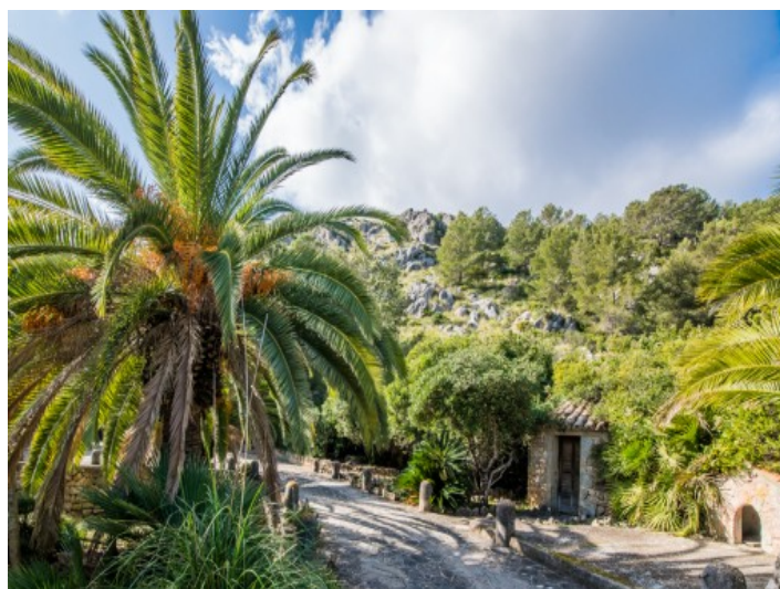
Mediterranean green plot