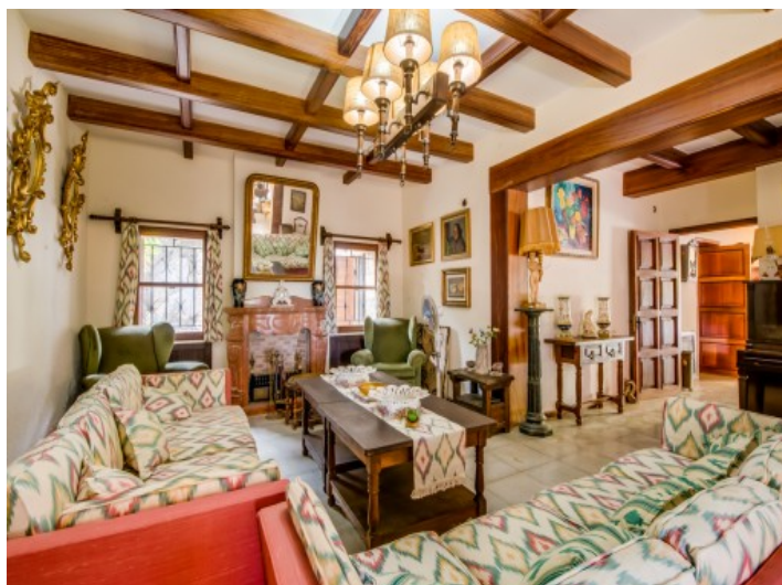
Further living area with wooden ceiling beams