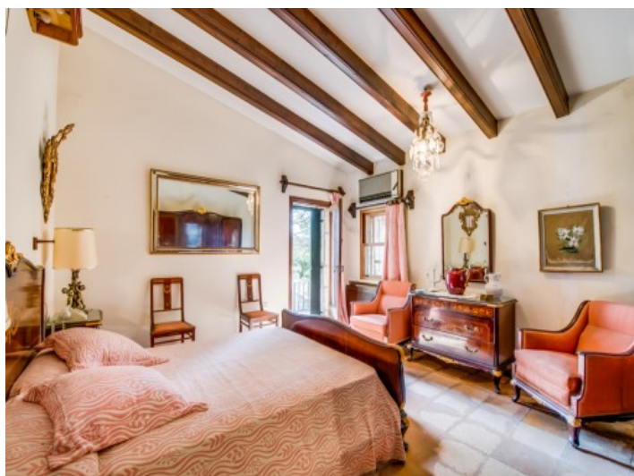
One of in total 11 bedrooms