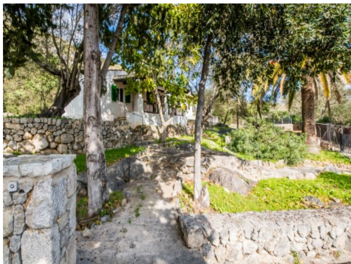
Access to a guest house