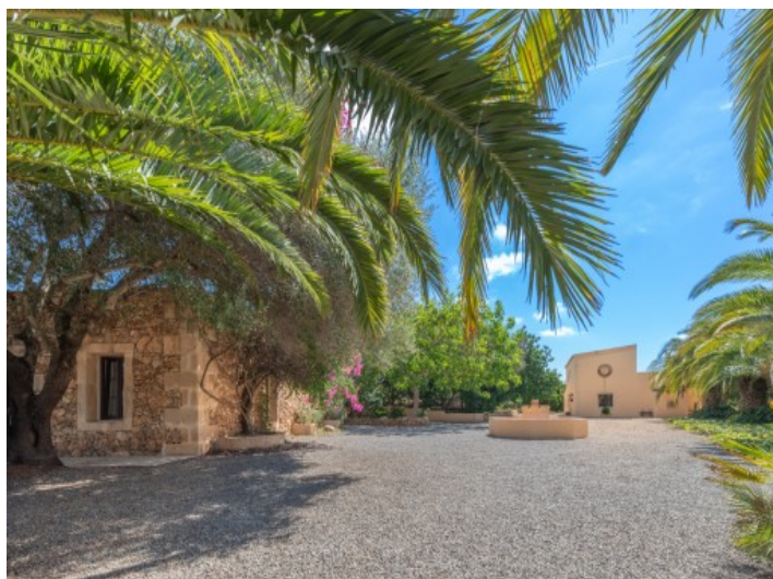
Wonderful outdoor area