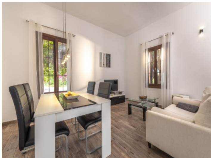
Living and dinin area of the guest house