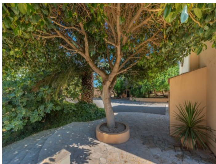
Lovely outdoor area

All information is correct to the best of our knowledge. Errors and prior sale excepted. This prospectus is purely for information purposes. Only the notarized deed of sale is legally binding.