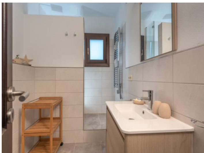
Modern shower bathroom