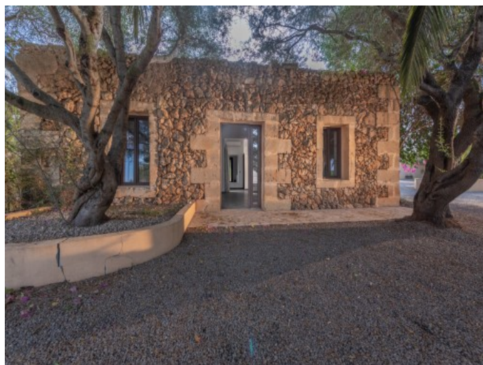
Stone-clad guest house

All information is correct to the best of our knowledge. Errors and prior sale excepted. This prospectus is purely for information purposes. Only the notarized deed of sale is legally binding.