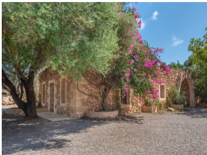
Finca building with charme

All information is correct to the best of our knowledge. Errors and prior sale excepted. This prospectus is purely for information purposes. Only the notarized deed of sale is legally binding.