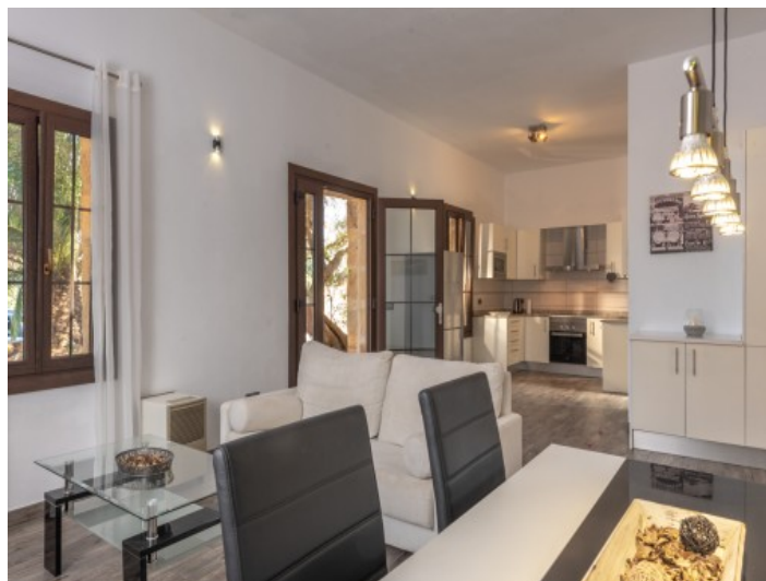
View to the entrance and kitchen