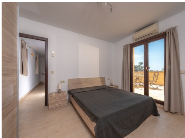
Double bedroom with terrace