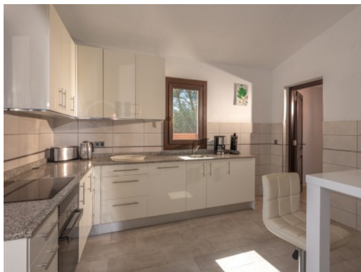
Modern kitchen in white

All information is correct to the best of our knowledge. Errors and prior sale excepted. This prospectus is purely for information purposes. Only the notarized deed of sale is legally binding.