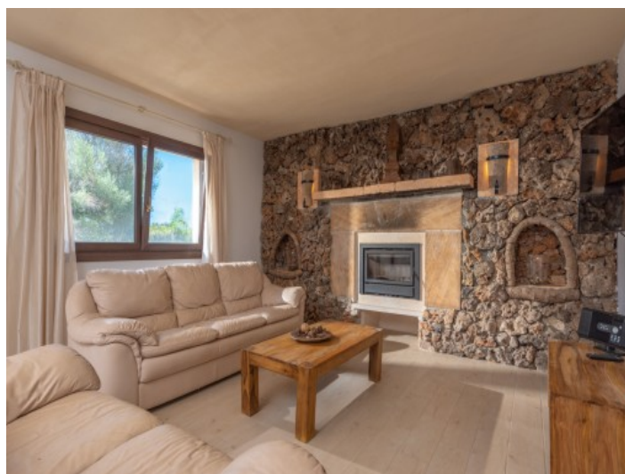
Living area with rustic stone wall