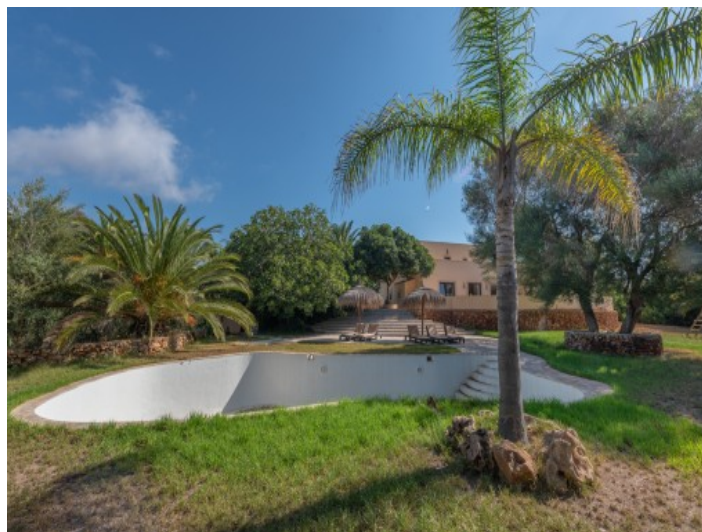
Mediterranean pool area and finca