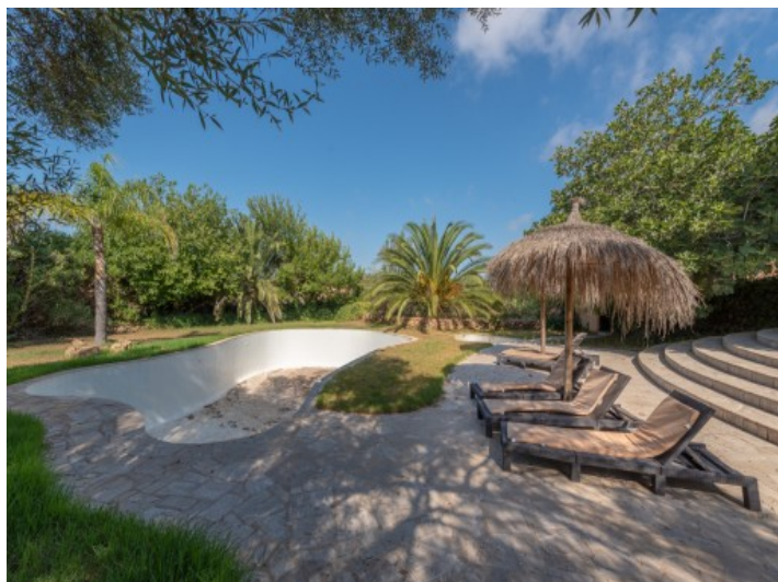
Pool area in absolute privacy