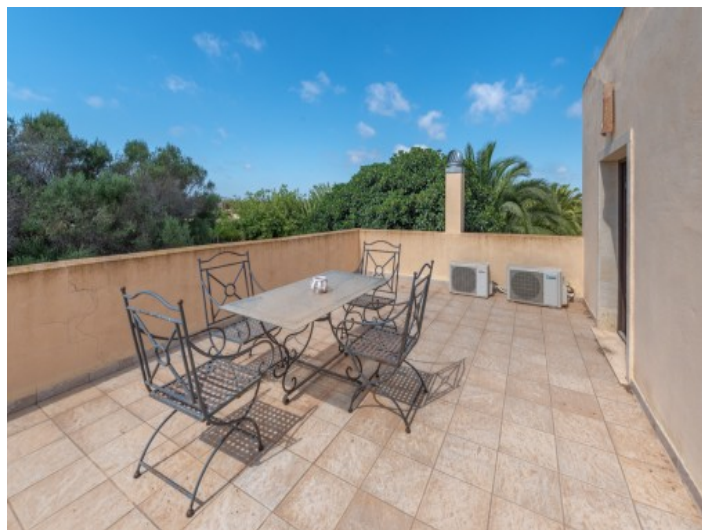
Spacious upper terrace