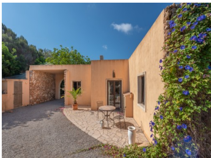
Idyllic terrace next to the house