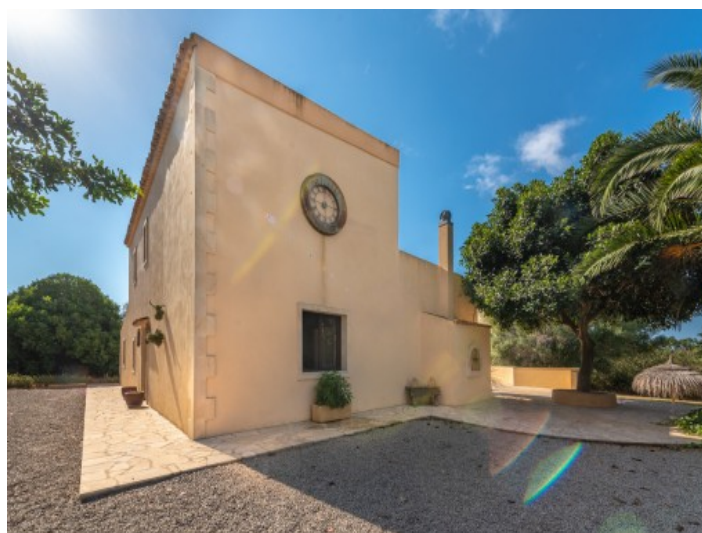
Exterior view of the main house