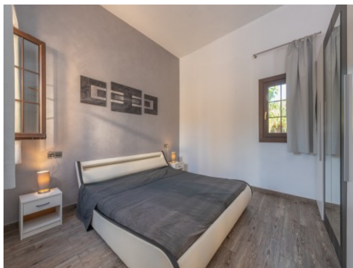
Bright double bedroom