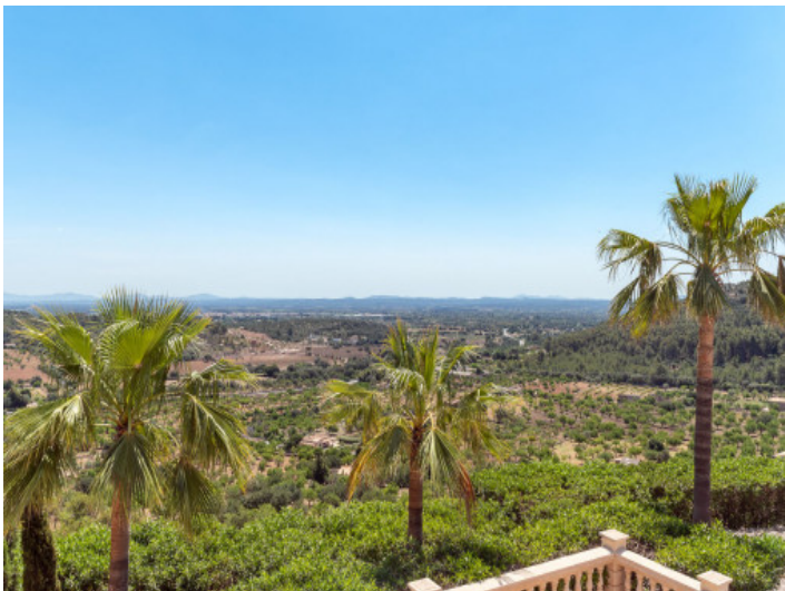
Wonderful panoramic views