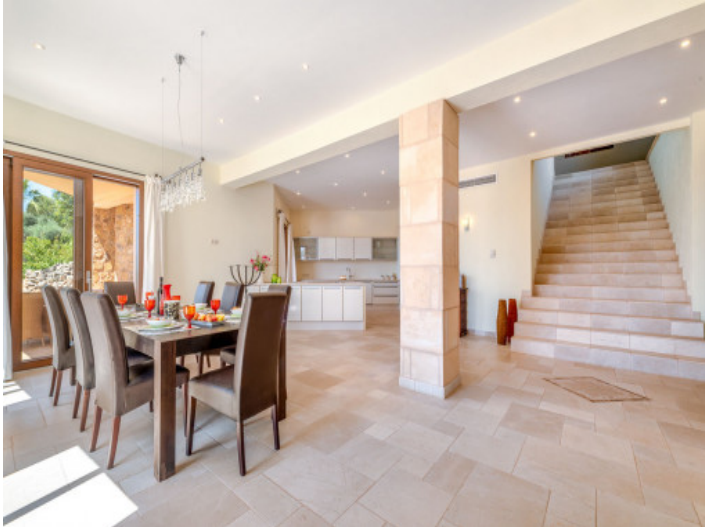
Dining area and open kitchen