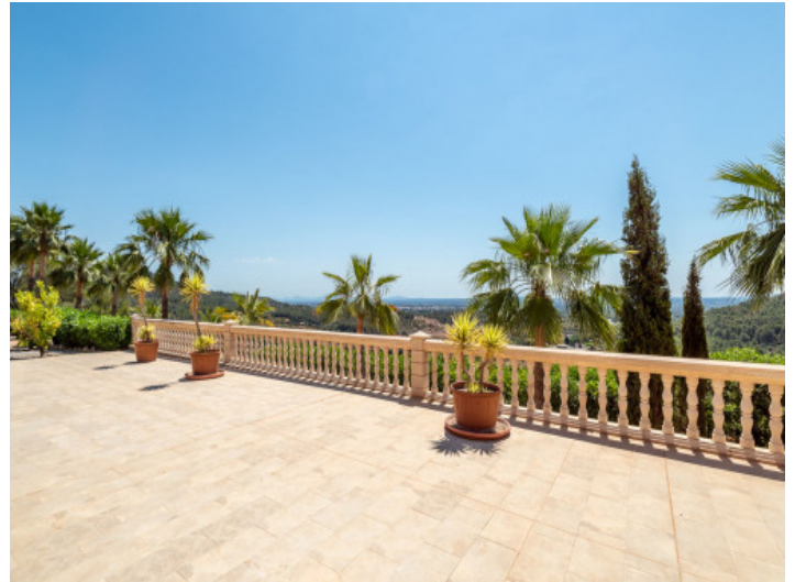
Terrace with views over the landscape