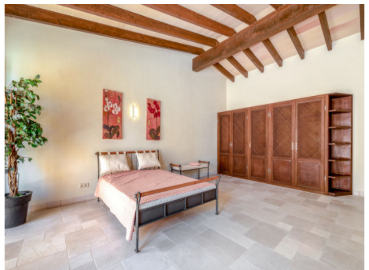
One of 10 bedrooms

All information is correct to the best of our knowledge. Errors and prior sale excepted. This prospectus is purely for information purposes. Only the notarized deed of sale is legally binding.