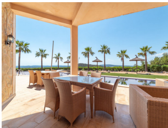
Covered terrace with dining area