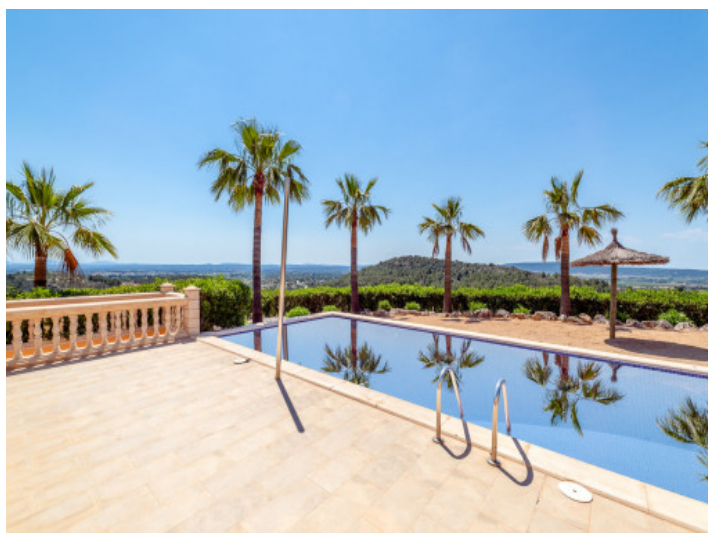
Pool area with beautiful sweeping views