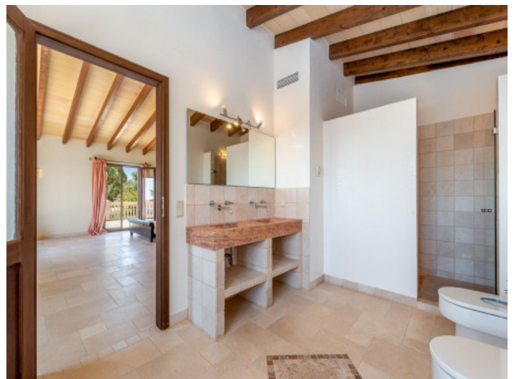
One of 6 bathrooms