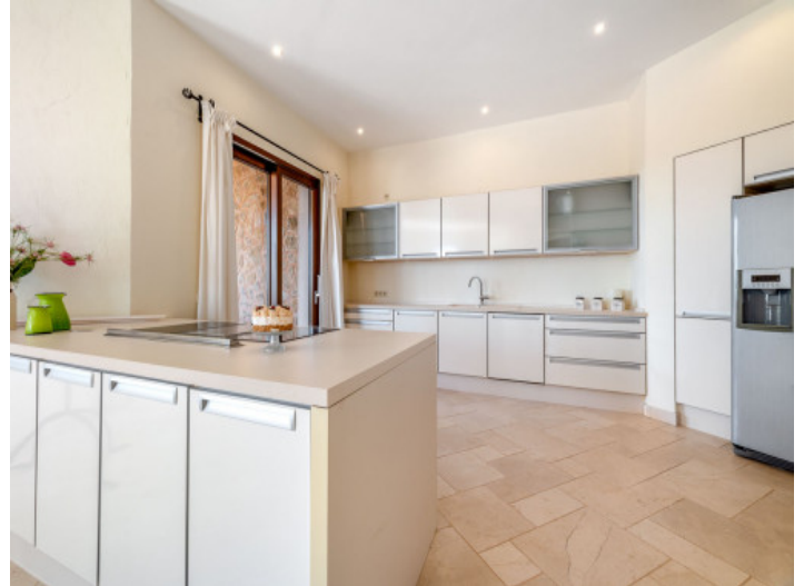
Large, modern kitchen