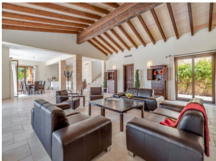
Open-plan living area with wooden ceiling beams