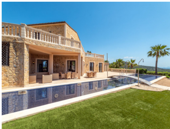
Long 24 metres pool