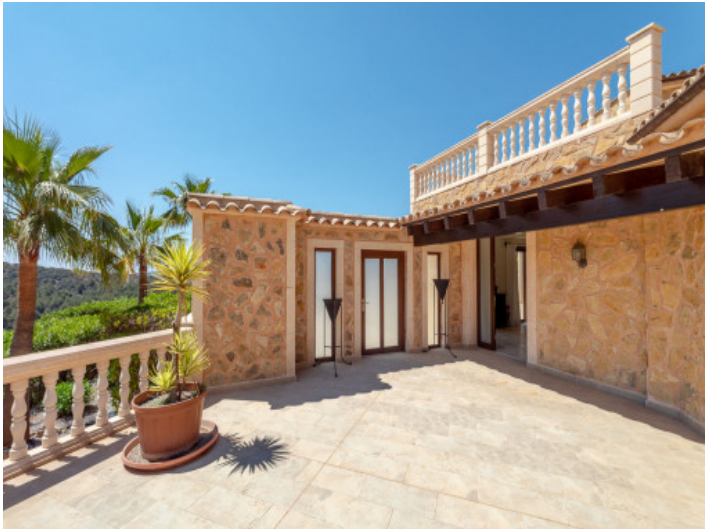
Sunny upper terrace