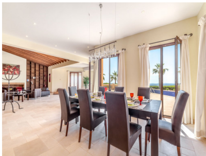
Lightflooded dining area with terrace access

All information is correct to the best of our knowledge. Errors and prior sale excepted. This prospectus is purely for information purposes. Only the notarized deed of sale is legally binding.