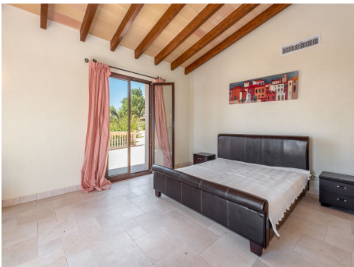
One of 10 bedrooms