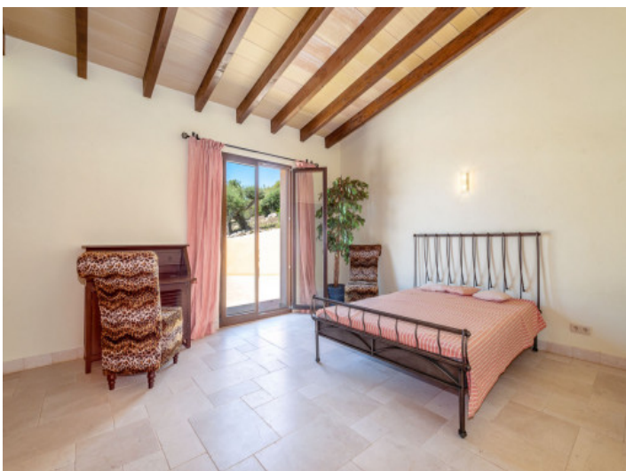
One of 10 bedrooms