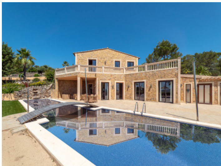
Exterior view and pool area