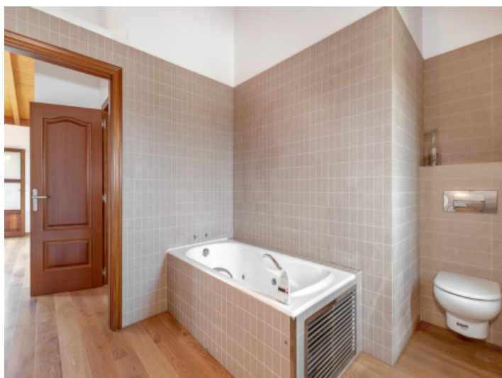
Bathroom with bathtub