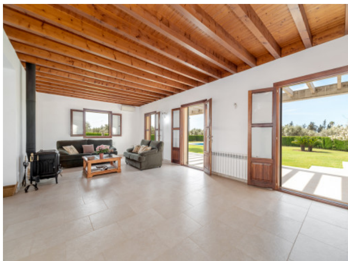
Living area with garden access