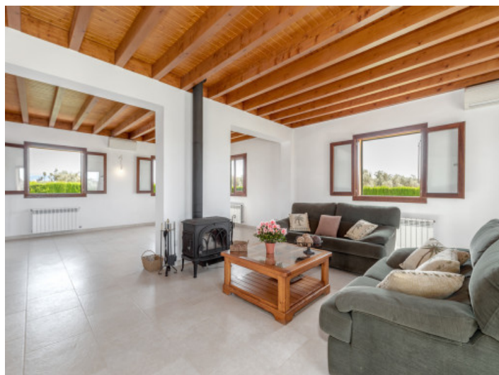
Large living area with fireplace

All information is correct to the best of our knowledge. Errors and prior sale excepted. This prospectus is purely for information purposes. Only the notarized deed of sale is legally binding.