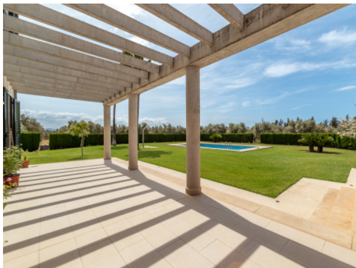
Spacious terrace with garden views