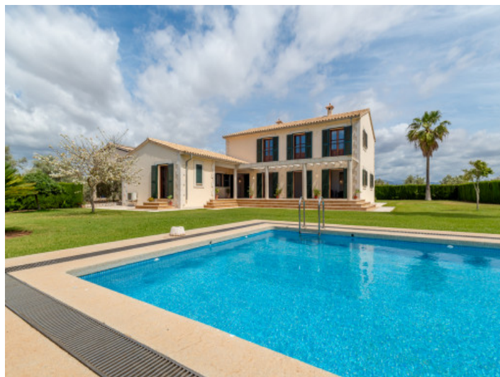
Exterior view and pool