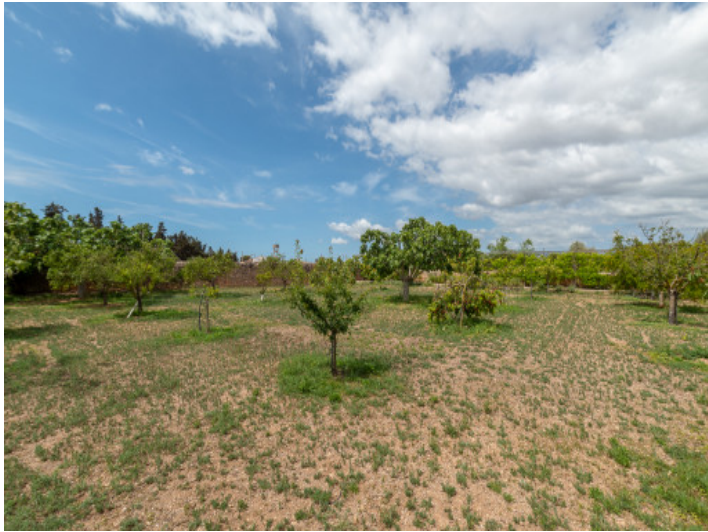
Large plot with fruit trees