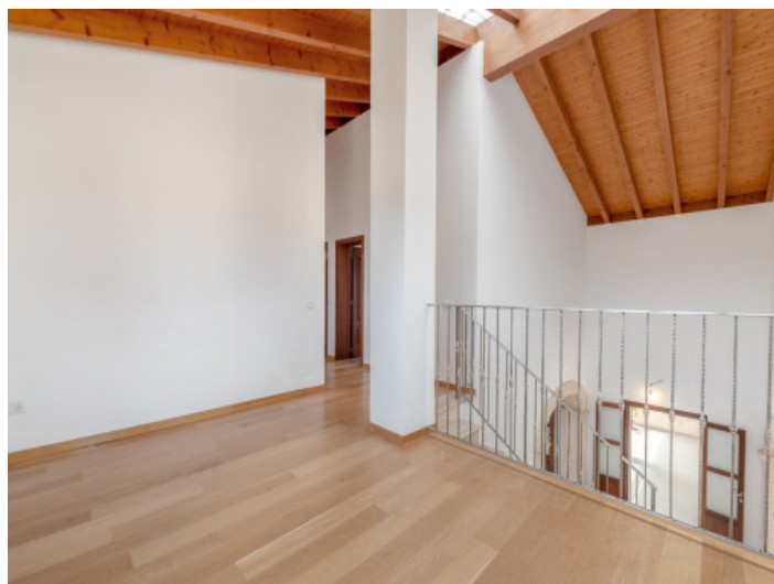
Modern gallery on the upper floor

All information is correct to the best of our knowledge. Errors and prior sale excepted. This prospectus is purely for information purposes. Only the notarized deed of sale is legally binding.