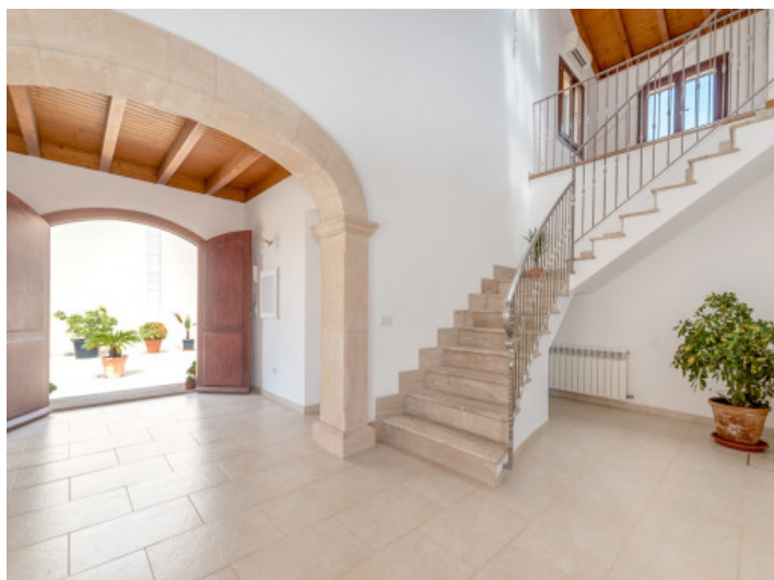
Gernous hall with stone arch