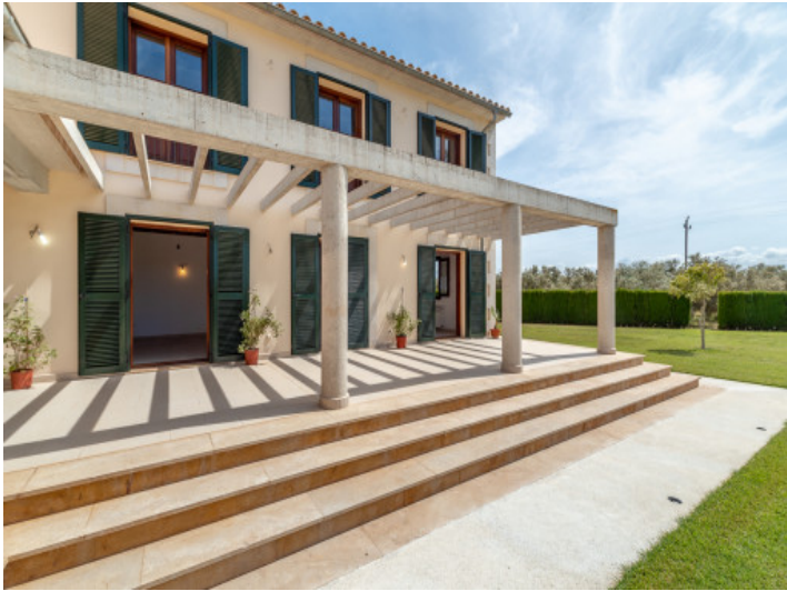
View of the terrace