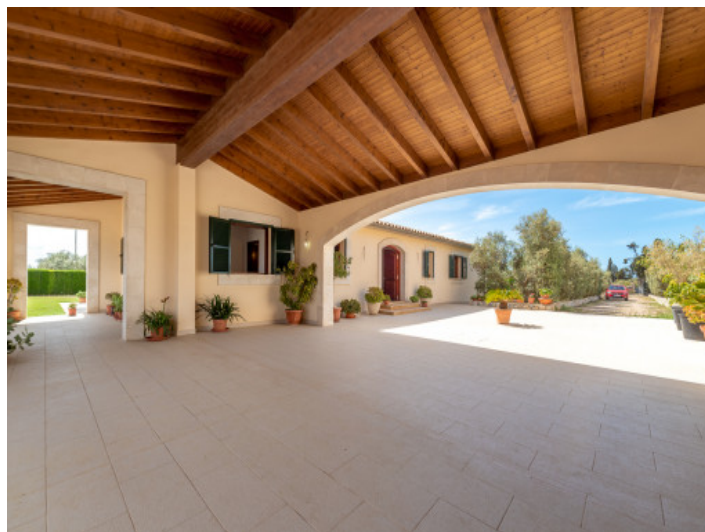
Large front terrace and access