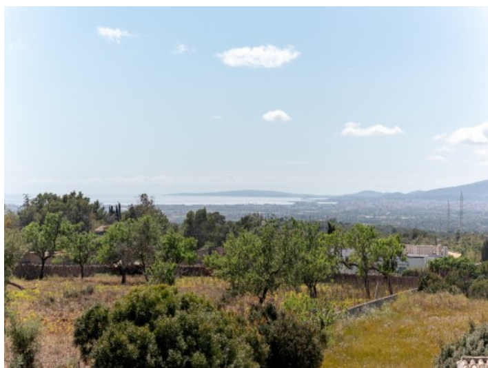
Panoramic views to the bay of Palma