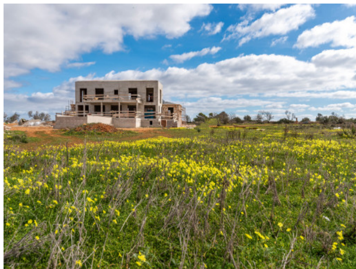
Plot and exterior view