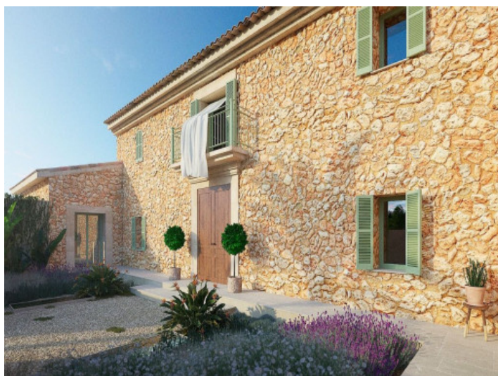
Exterior view of the finca