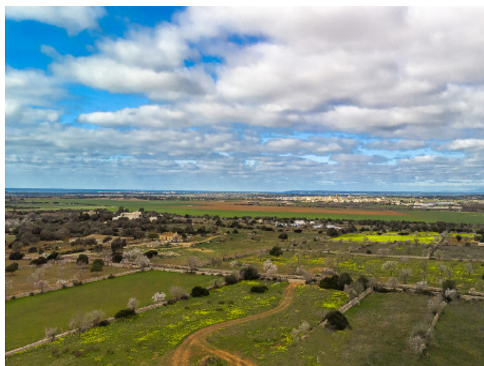
Sweeping views over the landscape