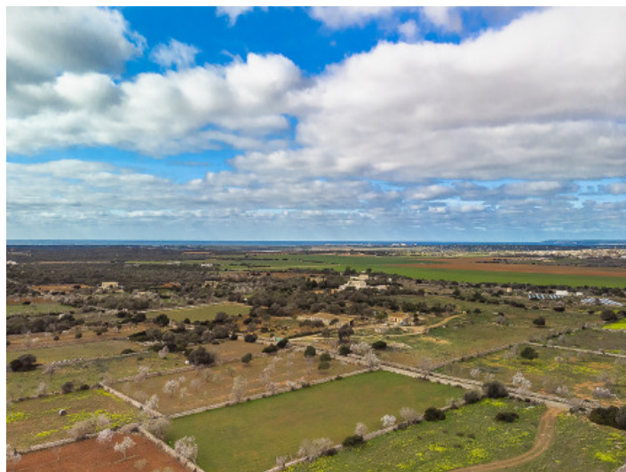
Panoramic sea views