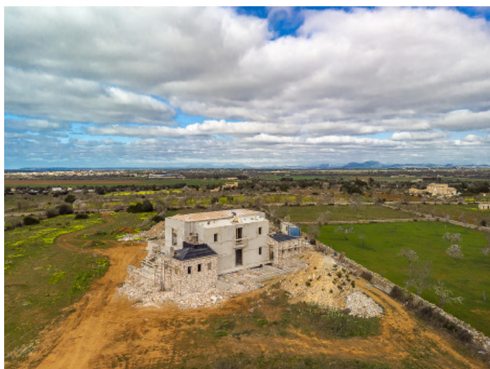
Finca from above