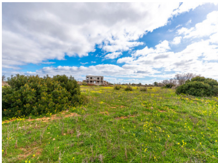
Plot and exterior view