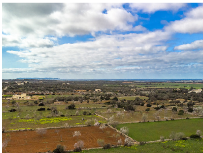
View as far as Cabrera