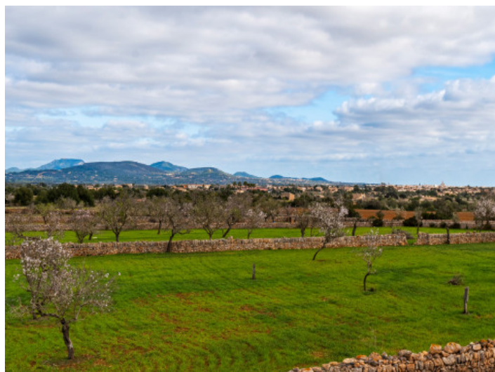
Plot with almond trees

All information is correct to the best of our knowledge. Errors and prior sale excepted. This prospectus is purely for information purposes. Only the notarized deed of sale is legally binding.