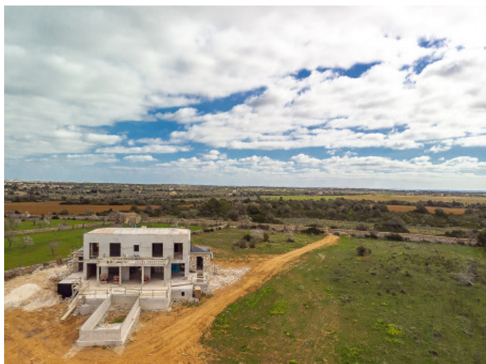
Finca from above