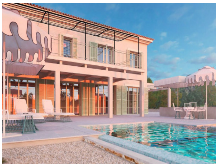
View to the pool area