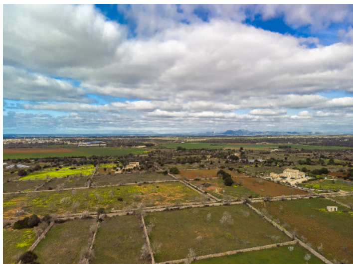
View as far as the Sierra de Tramuntana