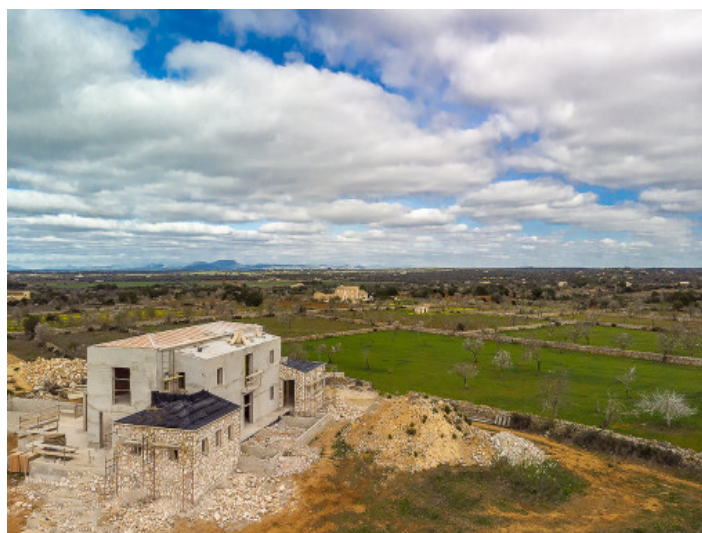
Finca from above