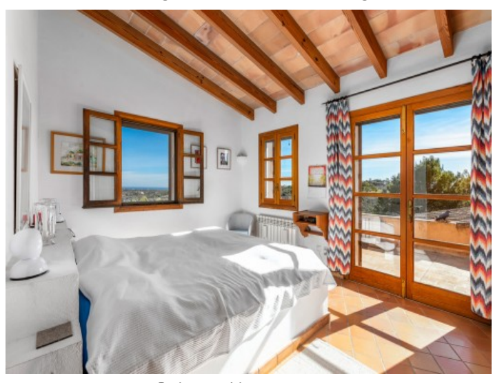
Bedroom with terrace access