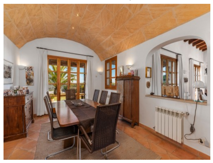
Dining area with vaulted stone ceiling