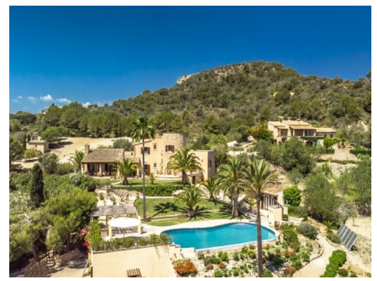
Wonderful garden and pool area