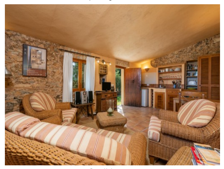
Cozy living room