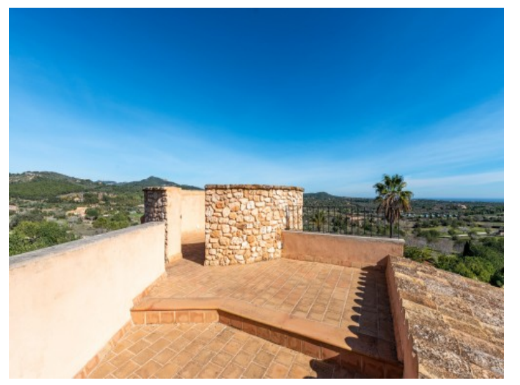
Large roof terrace