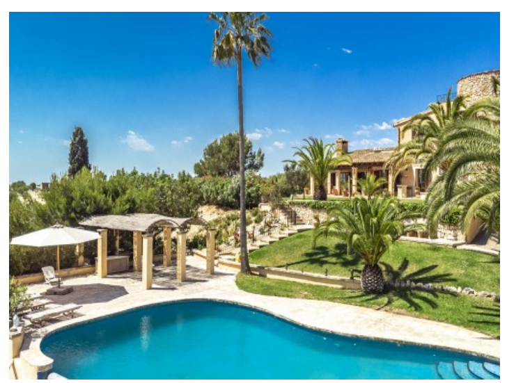
Mediterranean pool oasis