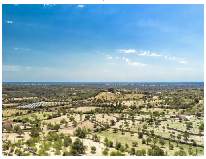
Bird's eye view