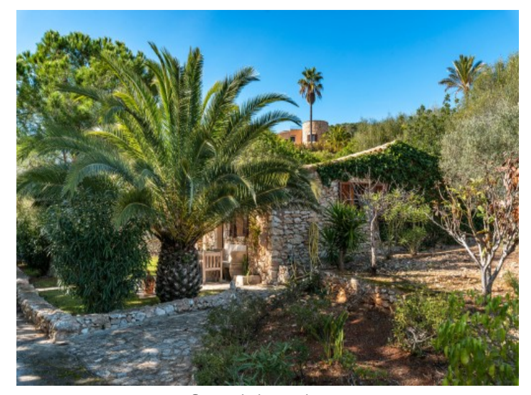
Stone-clad guest house