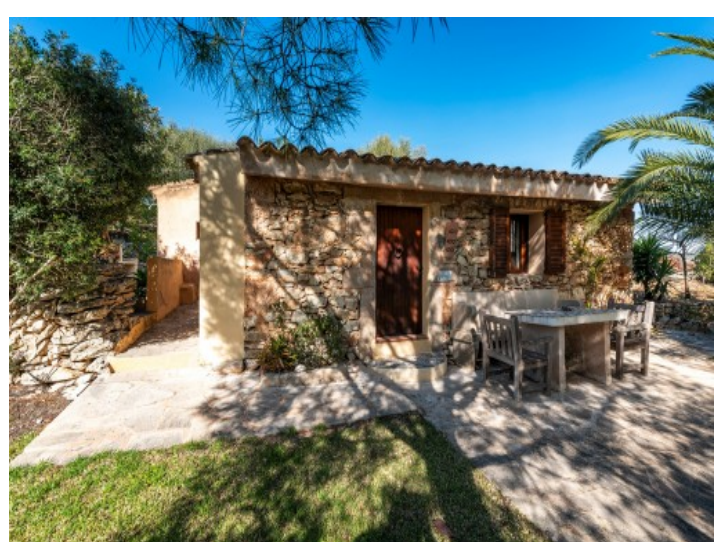
Separate guest house