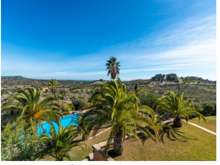
Dreamlike sweeping views