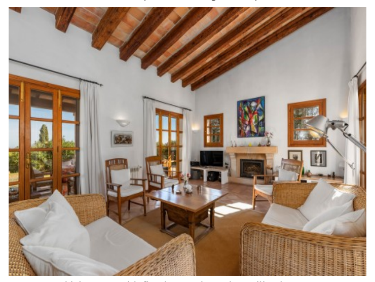
Living area with fireplace and wooden ceiling beams