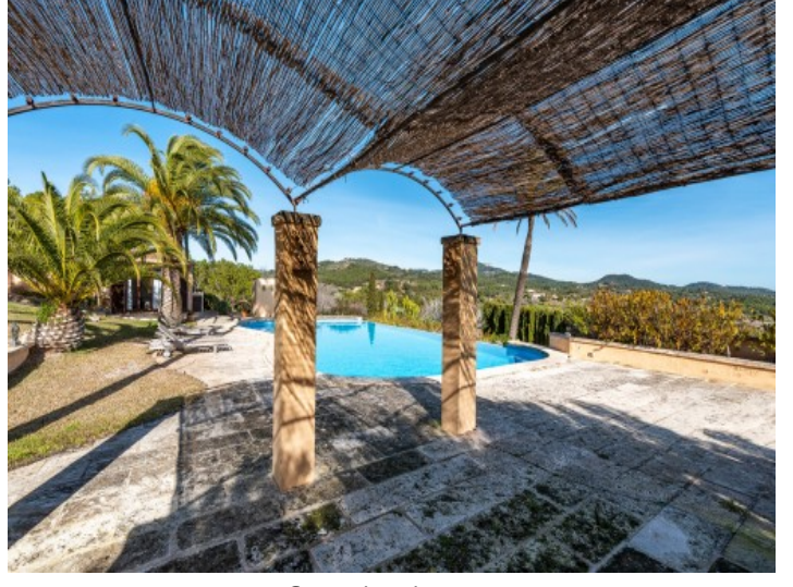
Covered pool terrace