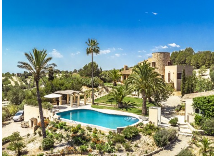
Bird's eye view