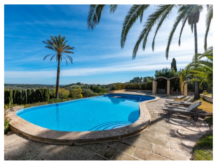
Very private pool area