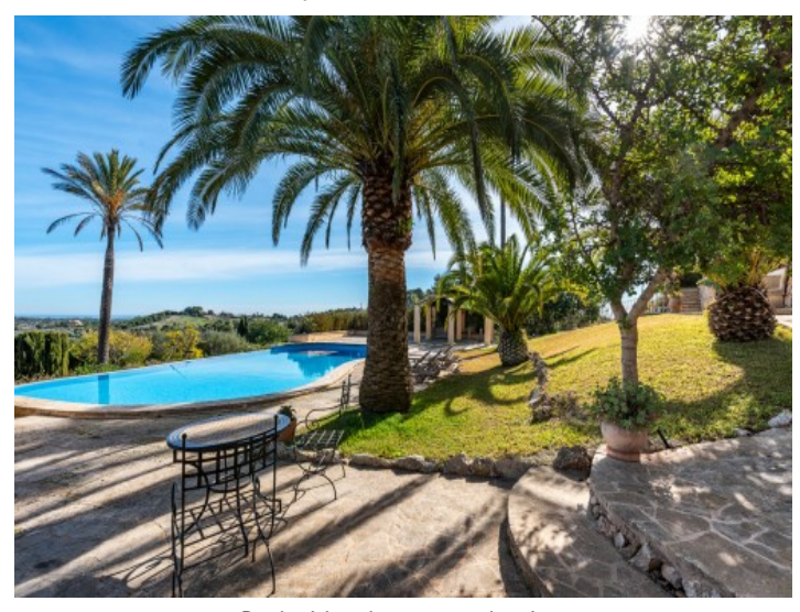
Pool with palm trees and a view