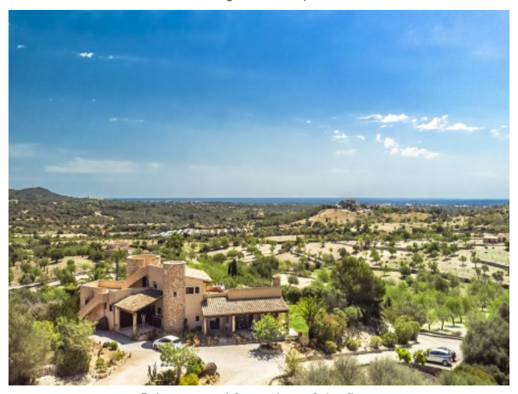
Driveway and fornt view of the finca