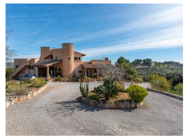
Driveway to the finca