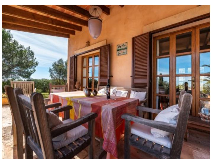
Covered outdoor dining area