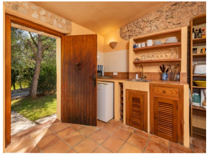
Entrance and small kitchen