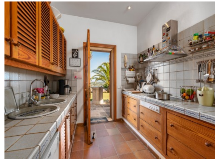
Kitchen with access to the outside