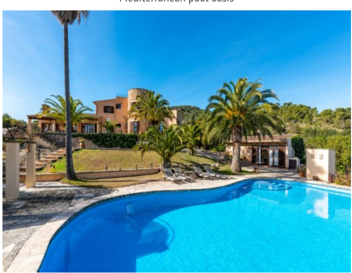
Large, tranquil pool area