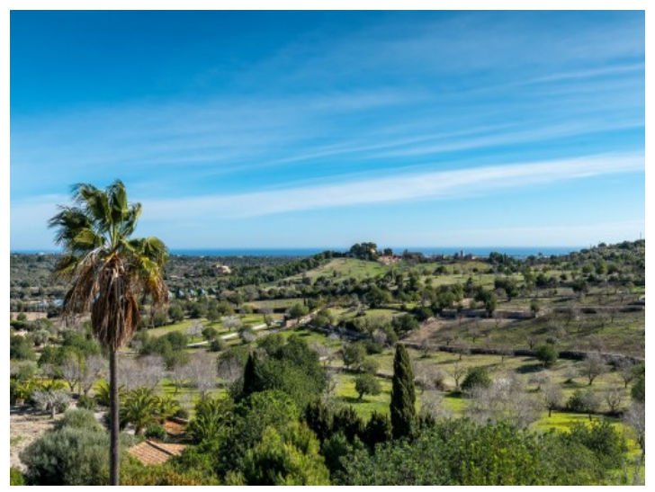
Pictursque surrounding landscape