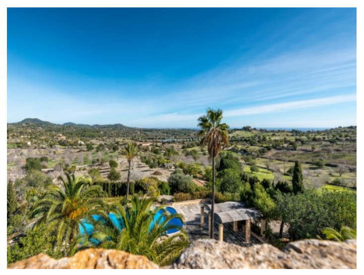
Stunning panoramic views