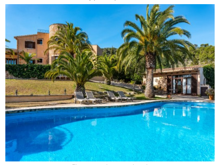
Finca, guest house and pool