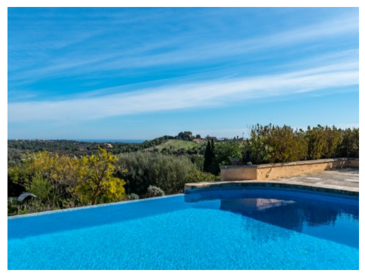
View from the pool