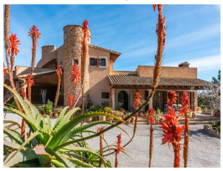
Front view and access