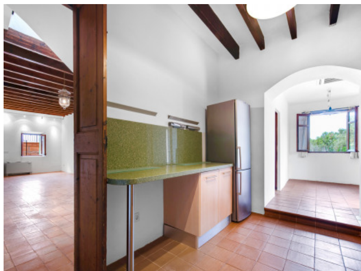
Alternative view of the kitchen

All information is correct to the best of our knowledge. Errors and prior sale excepted. This prospectus is purely for information purposes. Only the notarized deed of sale is legally binding.