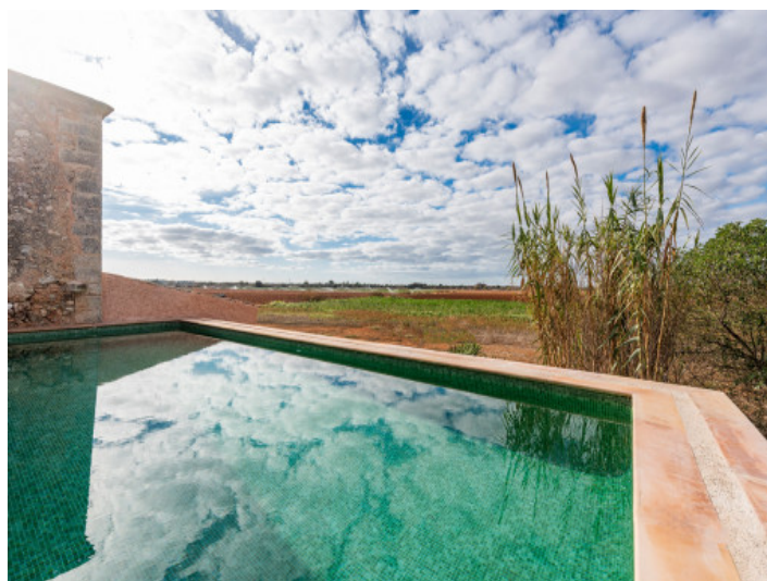
Landscape and pool views