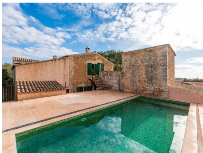
Private pool area