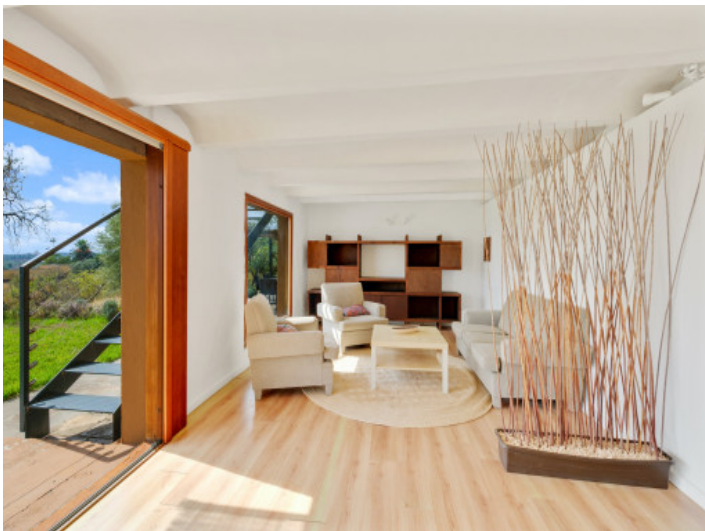
Chill out area on the lower floor