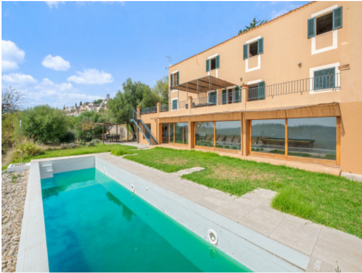
Exterior view and pool