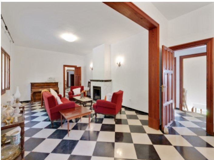
Living area on the upper floor