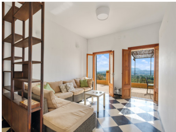
Separate living area with terrace access