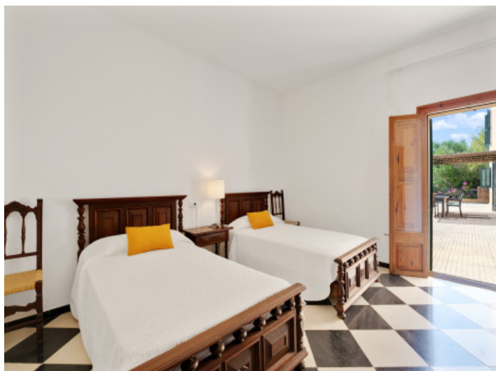
Bedroom with terrace access