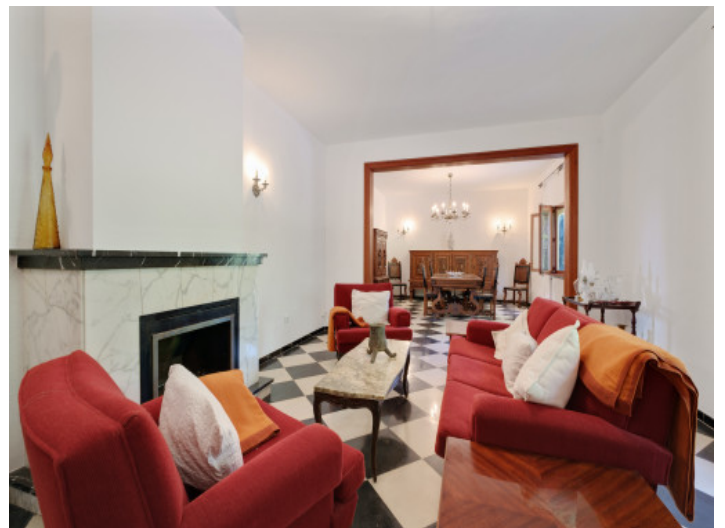
Fire place of the living area

All information is correct to the best of our knowledge. Errors and prior sale excepted. This prospectus is purely for information purposes. Only the notarized deed of sale is legally binding.