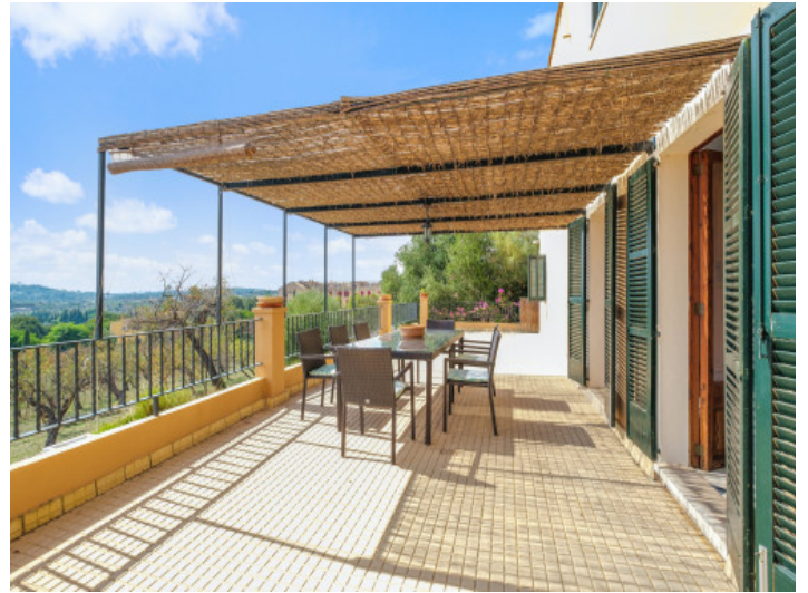
Beautiful covered terrace