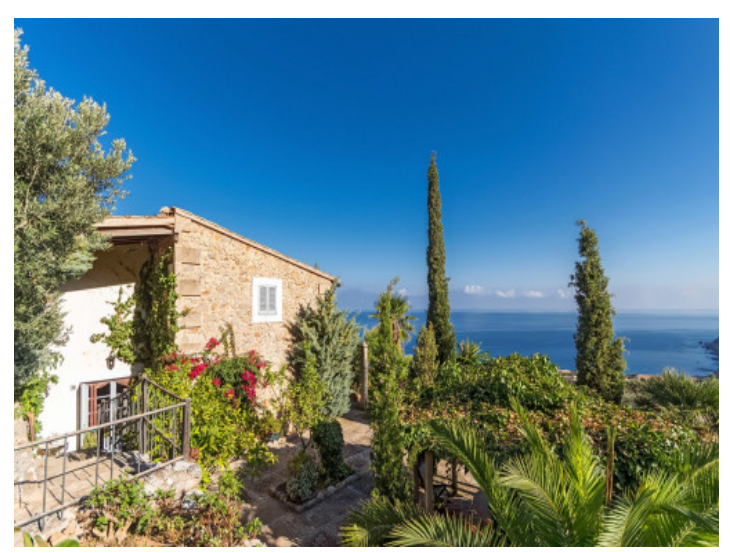
Mediterranean outdoor area