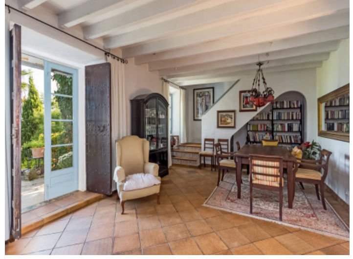
Cozy living and dining area

All information is correct to the best of our knowledge. Errors and prior sale excepted. This prospectus is purely for information purposes. Only the notarized deed of sale is legally binding.