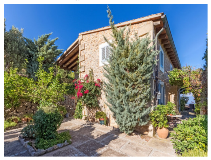
View of the stone facade