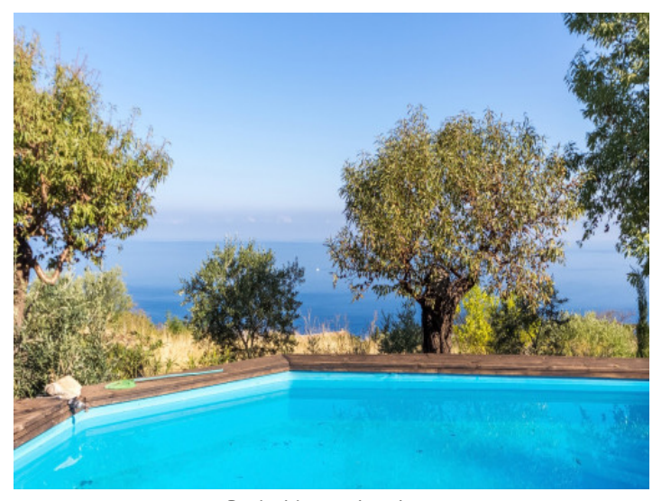
Pool with stunning views

All information is correct to the best of our knowledge. Errors and prior sale excepted. This prospectus is purely for information purposes. Only the notarized deed of sale is legally binding.