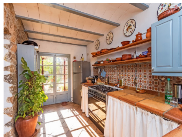
Typical mallorcan kitchen