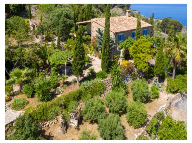
Bird's eye view of the property