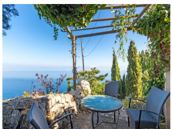
Romantic sea view terrace