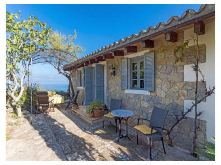
Stone terrace and access to the house