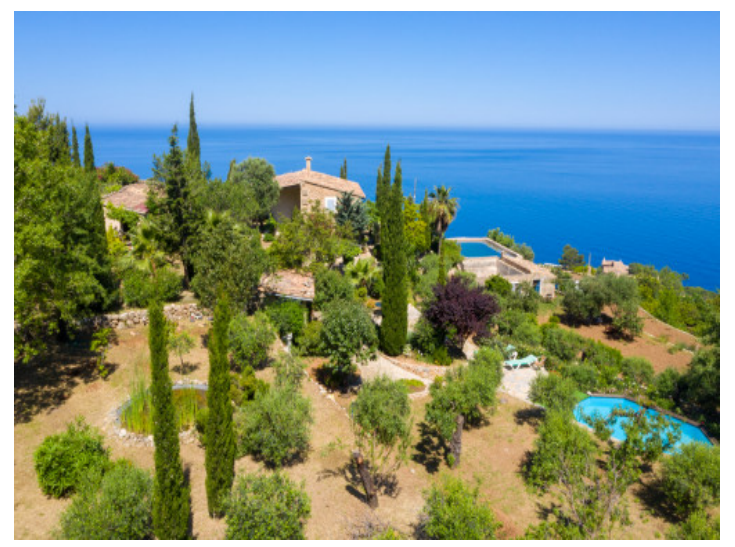
Picturesque view of the property