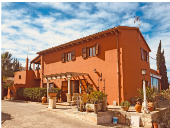
Entrance to the house