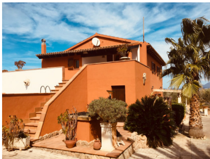
View from the south

All information is correct to the best of our knowledge. Errors and prior sale excepted. This prospectus is purely for information purposes. Only the notarized deed of sale is legally binding.