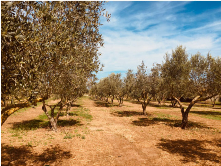
Many olive trees

All information is correct to the best of our knowledge. Errors and prior sale excepted. This prospectus is purely for information purposes. Only the notarized deed of sale is legally binding.