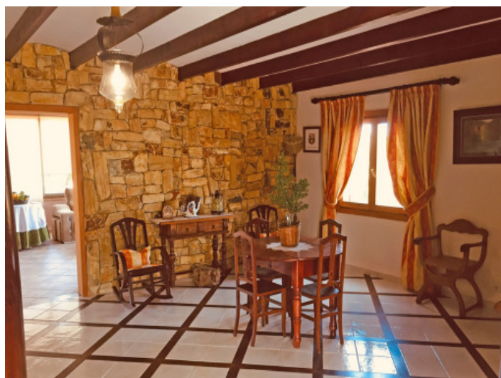
Rustic dining area