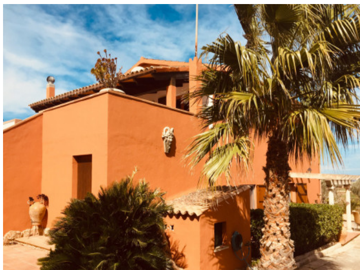
Side view of the house