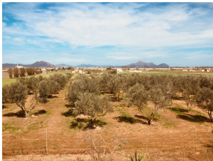
Panoramic views from the upper floor