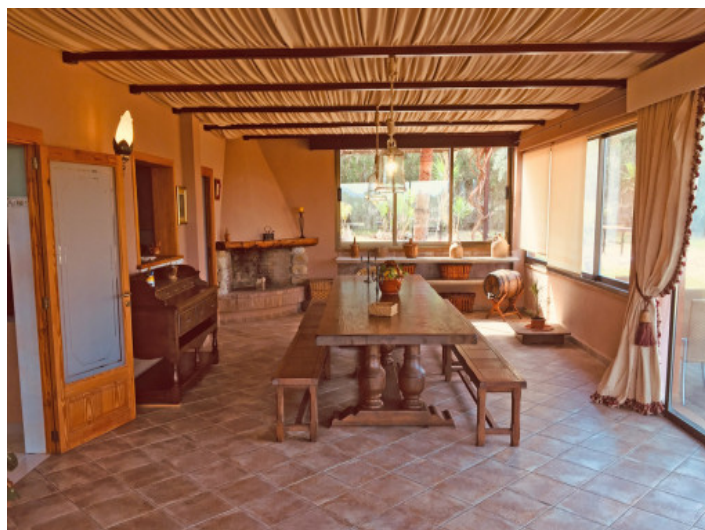
Wintergarden with spacious dining area

All information is correct to the best of our knowledge. Errors and prior sale excepted. This prospectus is purely for information purposes. Only the notarized deed of sale is legally binding.