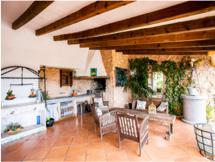
Large, covered terrace with bbq area