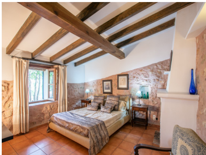
Authentic bedroom with sandstone wall