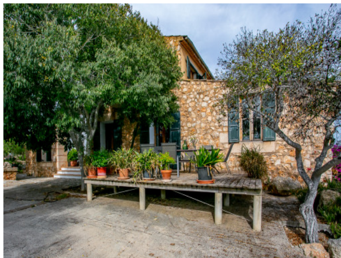
Idyllic front terrace