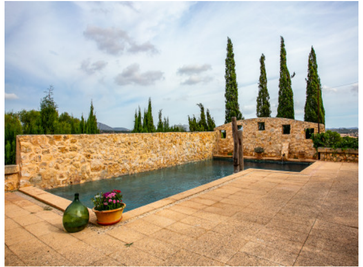
Very private pool area