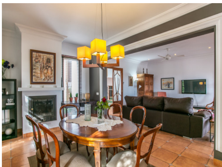
Beautiful dining area with fireplace