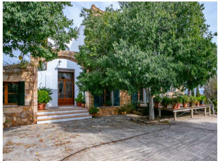
Access to the charming finca