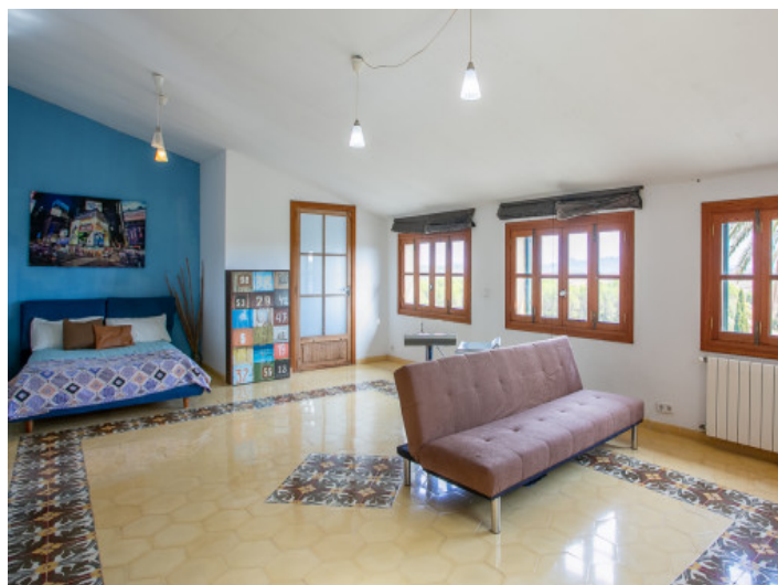
Large bedroom on the upper floor

All information is correct to the best of our knowledge. Errors and prior sale excepted. This prospectus is purely for information purposes. Only the notarized deed of sale is legally binding.