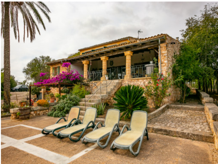
Spacious sun terrace