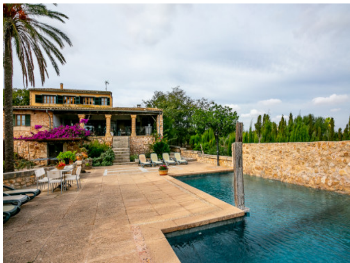
Beautiful terrace and pool area