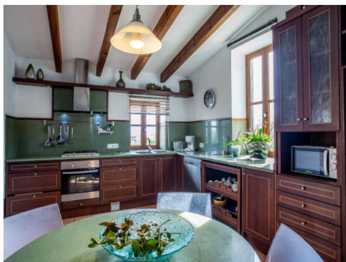
Lovely kitchen with dining area

All information is correct to the best of our knowledge. Errors and prior sale excepted. This prospectus is purely for information purposes. Only the notarized deed of sale is legally binding.