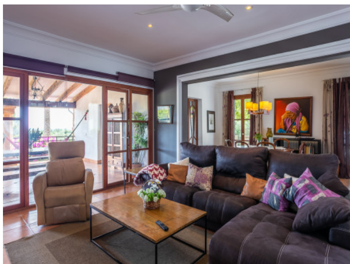
Living area with direct terrace access