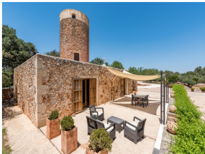
Exterior view of the beautiful stone mill finca