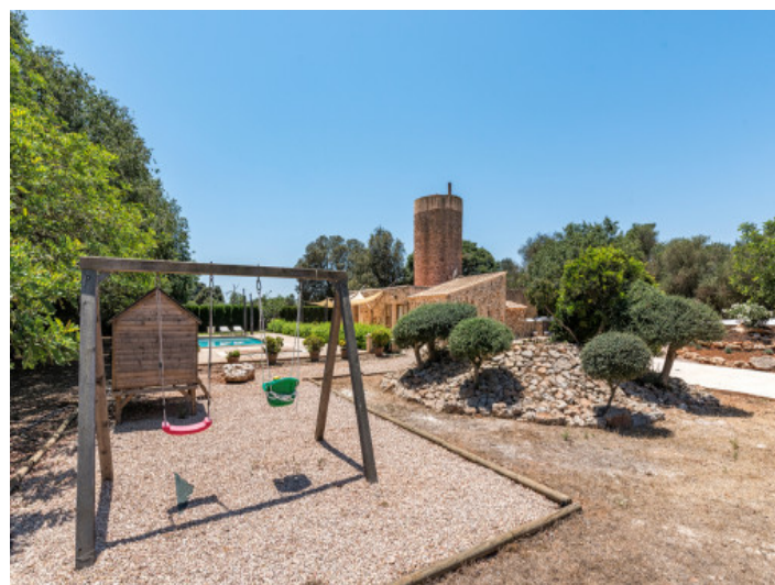
Spacious outdoor area