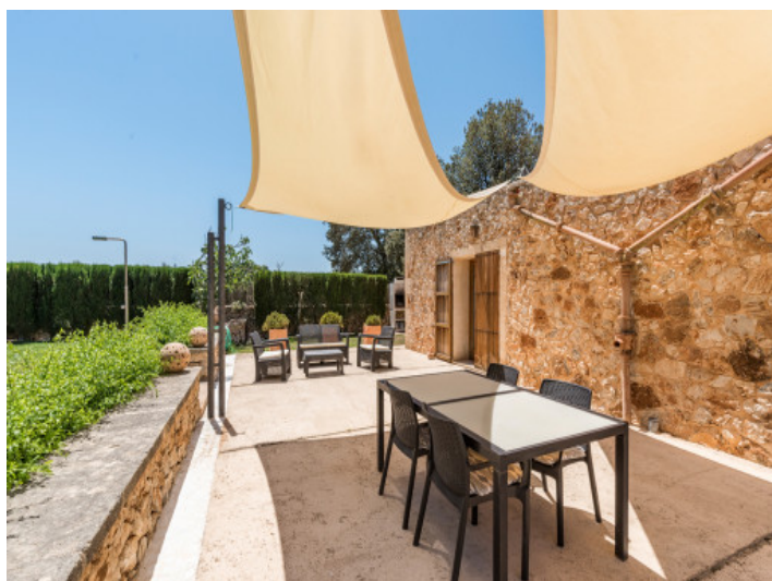
Charming dining area on the terrace