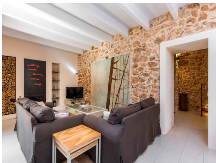
Cosy living area with natural stone wall