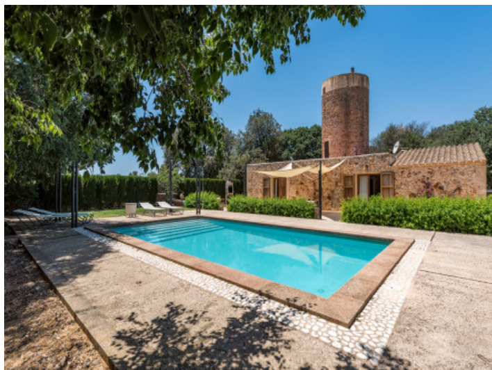
Well-tended pool area