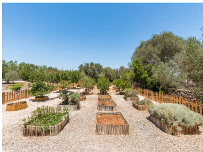
Fruit and vegetable garden