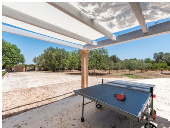
Outdoor area with many possibilities