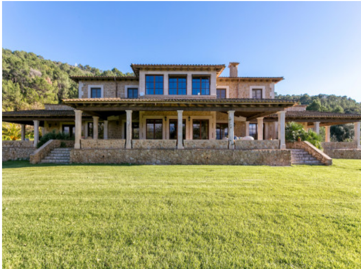
Alternative view of the property