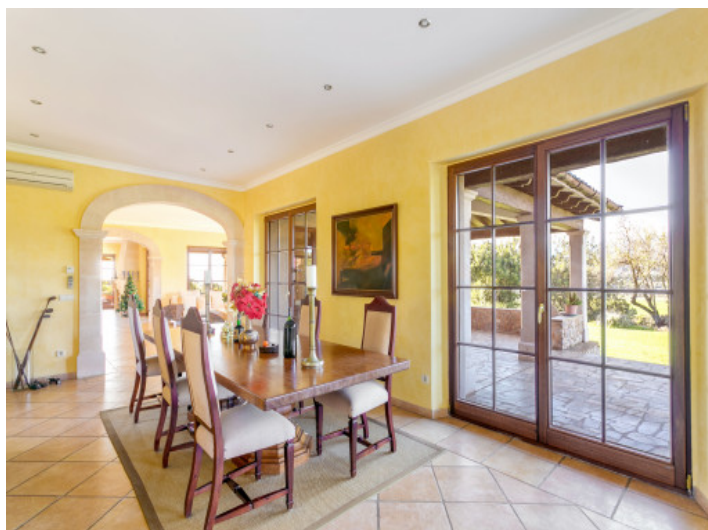
Bright dining area with access to the terrace