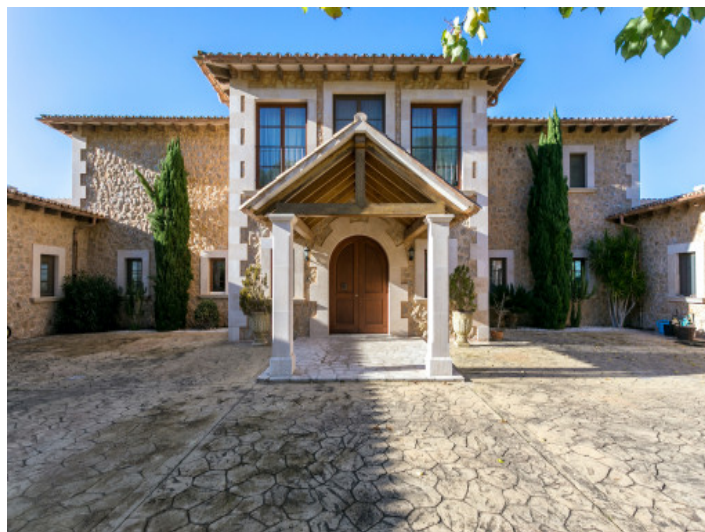
Front view of the finca