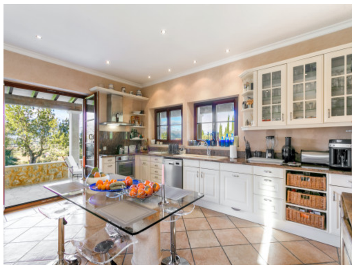
Large kitchen with further dining area

All information is correct to the best of our knowledge. Errors and prior sale excepted. This prospectus is purely for information purposes. Only the notarized deed of sale is legally binding.