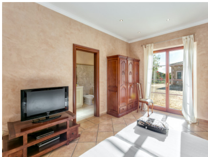
Further bedroom with bathroom en Suite