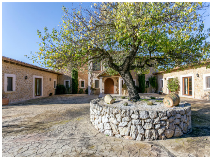
View of the beautiful patio