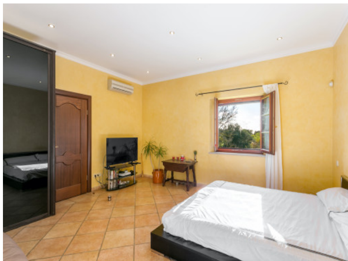
Spacious bedroom with double bed