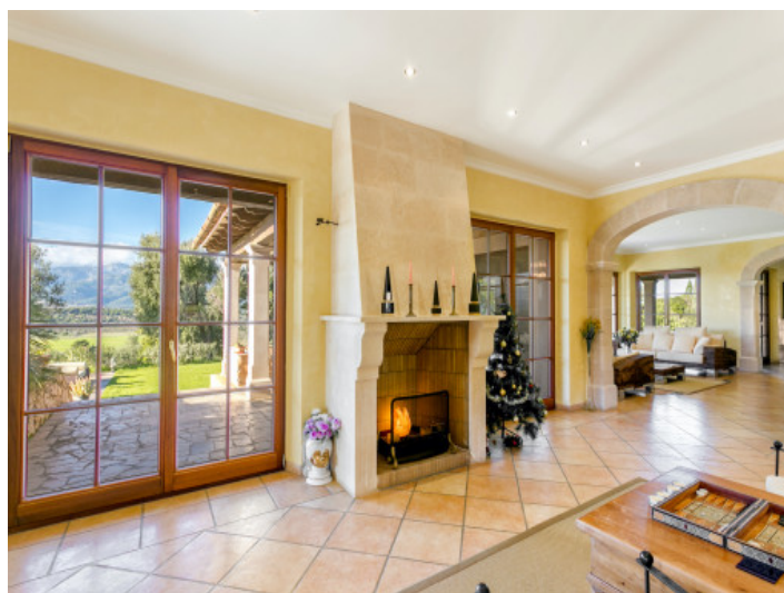
The living area creates a cosy atmosphere