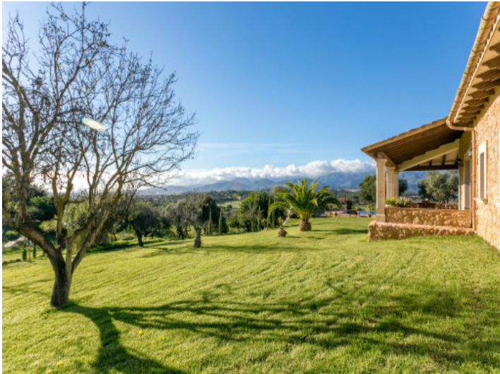
Outdoor area of the finca