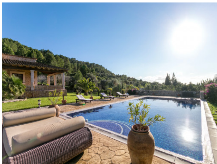
Marvelous pool area with sunbeds

All information is correct to the best of our knowledge. Errors and prior sale excepted. This prospectus is purely for information purposes. Only the notarized deed of sale is legally binding.