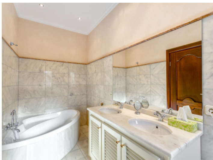
Lovely bathroom with bathtub