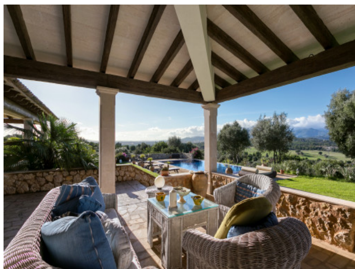
Cosy chill-out lounge on the terrace