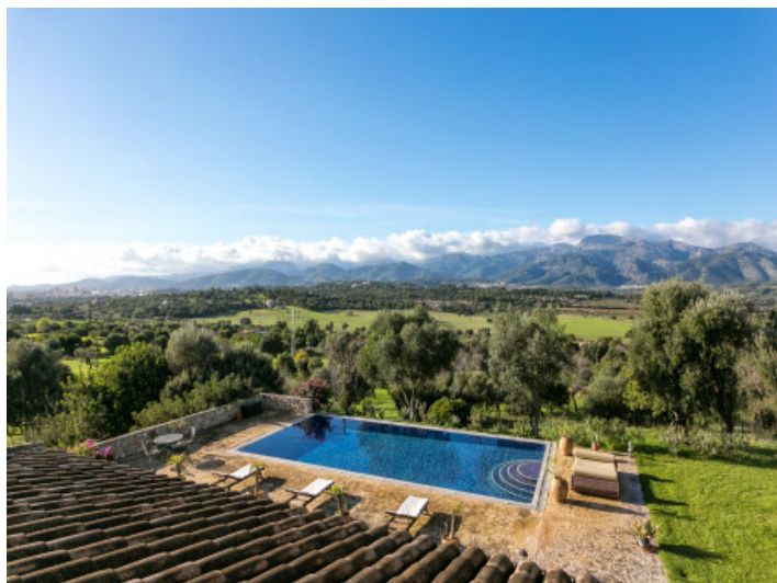
Gorgeous mountain views