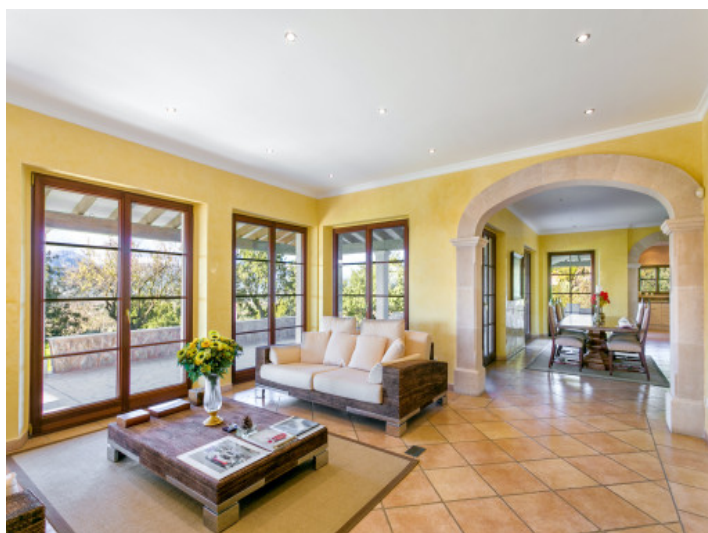
Light-flooded living area with large windows