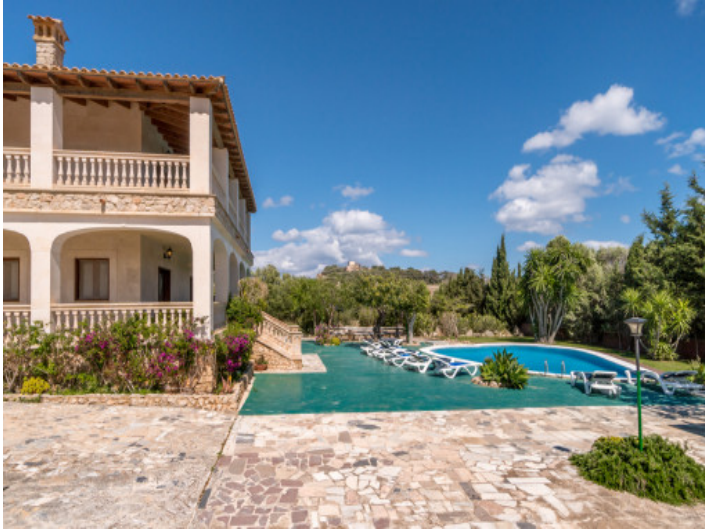
Large, private pool area