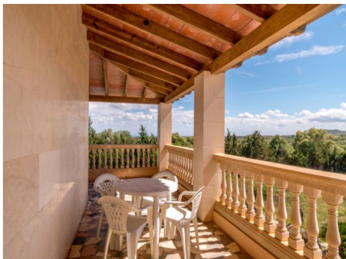
Balcony with sweeping views