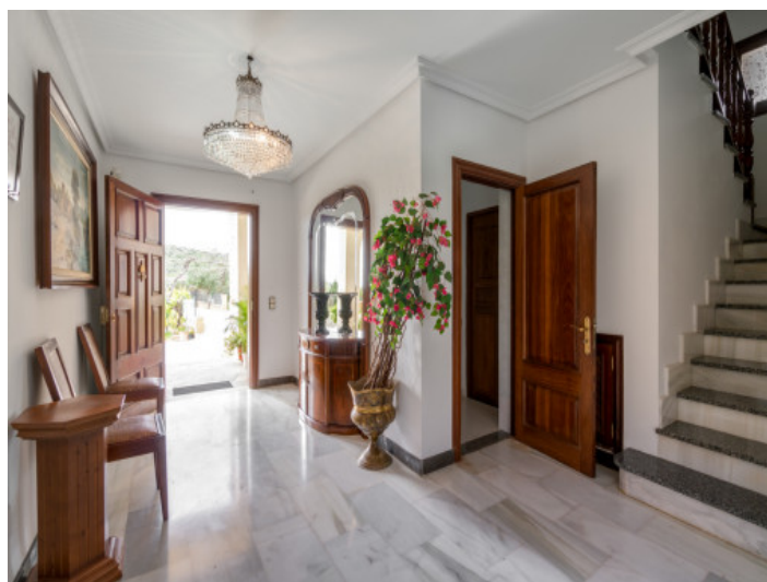
Entrance area with access to the upper floor