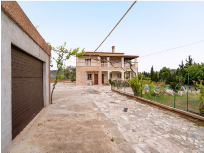
Access to the finca