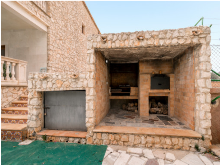
Mallorca barbecue area