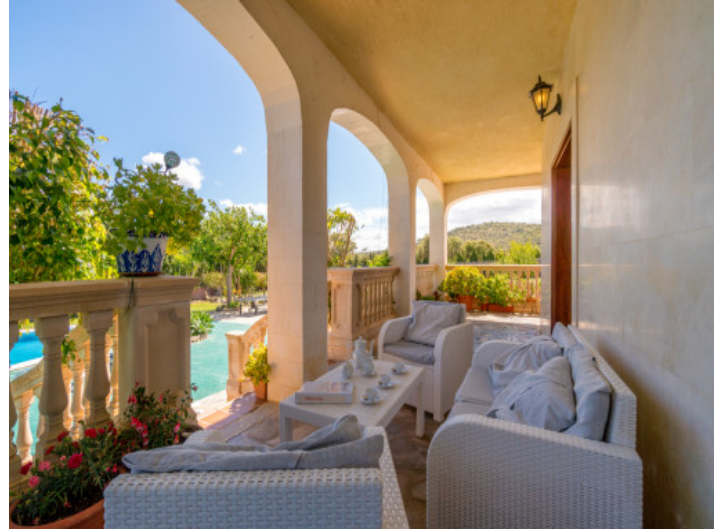
Lovely terrace with access to the pool