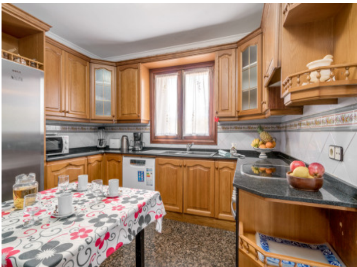
Wooden kitchen with dining area