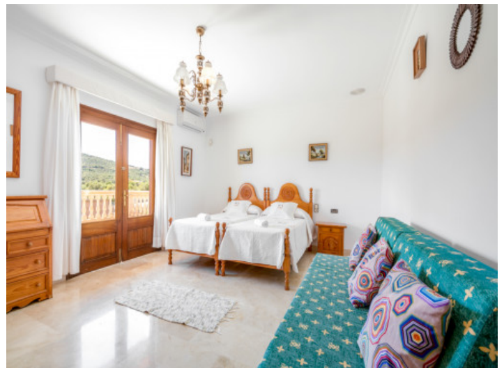
Bedroom with balcony access

All information is correct to the best of our knowledge. Errors and prior sale excepted. This prospectus is purely for information purposes. Only the notarized deed of sale is legally binding.