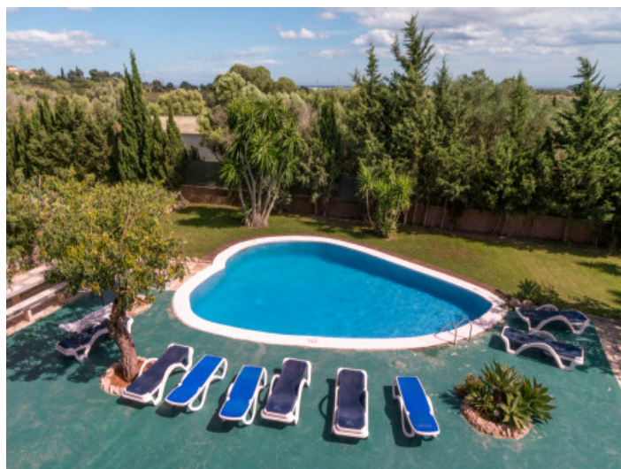
Views to the pool and garden

All information is correct to the best of our knowledge. Errors and prior sale excepted. This prospectus is purely for information purposes. Only the notarized deed of sale is legally binding.