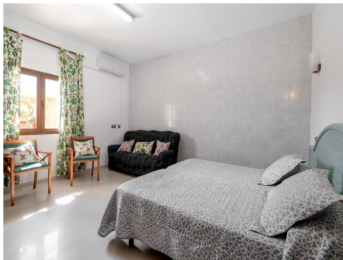
Bedroom with separate entrance