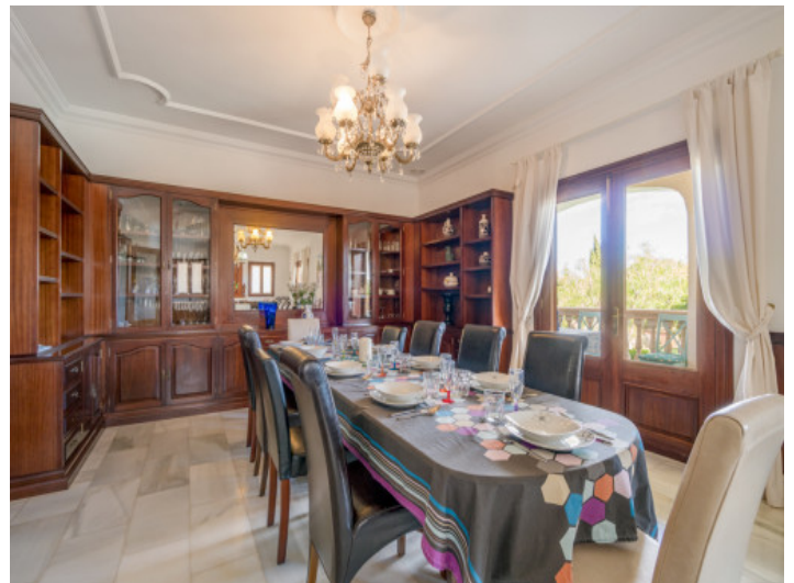
Spacious dining area