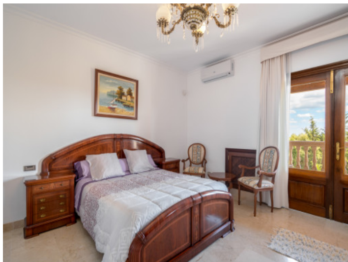
One of 5 double bedrooms