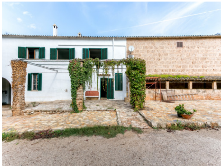
Front view of the rustic finca