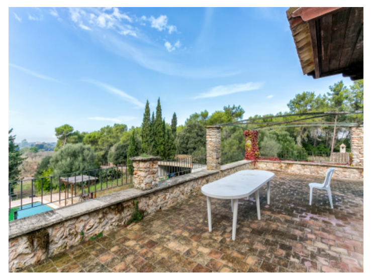
Spacious terrace with pool views