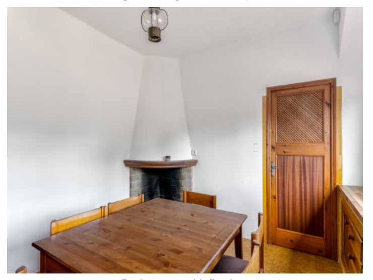
Further room with fireplace