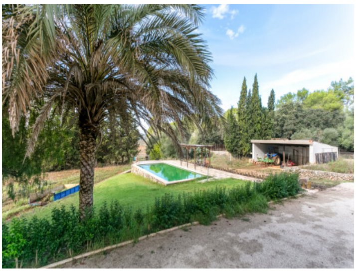
Pool area with small shed