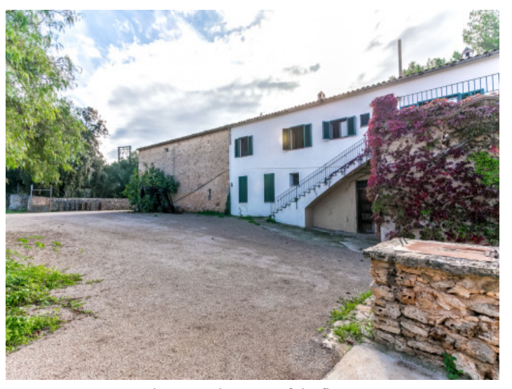
Large outdoor area of the finca

All information is correct to the best of our knowledge. Errors and prior sale excepted. This prospectus is purely for information purposes. Only the notarized deed of sale is legally binding.