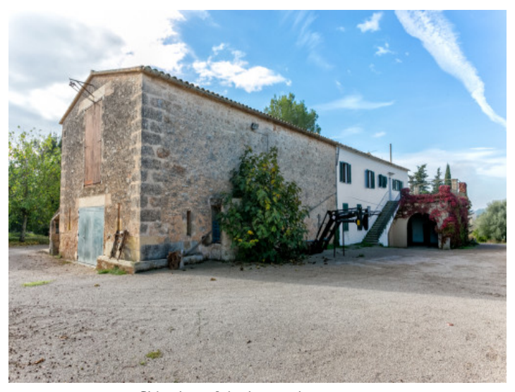
Side view of the impressive property