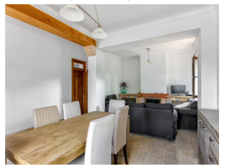
Living and dining area with fireplace