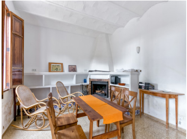
Charming dining area with fireplace