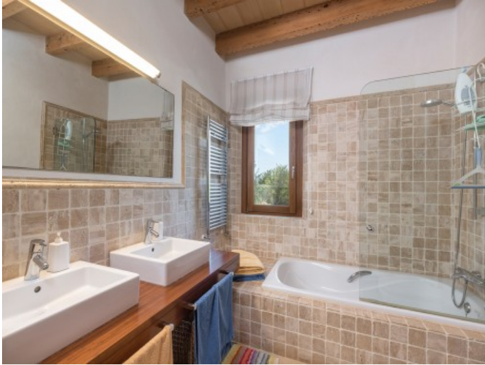
Charming bathroom with double sink and bathtub