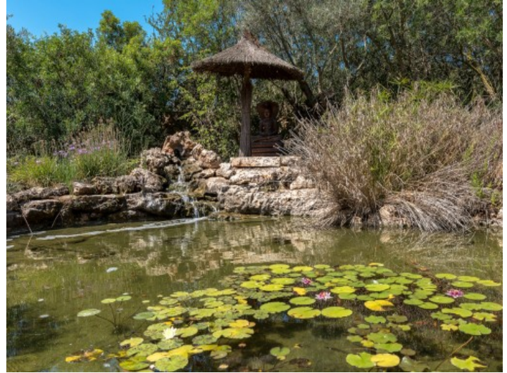
This artificial pond is part of the outdoor area