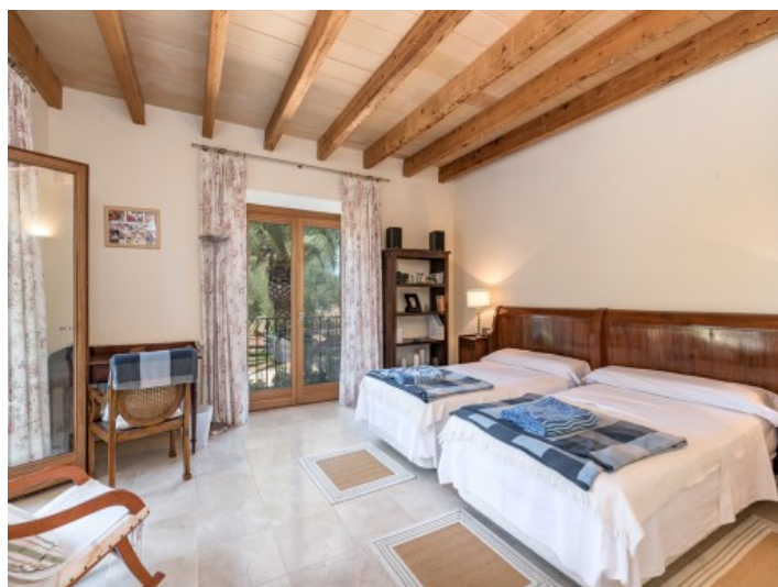
Another bedroom with access to the outdoor area