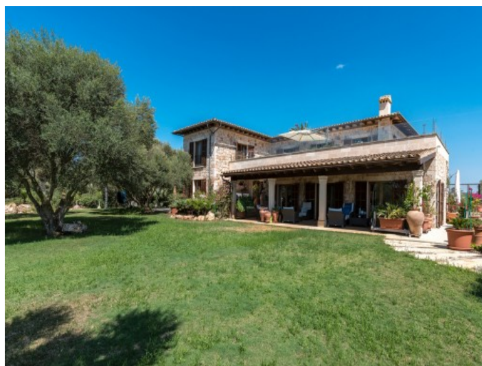
Fantastic garden area