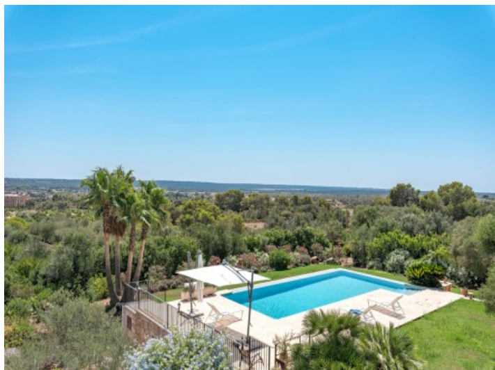
View from the terrace to the kempt pool area