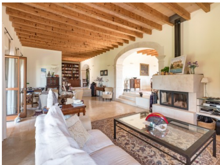
Alternative view of the living area