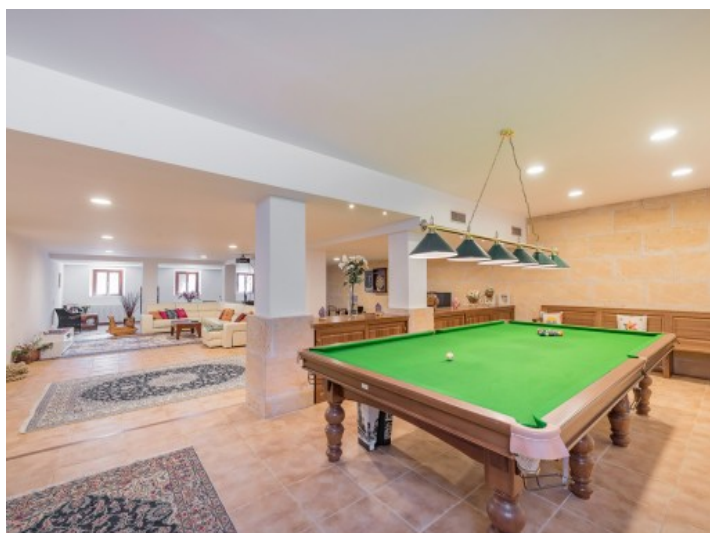
Extensive poolroom with lounge area