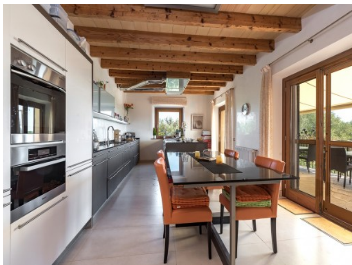
Modern and fully equipped kitchen

All information is correct to the best of our knowledge. Errors and prior sale excepted. This prospectus is purely for information purposes. Only the notarized deed of sale is legally binding.