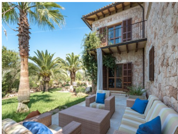
Another terrace of the finca with lounge furniture

All information is correct to the best of our knowledge. Errors and prior sale excepted. This prospectus is purely for information purposes. Only the notarized deed of sale is legally binding.