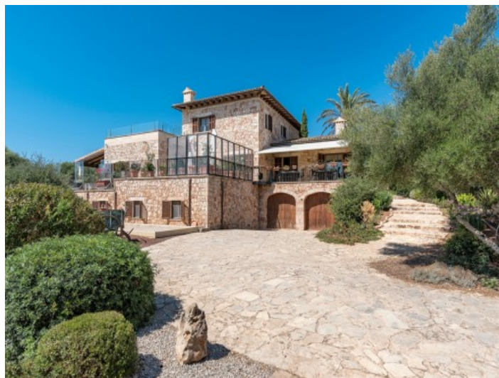
Front view of the finca with several terraces