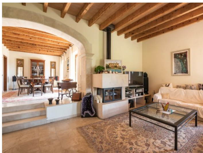
Rustic living room with fireplace for colder days