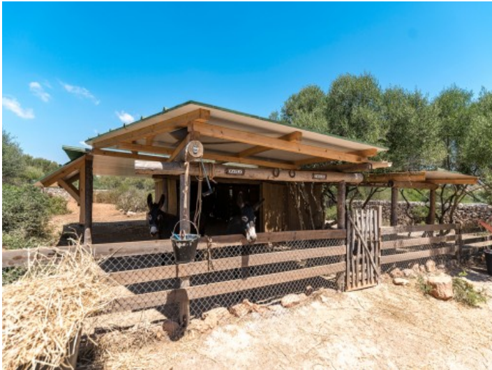
Stable for horses or donkeys