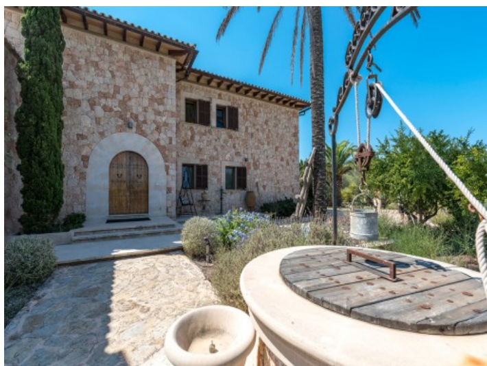
Welcoming entrance area with font