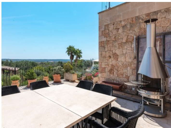
Sun terrace with BBQ area