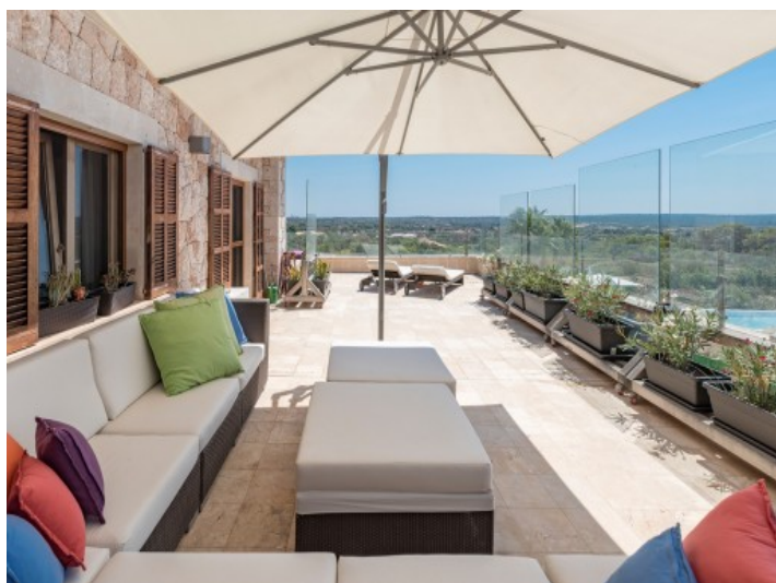
Lounge area with stunning view to the pool