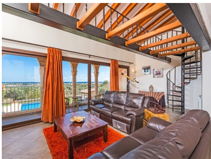
Bright living area on the upper floor