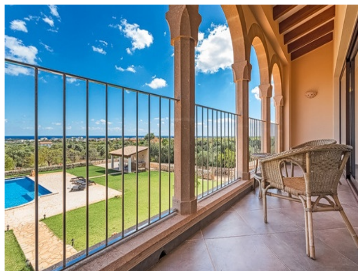
Beautiful sea views