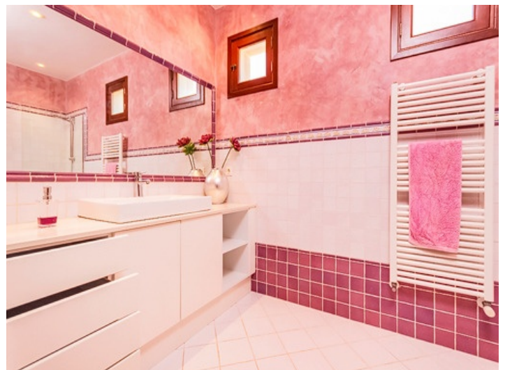
Further bathroom with heating