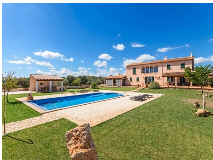
Finca with large plot of 21,000 sqm