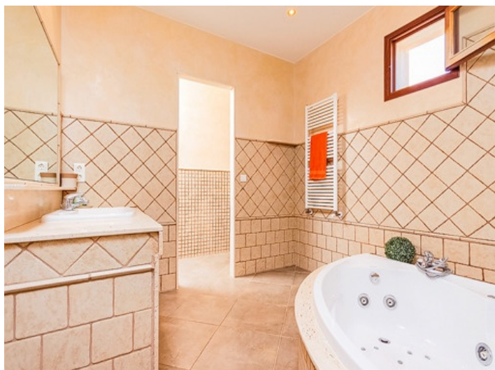
Master bathroom with bath tub