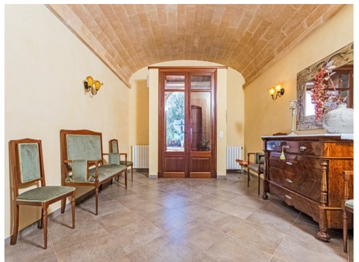
Antique entrance area

All information is correct to the best of our knowledge. Errors and prior sale excepted. This prospectus is purely for information purposes. Only the notarized deed of sale is legally binding.