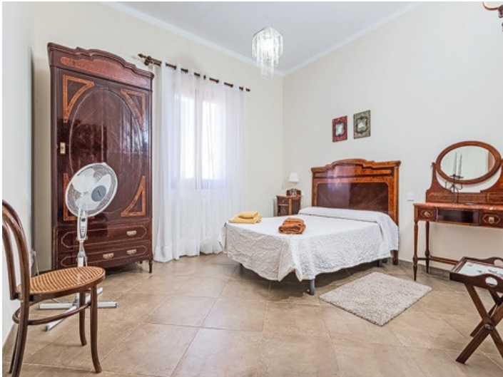
One of six bedrooms