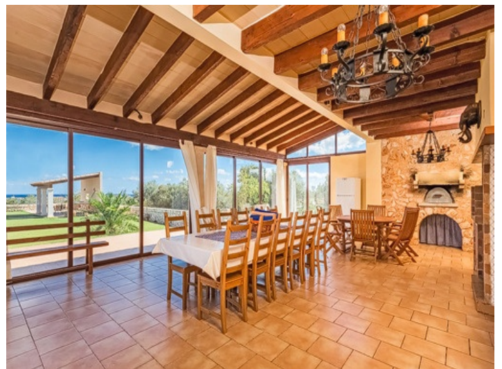
Alternative view of the dining area