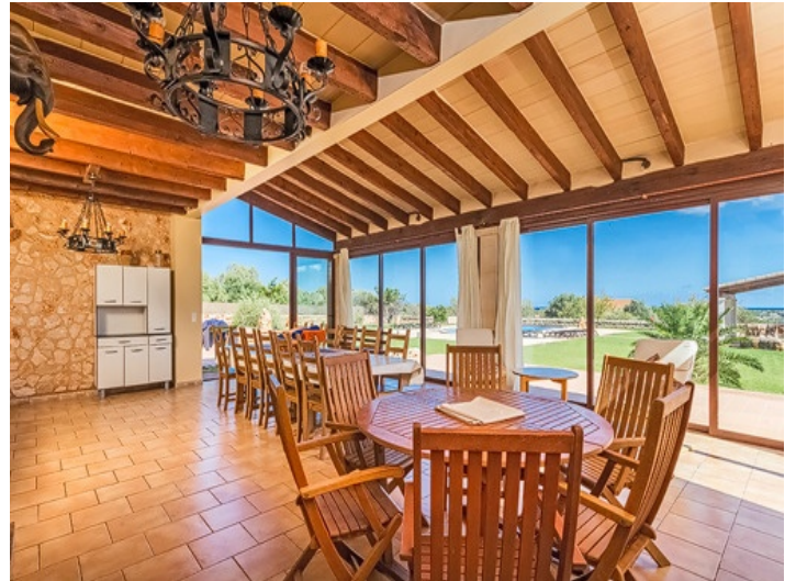
Covered terrace with panoramic windows