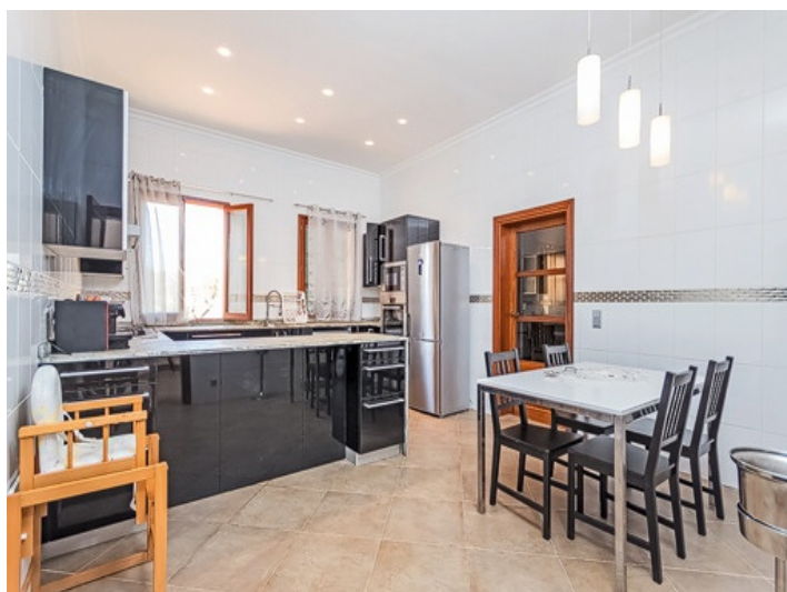
Alternative view of the kitchen