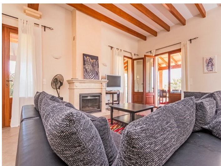
Cosy living area with fireplace