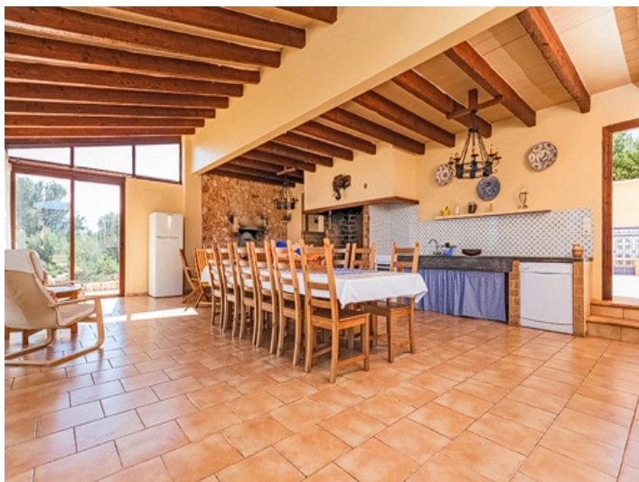
Spacious dining area