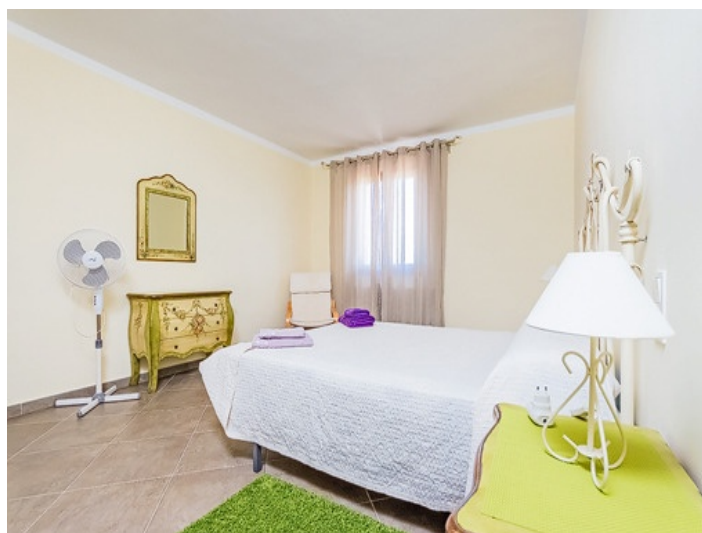
Spacious master bedroom