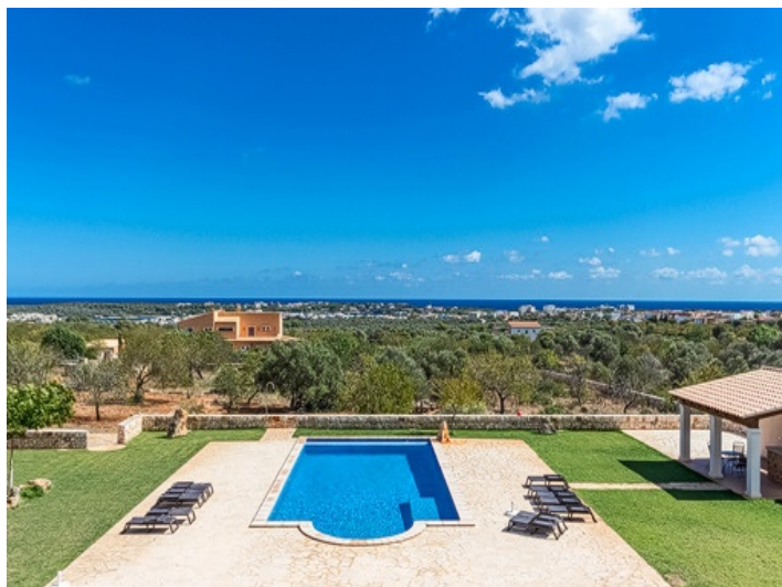
Fantastic view of the sea and the garden