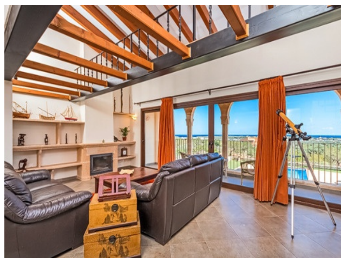
Light-flooded living area with fireplace

All information is correct to the best of our knowledge. Errors and prior sale excepted. This prospectus is purely for information purposes. Only the notarized deed of sale is legally binding.