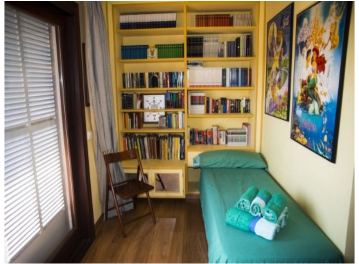
Guest bedroom with functional bunk bed