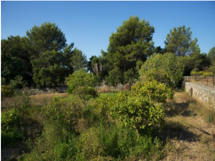
Views of the pool house and pool area