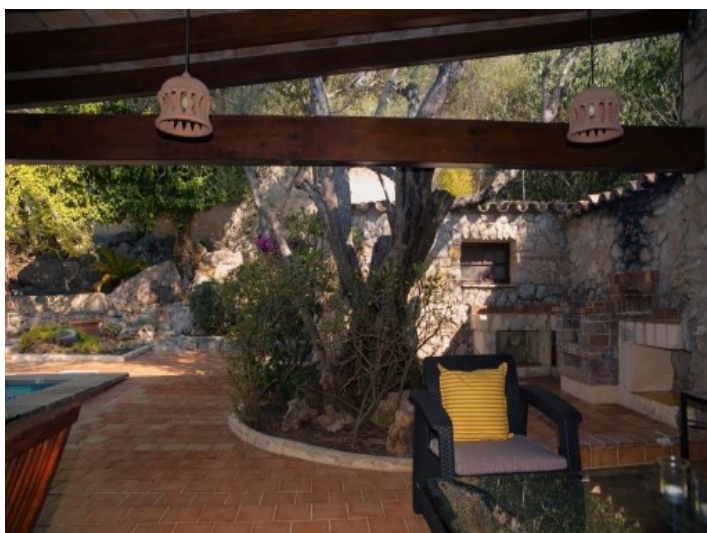
The property is surrounded by nature