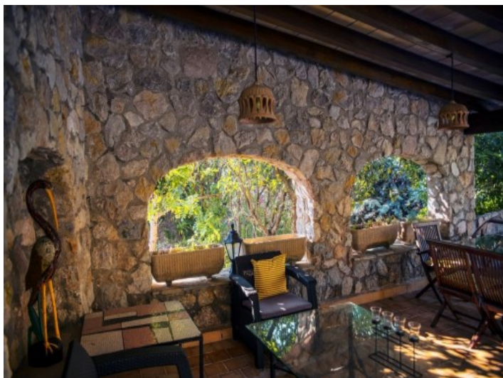
Covered chill-out area