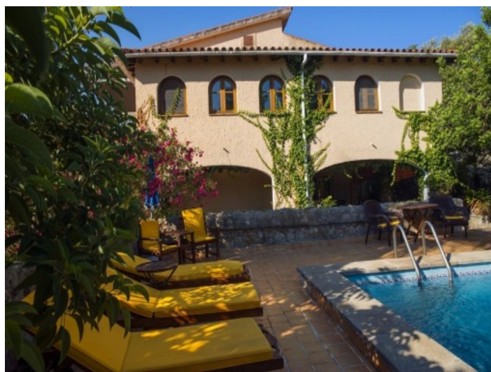
Barbecue area next to the pool