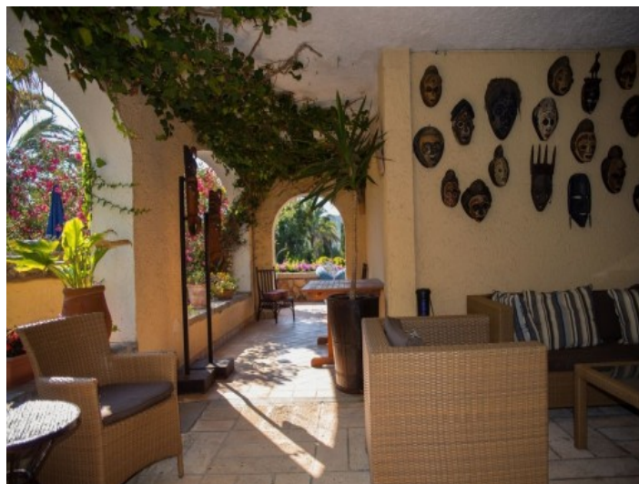
2 separate houses offer further space for guests