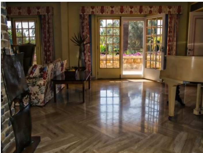
Small library with arm chairs