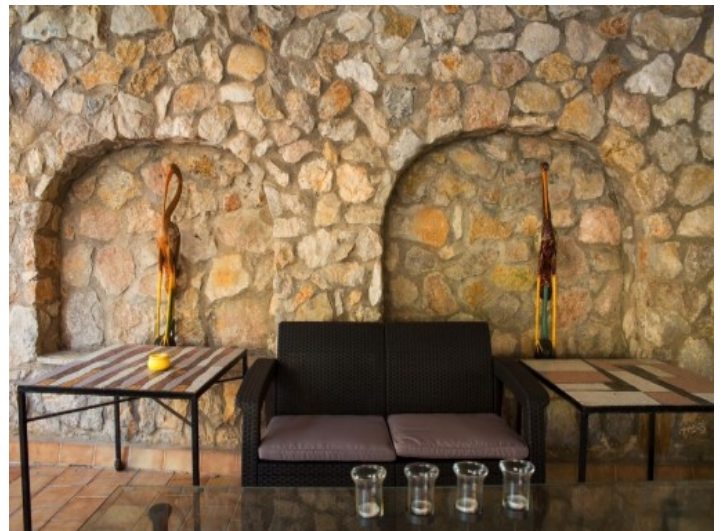
Extravagant interior design