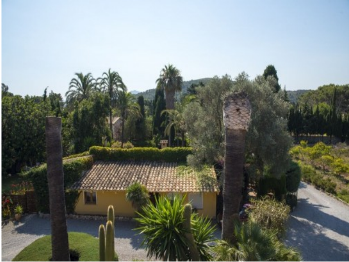
Views from the balcony