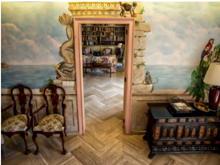
Alternative views of the guest room