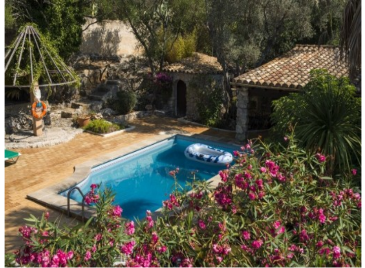
Separate guest house of the finca