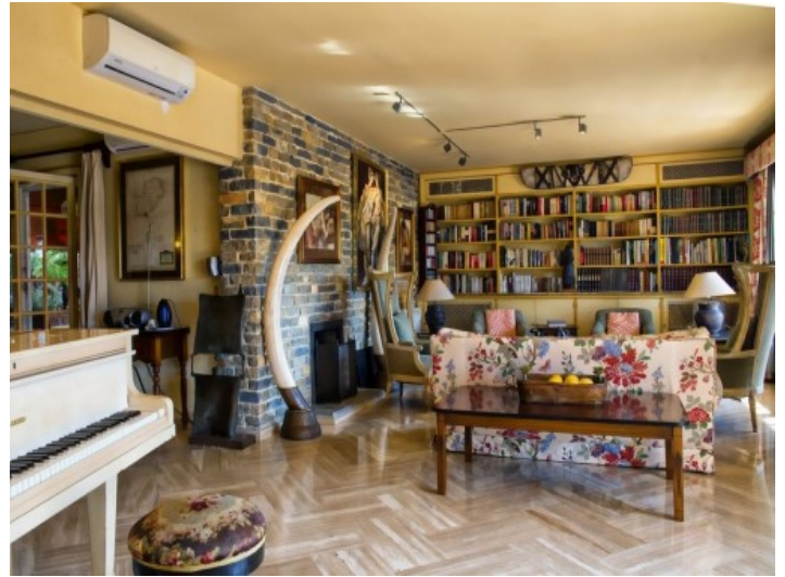
Great views from the balcony