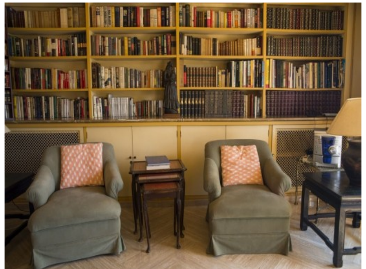
A nature stonewall decorates the living area