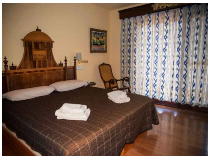
Antique master bedroom