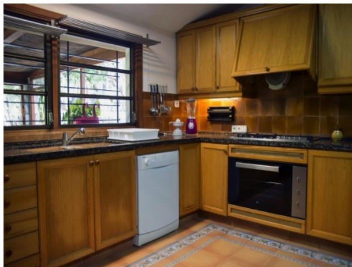
Alternative views of the dining area