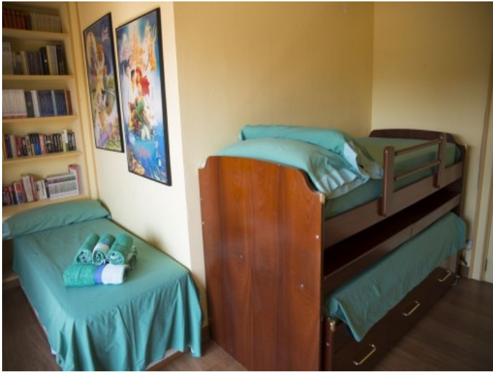
Second master bedroom