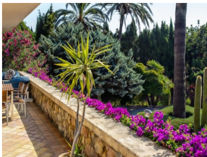
Inviting sunloungers in the pool area

All information is correct to the best of our knowledge. Errors and prior sale excepted. This prospectus is purely for information purposes. Only the notarized deed of sale is legally binding.