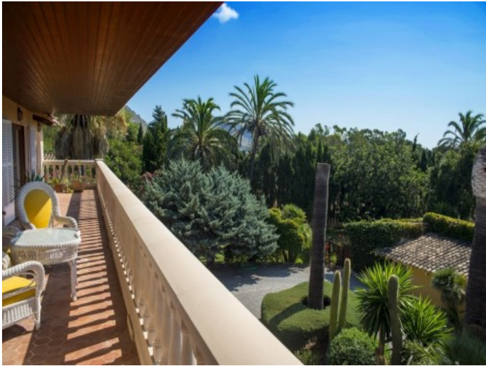
Long driveway to the property