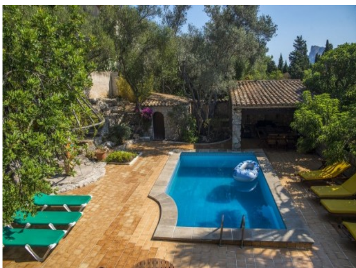
Main pool area of the finca