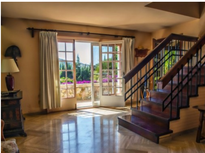
The property offers several lounge areas