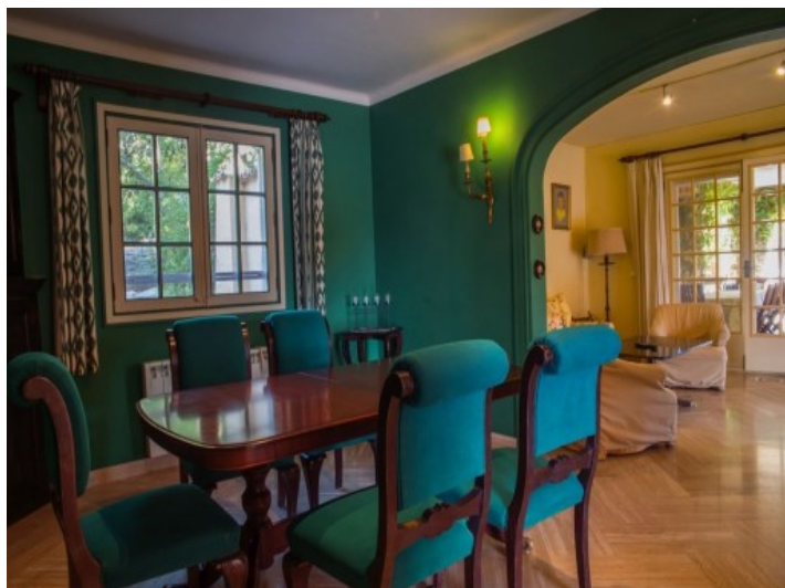
Dining area in green