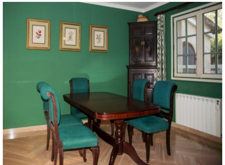
Access to the terrace

All information is correct to the best of our knowledge. Errors and prior sale excepted. This prospectus is purely for information purposes. Only the notarized deed of sale is legally binding.