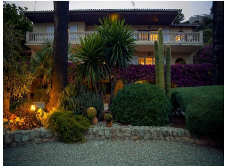
Garden area of the property