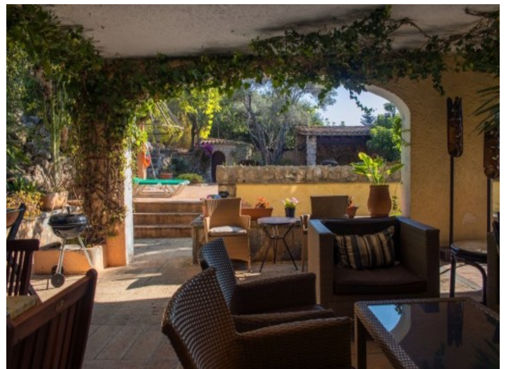
Staircase to the bedrooms

All information is correct to the best of our knowledge. Errors and prior sale excepted. This prospectus is purely for information purposes. Only the notarized deed of sale is legally binding.