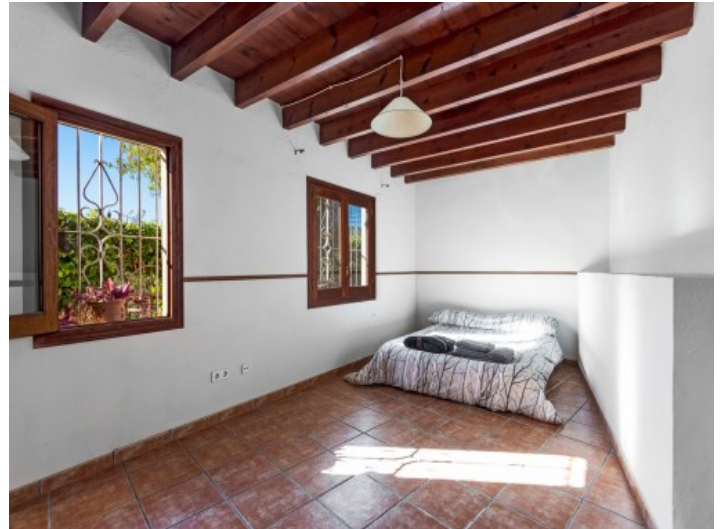
Typical roof beams