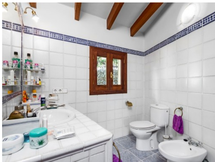
Mediterranean master bathroom

All information is correct to the best of our knowledge. Errors and prior sale excepted. This prospectus is purely for information purposes. Only the notarized deed of sale is legally binding.