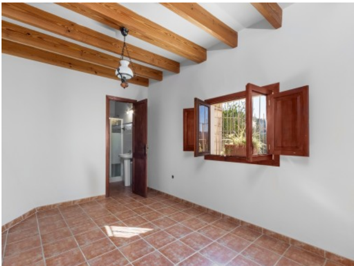
Access from the bedroom to the bathroom