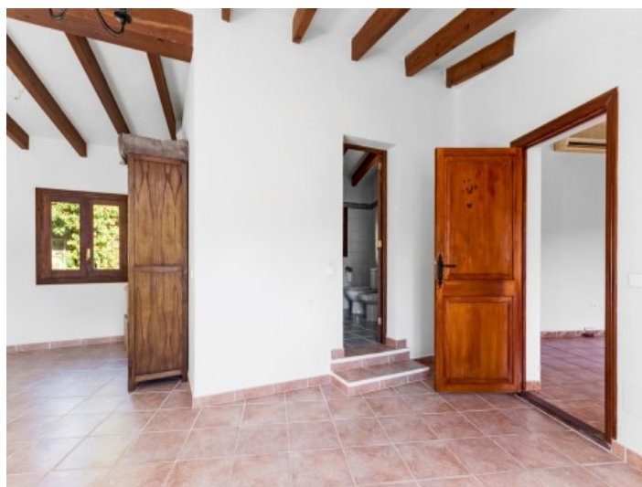
Main bedroom with bathroom en suite