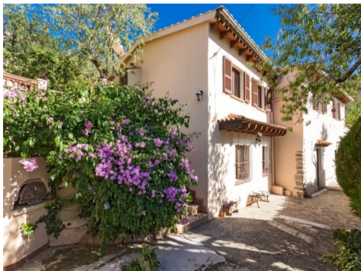
Exterior views of the main house