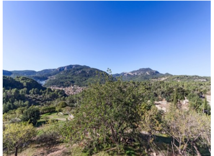
Wonderful views of the Tramuntana

All information is correct to the best of our knowledge. Errors and prior sale excepted. This prospectus is purely for information purposes. Only the notarized deed of sale is legally binding.