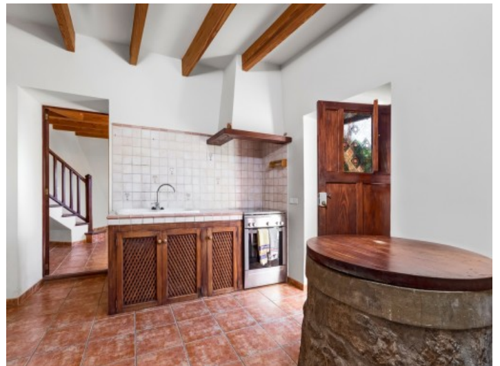
Rustic kitchen in the guest house