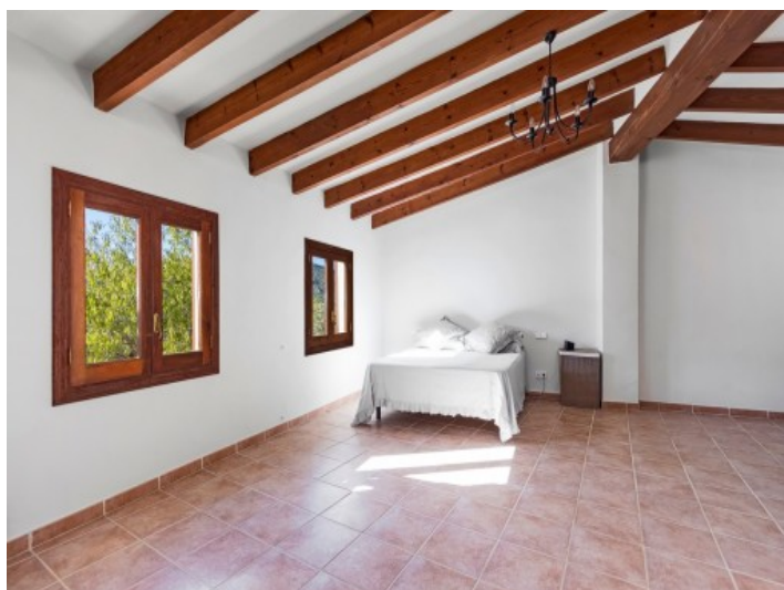
Extensive master bedroom