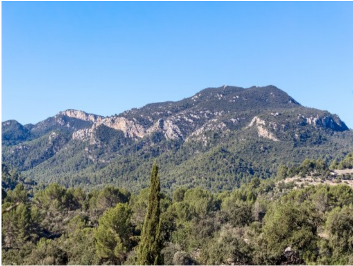
Breath-taking mountain views