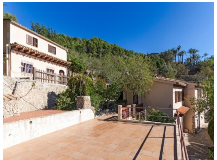
Views of the terrace, the guest and the main house

All information is correct to the best of our knowledge. Errors and prior sale excepted. This prospectus is purely for information purposes. Only the notarized deed of sale is legally binding.