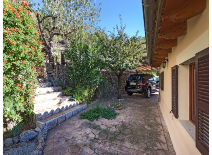
Parking and entrance area