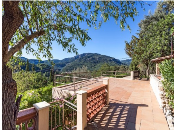
Sunny terrace with great landscape views