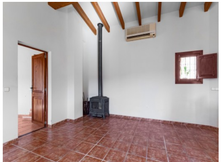
Fireplace in the guest house

All information is correct to the best of our knowledge. Errors and prior sale excepted. This prospectus is purely for information purposes. Only the notarized deed of sale is legally binding.