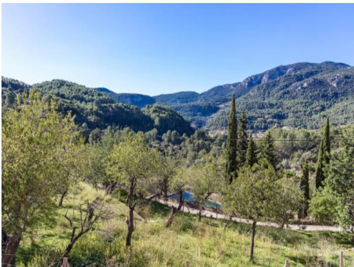
The finca is surrounded by nature