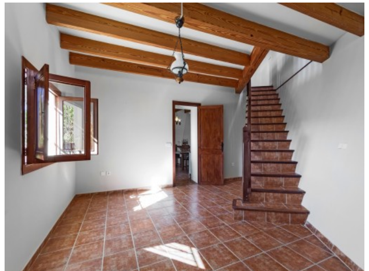
The guest house has 2 storeys