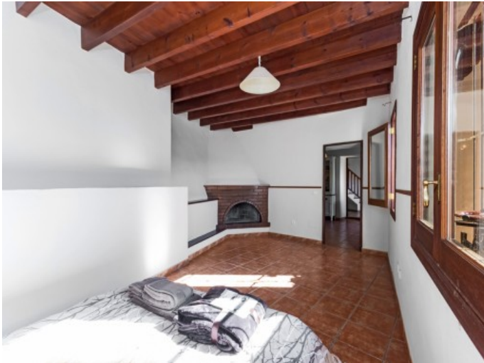
Guest bedroom with fireplace