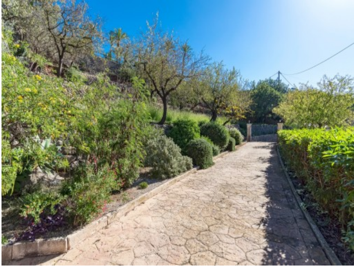
Driveway to the finca