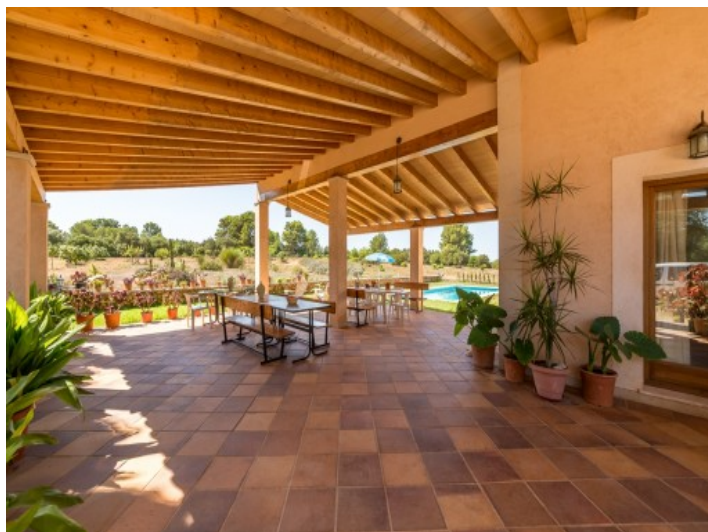
Covered terrace with dining area