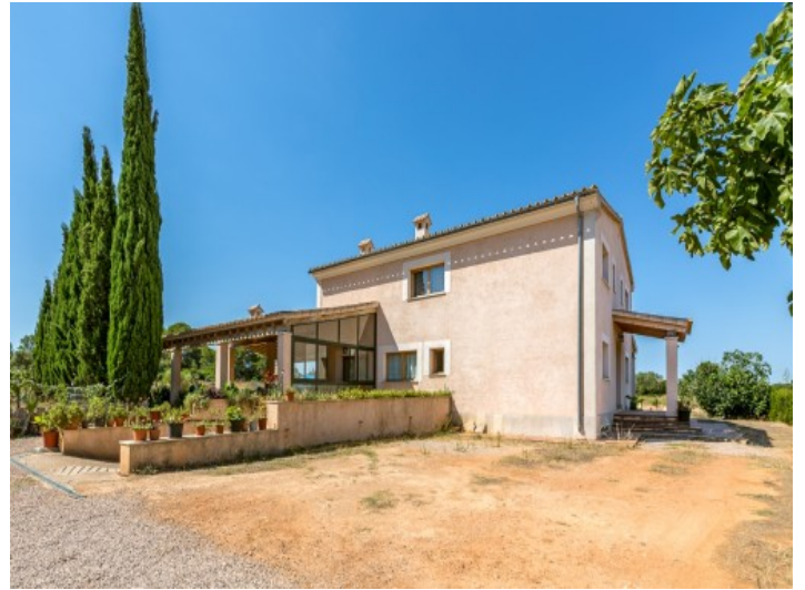
Views to the backside from the finca