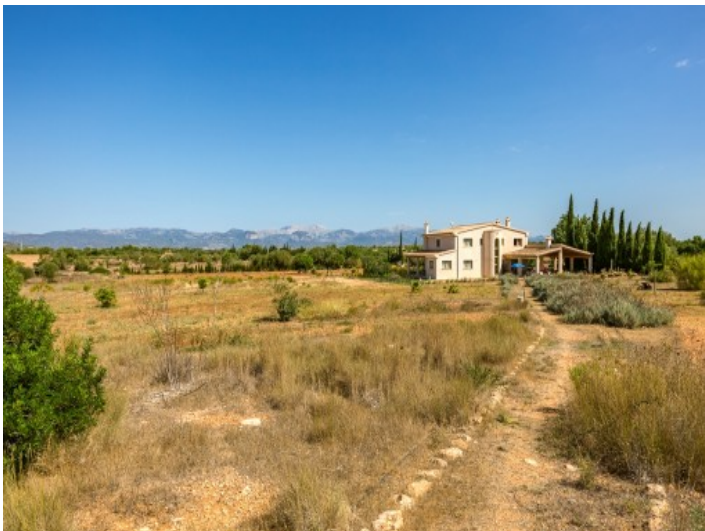
Views over the plot in Algaida