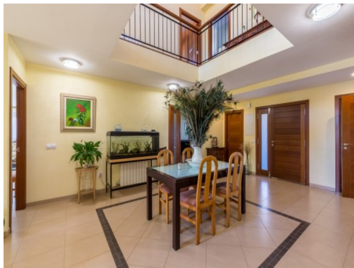
Dining area with gallery