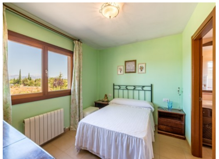
Bedroom with heating

All information is correct to the best of our knowledge. Errors and prior sale excepted. This prospectus is purely for information purposes. Only the notarized deed of sale is legally binding.