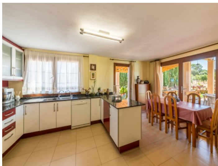
Fully equipped kitchen with dining area