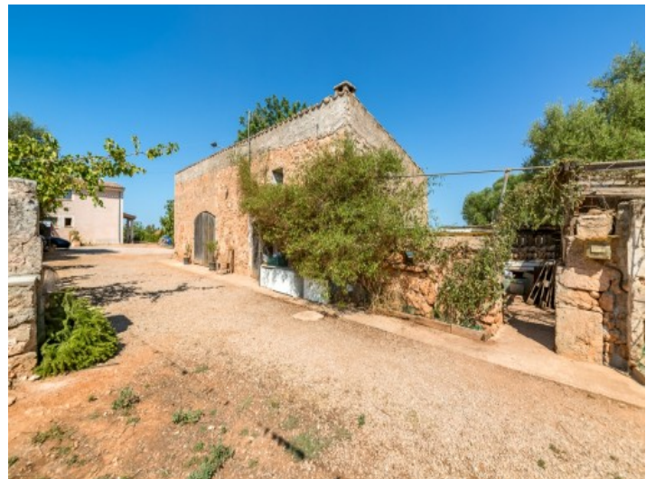
Spacious plot with finca