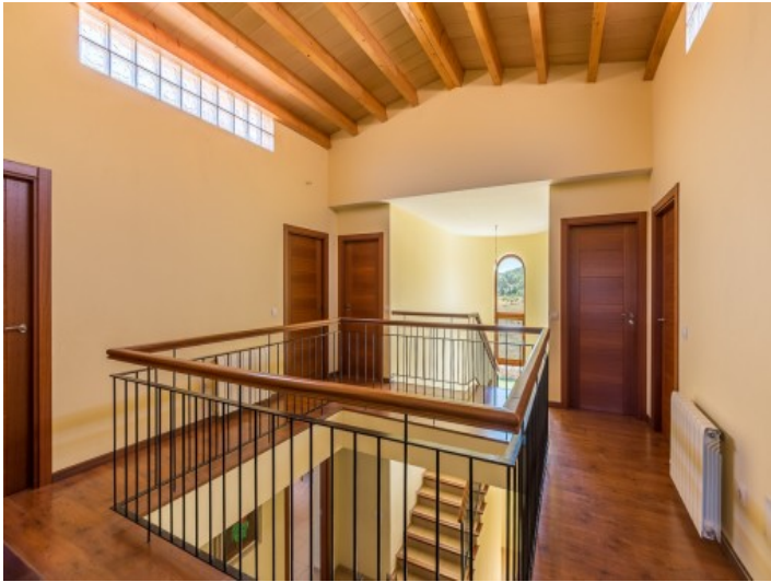
Gallery on the upper floor