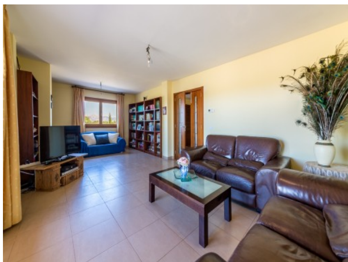
Cosy living area