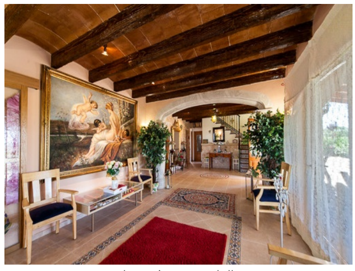
Impressive entrance hall