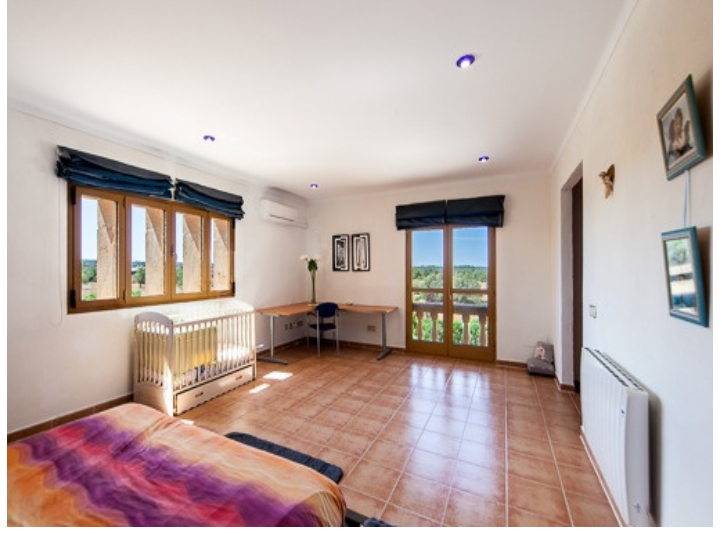
Bedroom with heating