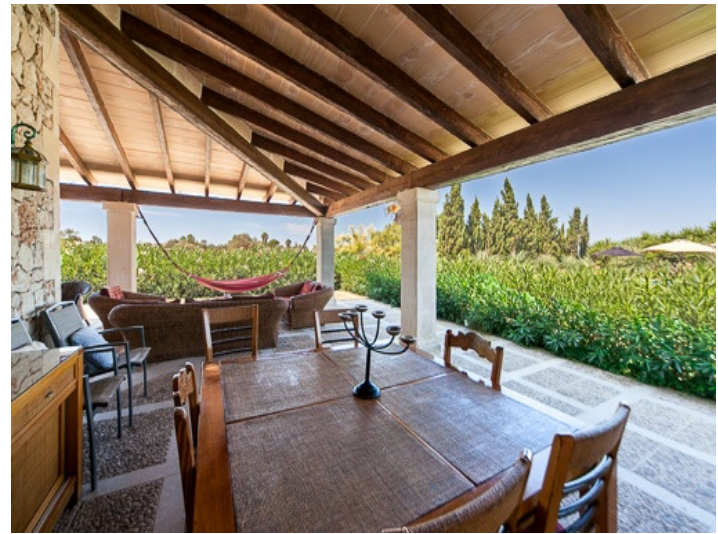
Covered terrace with garden views