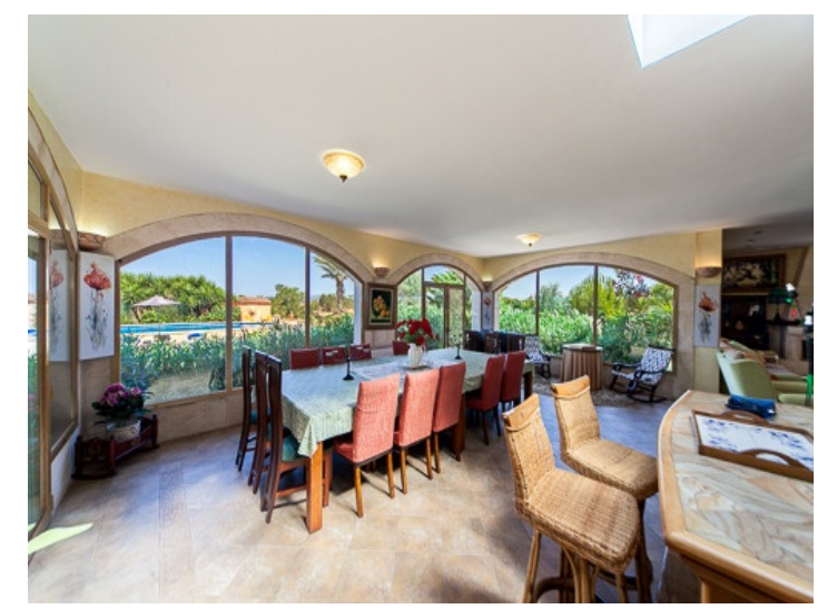
Light flooded dining area Bedroom with direct terrace acces All information is correct to the best of our knowledge. Errors and prior sale excepted. This prospectus is purely for information purposes. Only the notarized deed of sale is legally binding.

PORTA MALLORQUINA • THERESIENSTR.: 81, 80333 MUNICH TEL. +34 971 698 242 • INFO@PORTAMALLORQUINA.COM