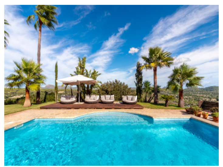
Amazing pool area