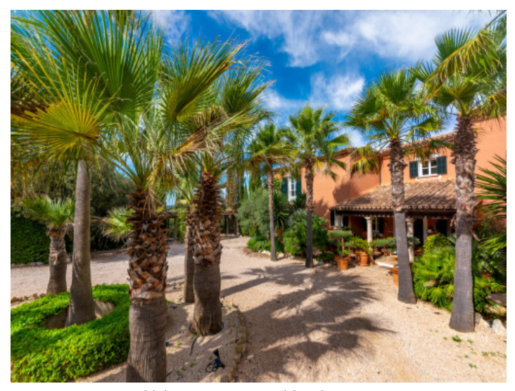
Main entrance area with palm trees