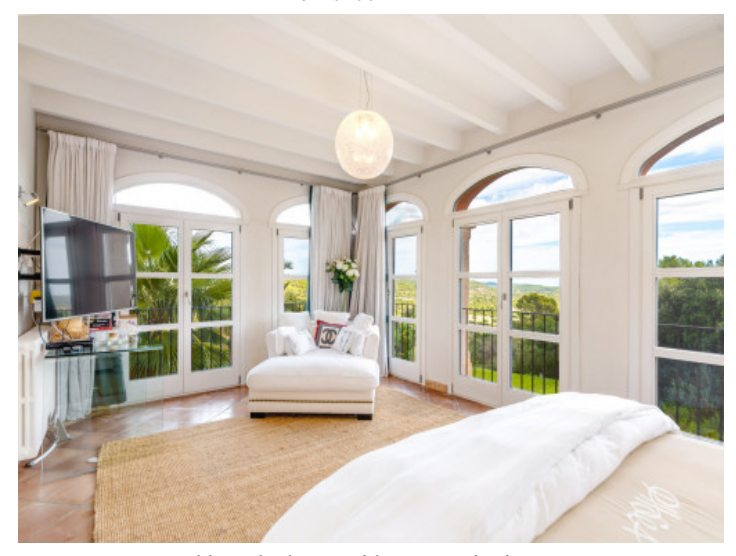
Masterbedroom with panoramic views