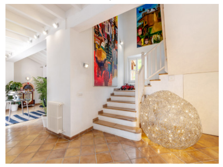
Stairs to the upper floor