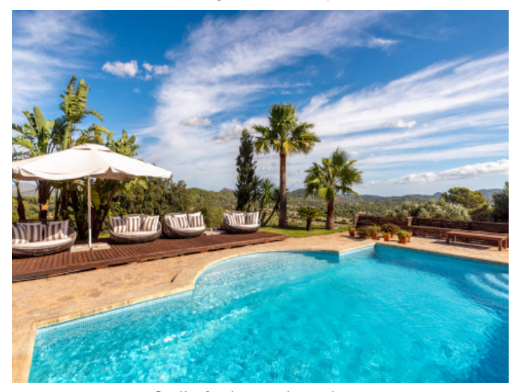
Quality furniture at the pool area