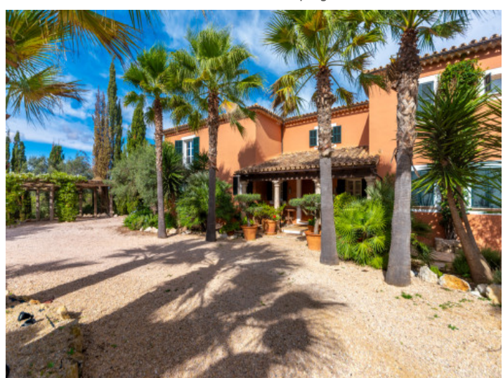
Exterior view and main entrance