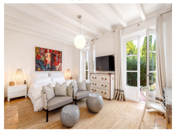
Bedroom on the ground floor