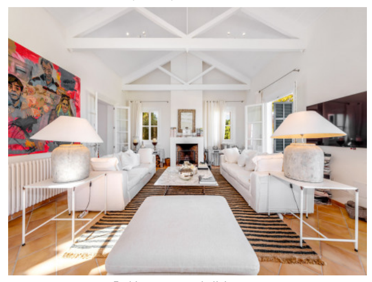
Fashion countrystyle living area