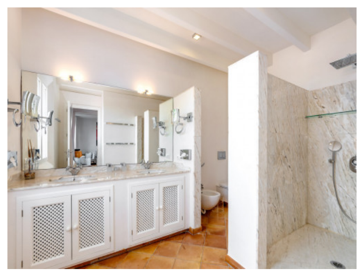
Large en suite bathroom