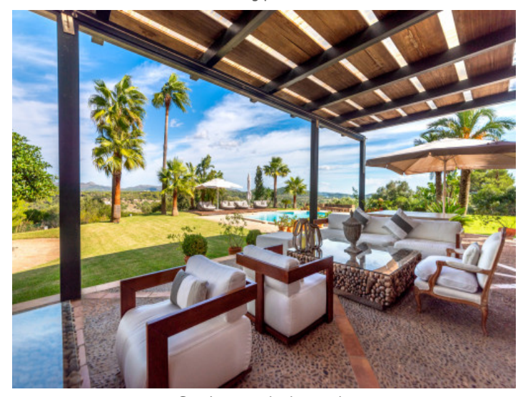
Spacious porched veranda