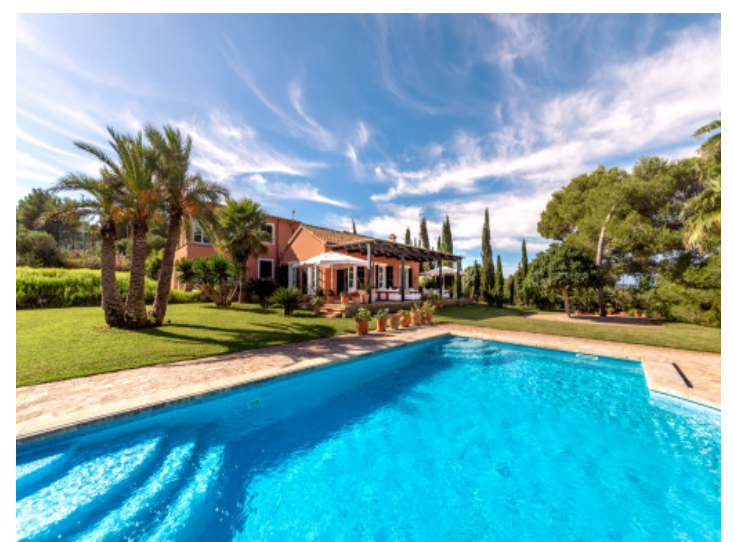
The outdoor area is a dream