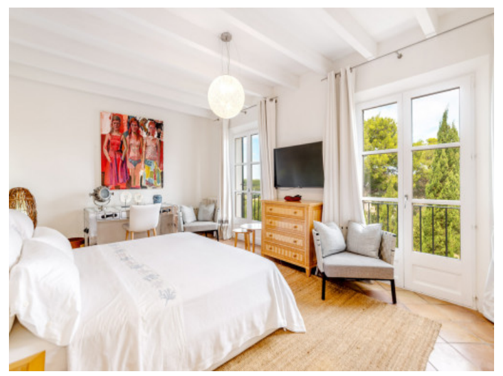
Cozy stylisch bedroom