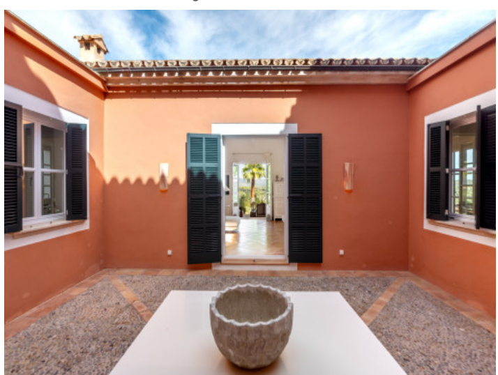
Charming mediterranean patio