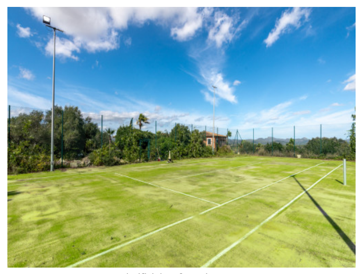
Artificial turf tennis court