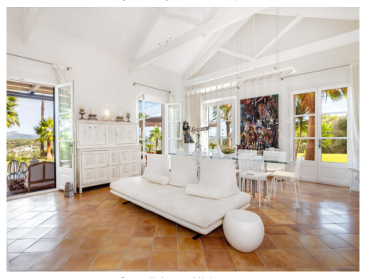
Open dining and living area