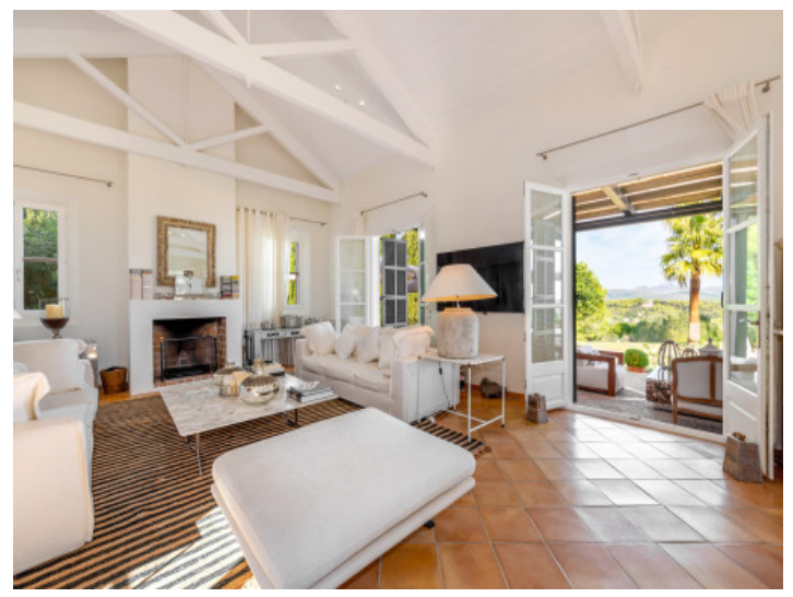
Elegant living area with fireplace