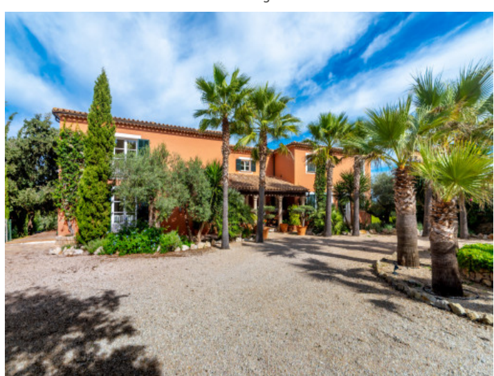
Exterior view of these amazing property