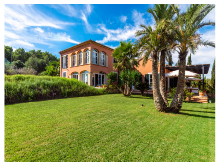
Perfect mantained mediterranean garden