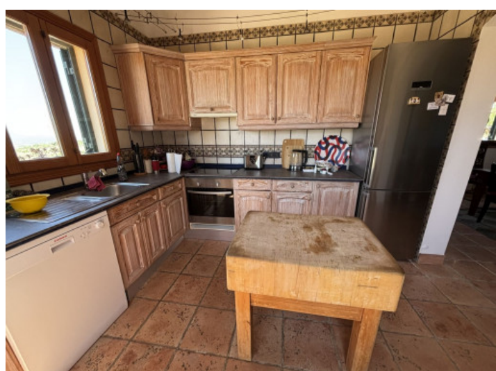
Fully equipped kitchen Living area with fireplace All information is correct to the best of our knowledge. Errors and prior sale excepted. This prospectus is purely for information purposes. Only the notarized deed of sale is legally binding.