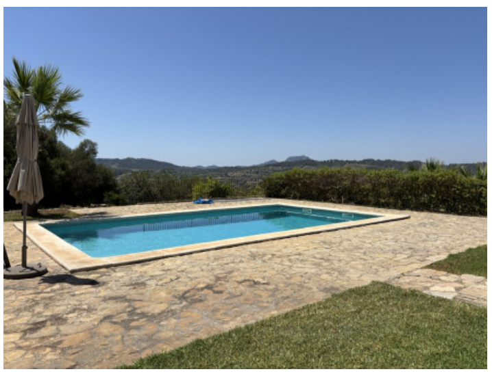
Pool area with sun terraces and wide views