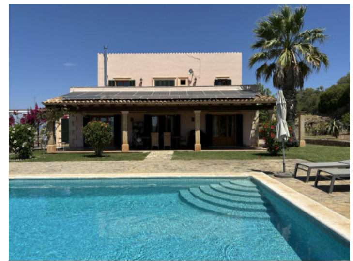
Finca with large pool, 2m deep