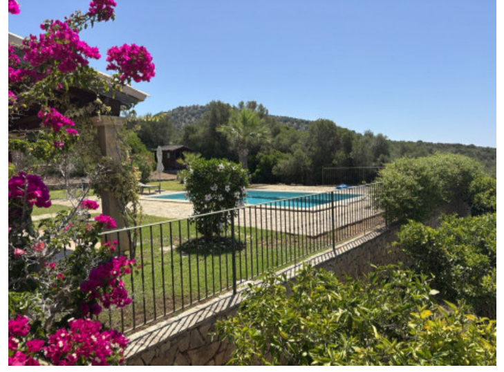
Beautiful garden, pool and panoramic view

PORTA MALLORQUINA® Your home. Our passion.