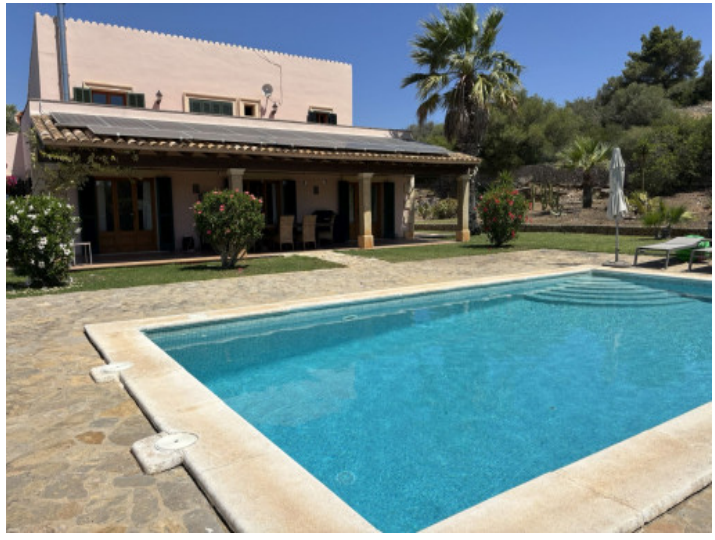
View of the finca in Son Macià