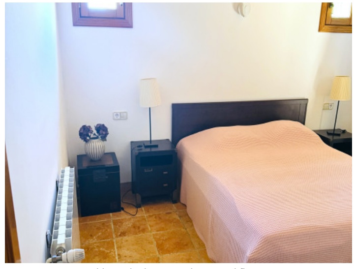
Master bedroom on the ground floor