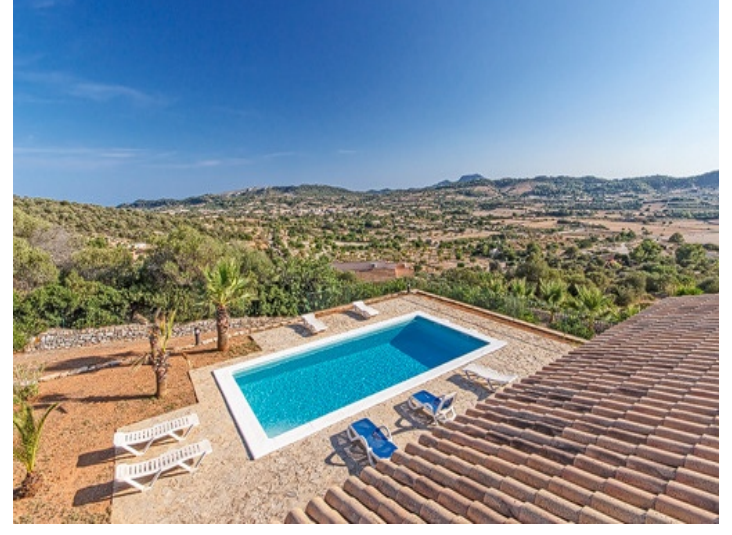
Pool area with sun terraces and wide views

PORTA MALLORQUINA® Your home. Our passion.