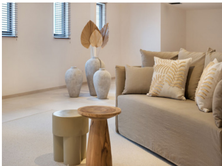
Room with heating