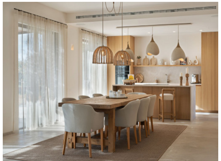
Dining area with kitchen

All information is correct to the best of our knowledge. Errors and prior sale excepted. This prospectus is purely for information purposes. Only the notarized deed of sale is legally binding.