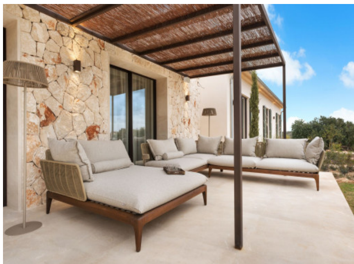
Terrace with space to enjoy nature