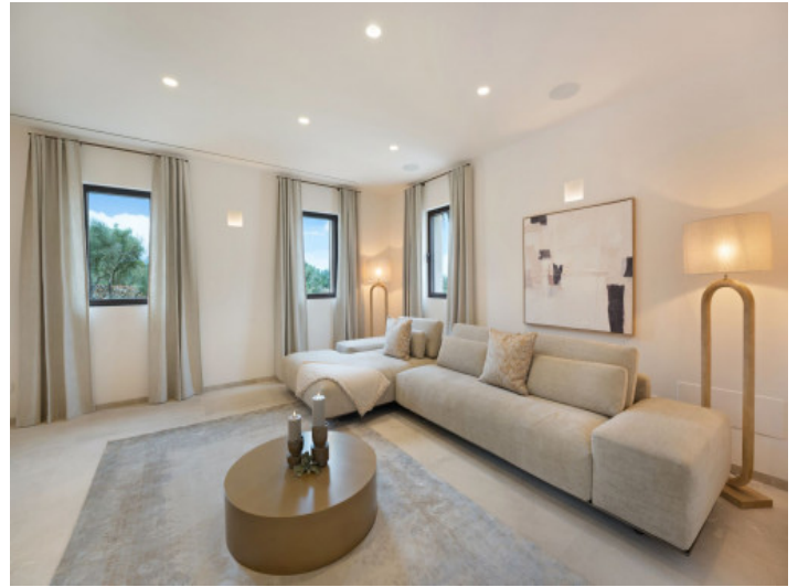
Living room with natural light cioso salón con carácter mediterráneo