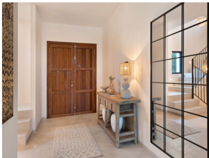
Entrance to the house

All information is correct to the best of our knowledge. Errors and prior sale excepted. This prospectus is purely for information purposes. Only the notarized deed of sale is legally binding.