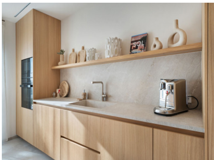
High quality kitchen