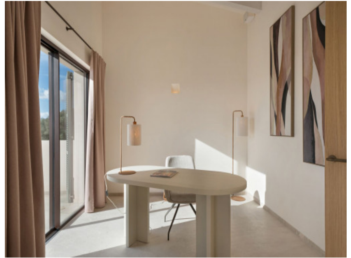
Desk in the Masterbedroom