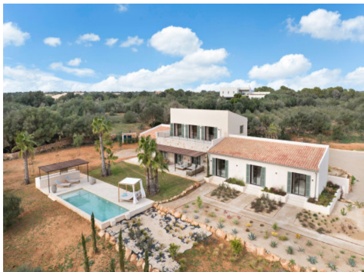
Panoramic aerial view of the estate