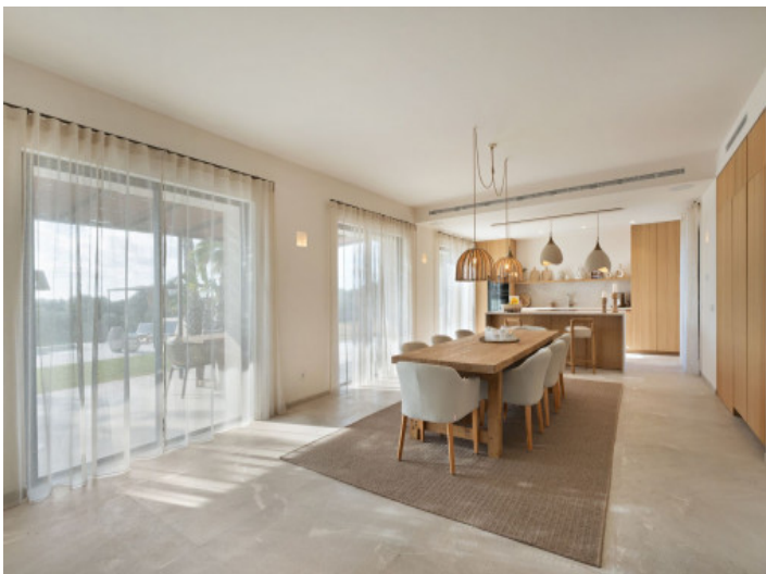
Dining area with kitchen