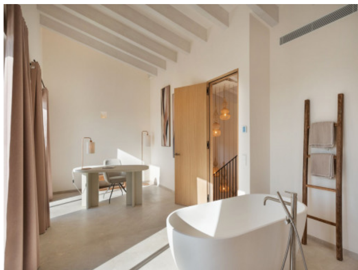
Masterbedroom with bathtub

All information is correct to the best of our knowledge. Errors and prior sale excepted. This prospectus is purely for information purposes. Only the notarized deed of sale is legally binding.