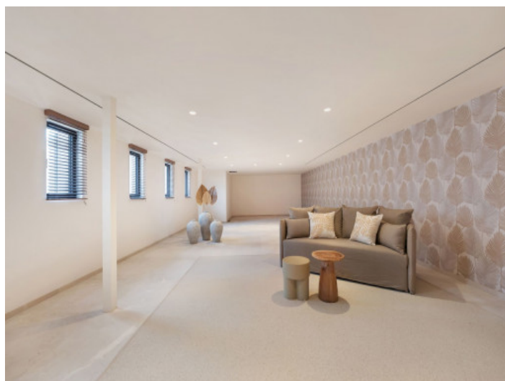
Area for Gym or sauna in the lower level