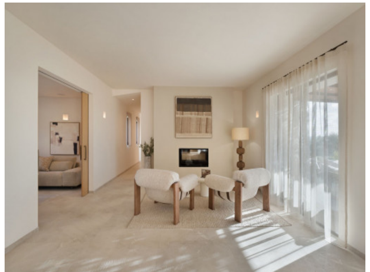
Seating area with fireplace