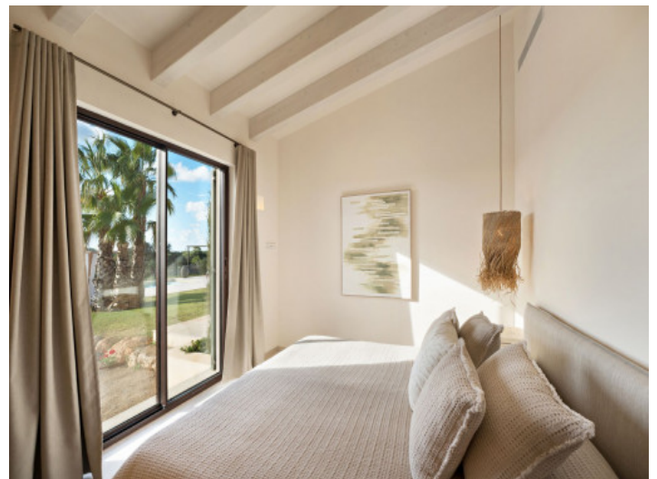
Bedroom with access to poolarea

All information is correct to the best of our knowledge. Errors and prior sale excepted. This prospectus is purely for information purposes. Only the notarized deed of sale is legally binding.