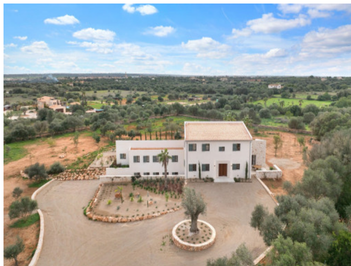
Impressive entrance with Mediterranean charm