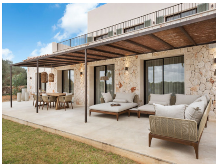
Terrace with porch