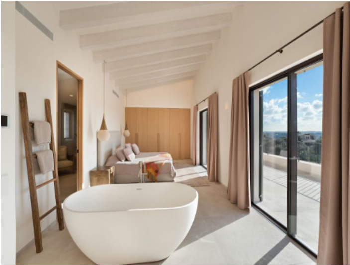
Views from Masterbedroom)