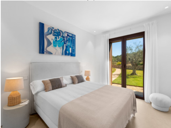
One of the 4 bedrooms with en suite bathroom and direct garden access