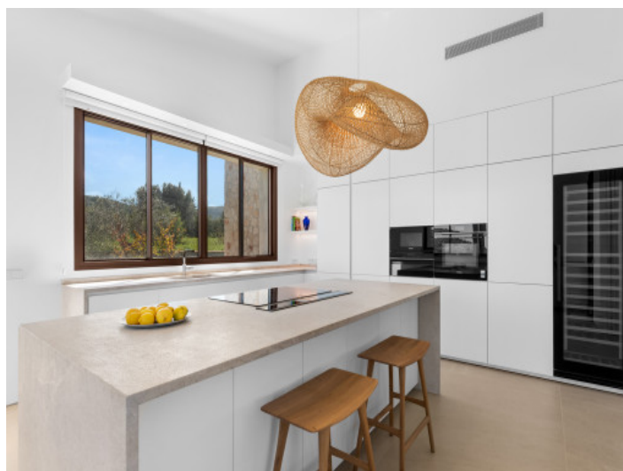
Designer kitchen with premium materials and modern equipment