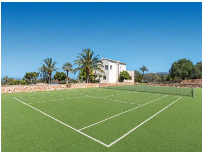
Finca with tennis court and sea views between Manacor and Colònia de

San Pedro All information is correct to the best of our knowledge. Errors and prior sale excepted. This prospectus is purely for information purposes. Only the notarized deed of sale is legally binding.