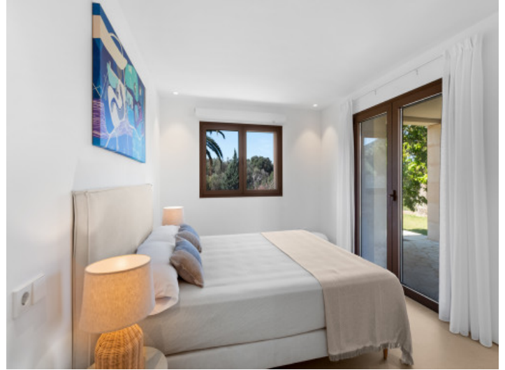
One of the 4 bedrooms with en suite bathroom and direct garden access