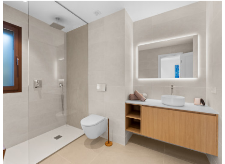
Modern en suite bathroom