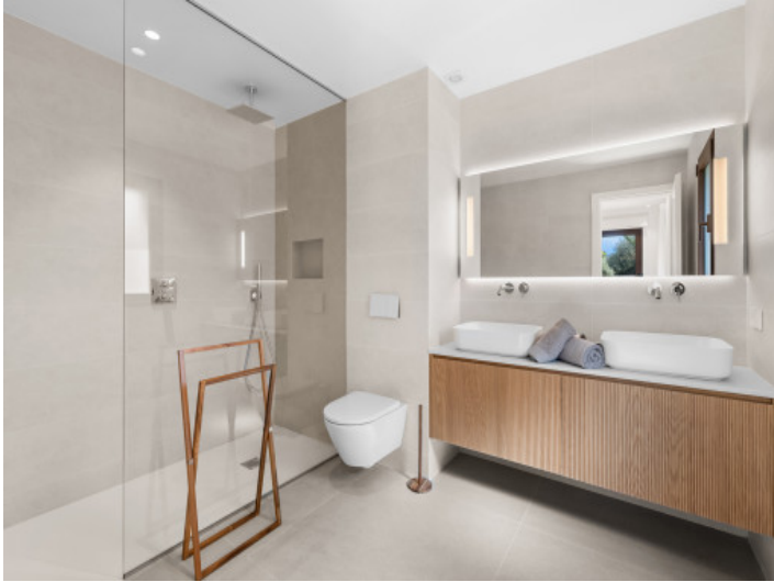
Modern en suite bathroom