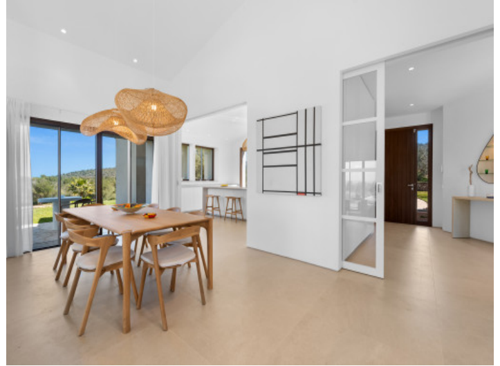
Dining area with direct access to the terrace