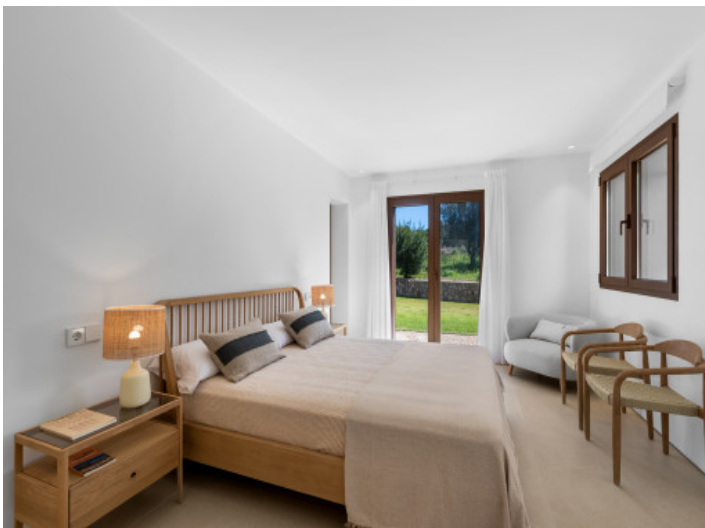
One of the 4 bedrooms with en suite bathroom and direct garden access