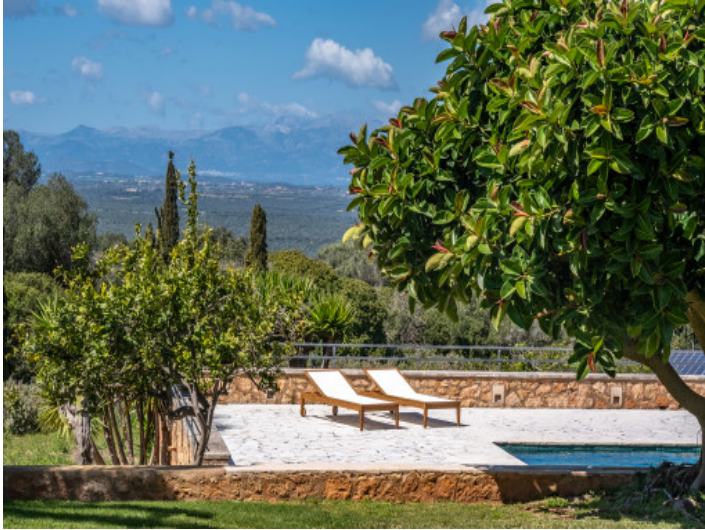
Pool and sun terrace