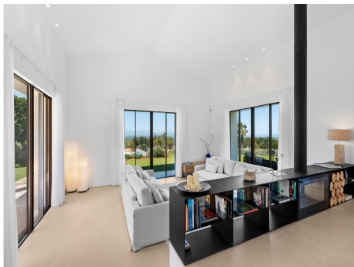
Open-plan living area with abundant natural light and views of the greenery extending to the sea

All information is correct to the best of our knowledge. Errors and prior sale excepted. This prospectus is purely for information purposes. Only the final deed of sale is legally binding.