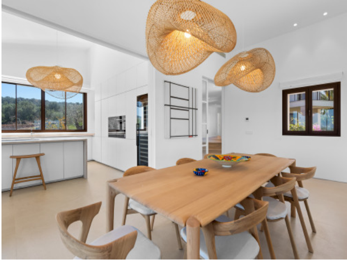
High-end, separable kitchen – ideal for maximum discretion and everyday