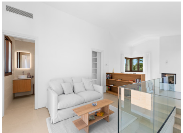
...en suite bathroom

All information is correct to the best of our knowledge. Errors and prior sale excepted. This prospectus is purely for information purposes. Only the notarized deed of sale is legally binding.