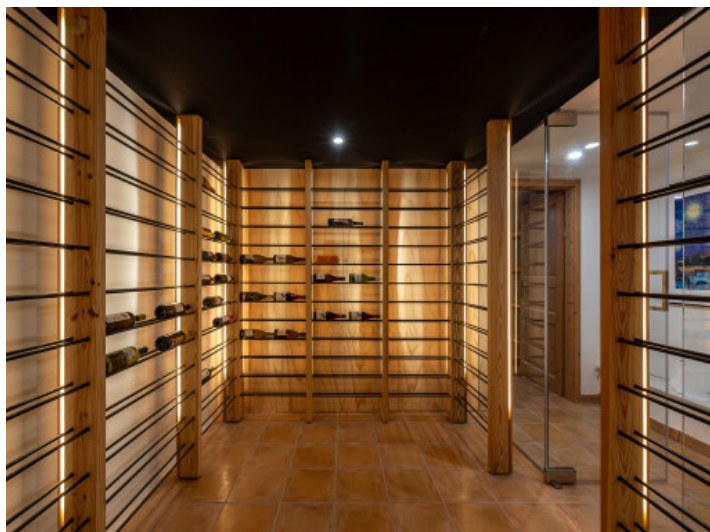
Designer wine cellar with controlled temperature and humidity