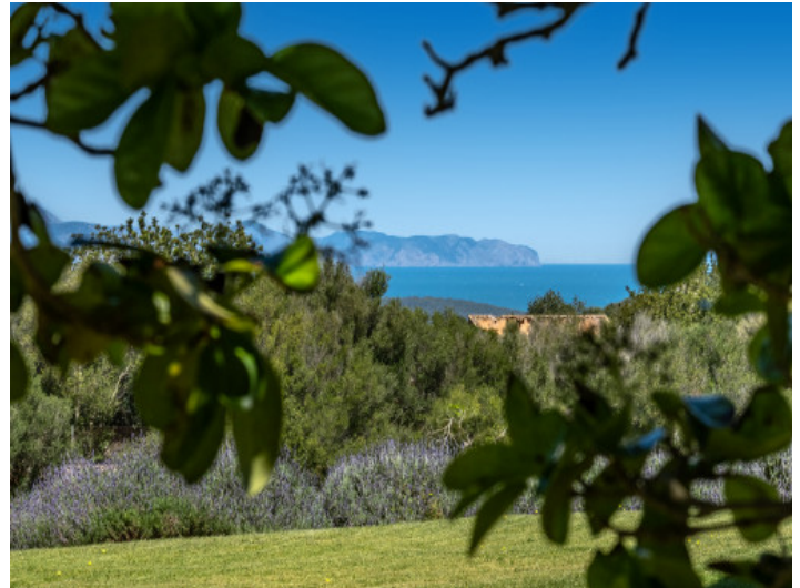
Nature and open views