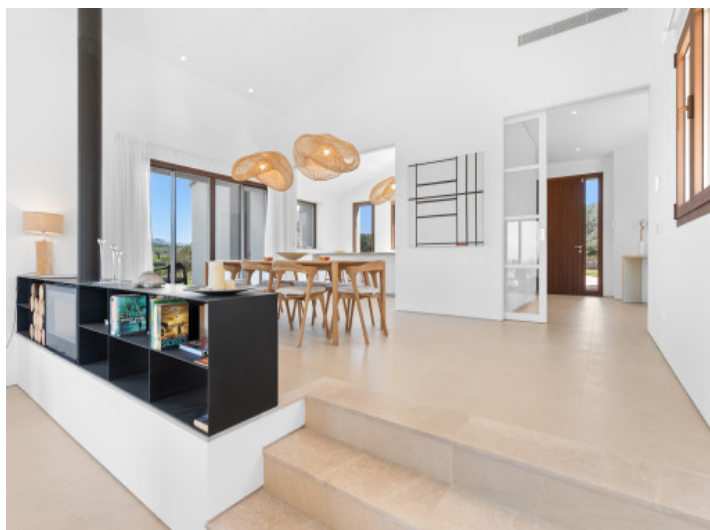
High-quality finishes and a calm and sophisticated atmosphere