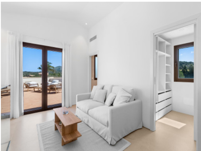
...with private living area and walk-in wardrobe