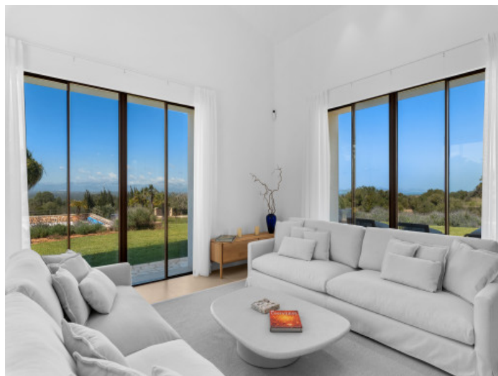
High-quality architecture harmoniously integrated into nature