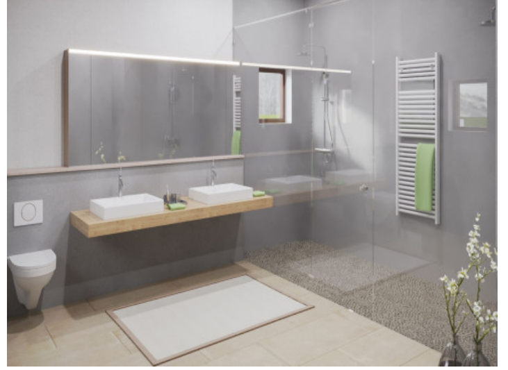
Finca with 7 bathrooms

PORTA MALLORQUINA® Your home. Our passion.