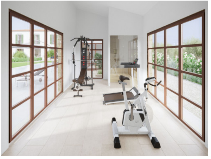
Gym and fitness