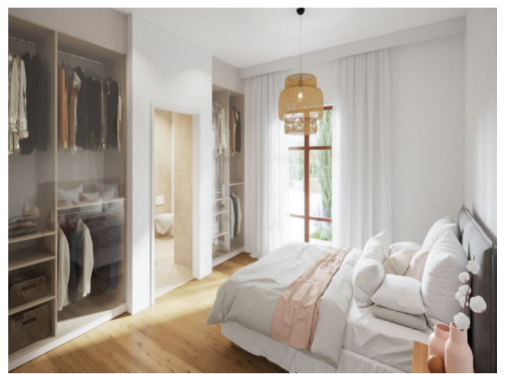
One of 6 bedrooms Another bedroom All information is correct to the best of our knowledge. Errors and prior sale excepted. This prospectus is purely for information purposes. Only the notarized deed of sale is legally binding.

PORTA MALLORQUINA • THERESIENSTR.: 81, 80333 MUNICH TEL. +34 971 698 242 • INFO@PORTAMALLORQUINA.COM