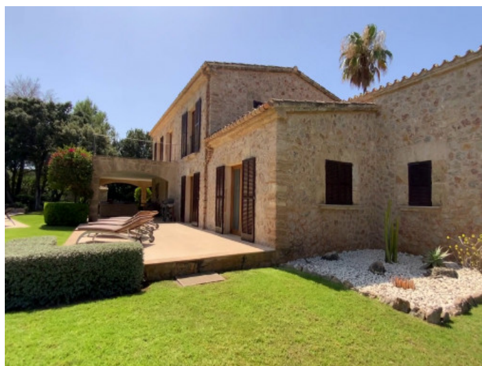
Lateral view to the finca and garden

All information is correct to the best of our knowledge. Errors and prior sale excepted. This prospectus is purely for information purposes. Only the notarized deed of sale is legally binding.