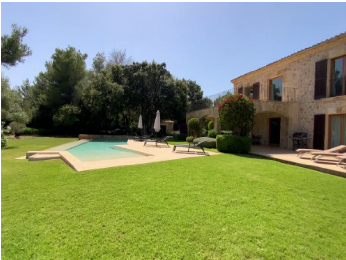
Large garden with pool