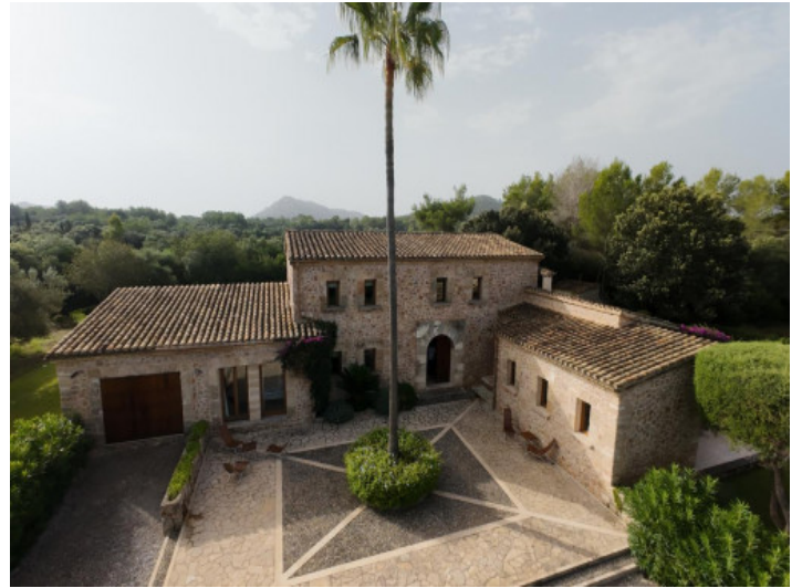
Natural stone façade°