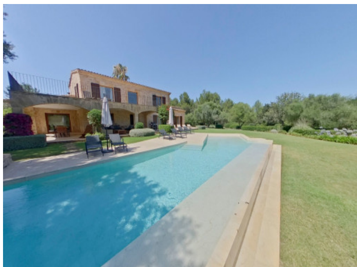
Beautiful pool and garden