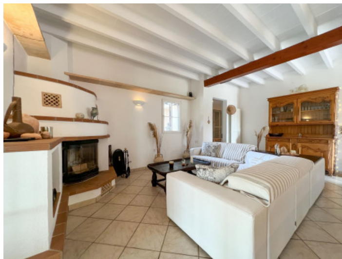
Comfortable living area with fireplace