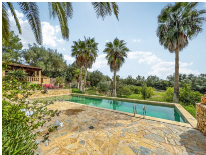
Tropical pool area