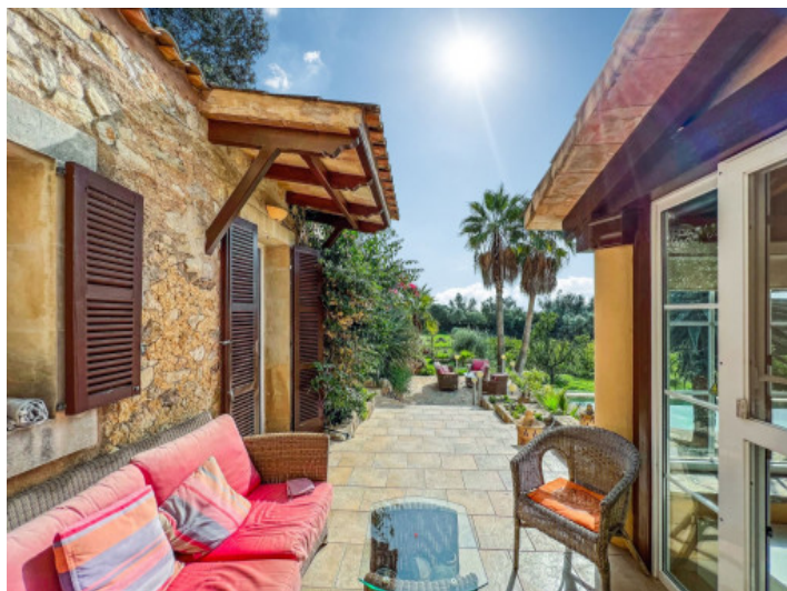
Sheltered seating area