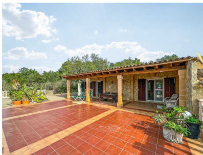
Large terrace of the guesthouse