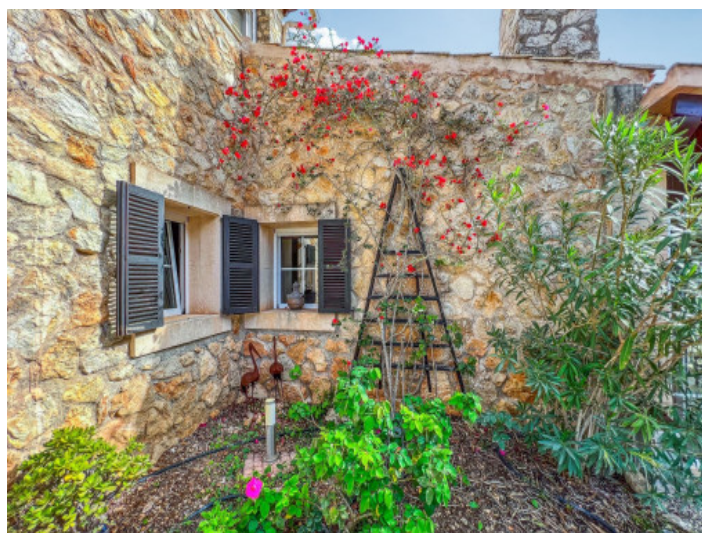
Natural stone walls