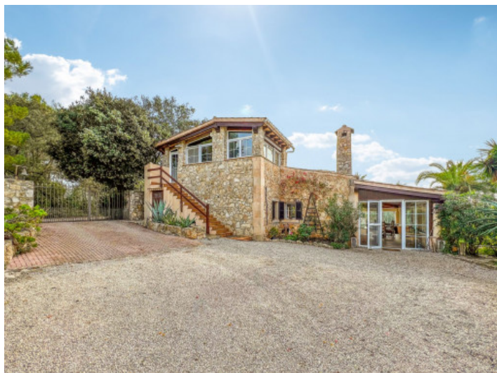
View to the facade of the main house