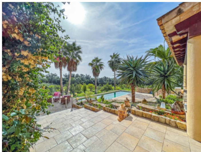
View from the wintergarden to the pool area