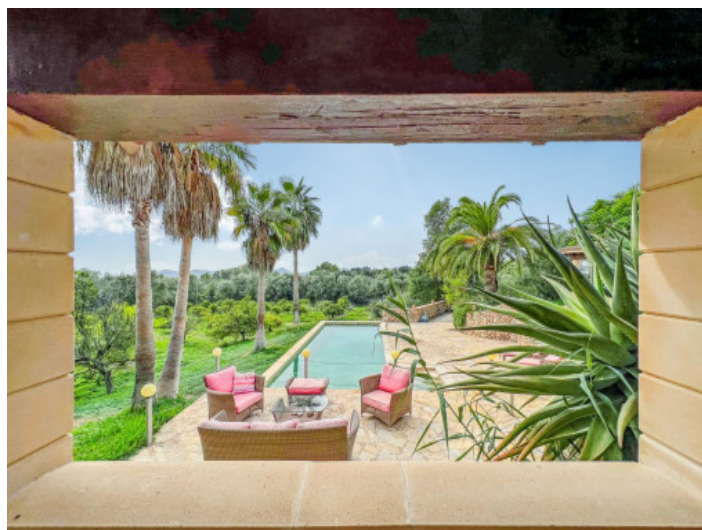
Nice pool area

All information is correct to the best of our knowledge. Errors and prior sale excepted. This prospectus is purely for information purposes. Only the notarized deed of sale is legally binding.