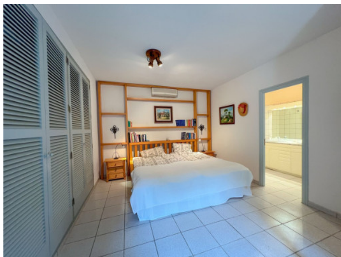
Second bedroom with bath en suite on the ground floor

All information is correct to the best of our knowledge. Errors and prior sale excepted. This prospectus is purely for information purposes. Only the notarized deed of sale is legally binding.