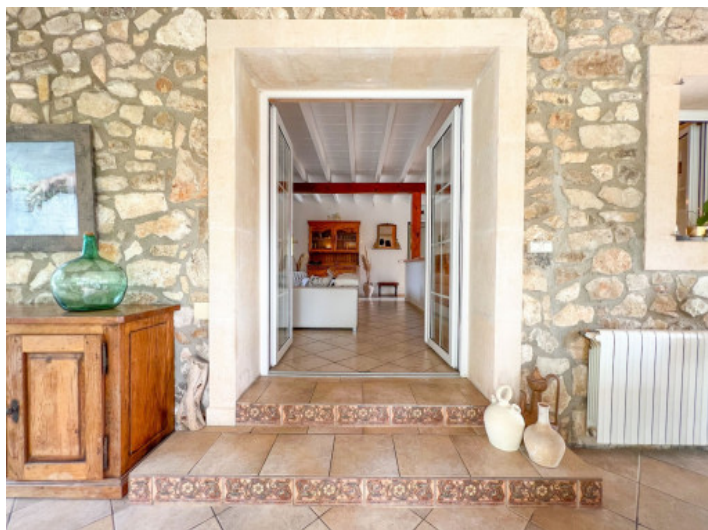
Entrance to the main house