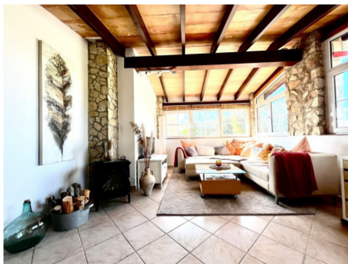
Living area studio