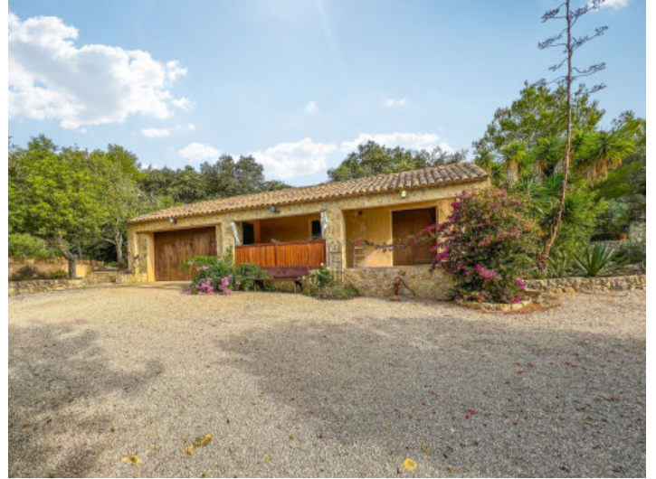
Garage and storage room

All information is correct to the best of our knowledge. Errors and prior sale excepted. This prospectus is purely for information purposes. Only the notarized deed of sale is legally binding.