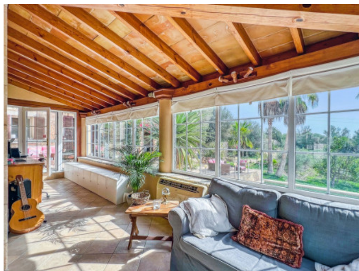
Winter garden with pool view

All information is correct to the best of our knowledge. Errors and prior sale excepted. This prospectus is purely for information purposes. Only the notarized deed of sale is legally binding.