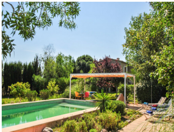
Idyllic pool area