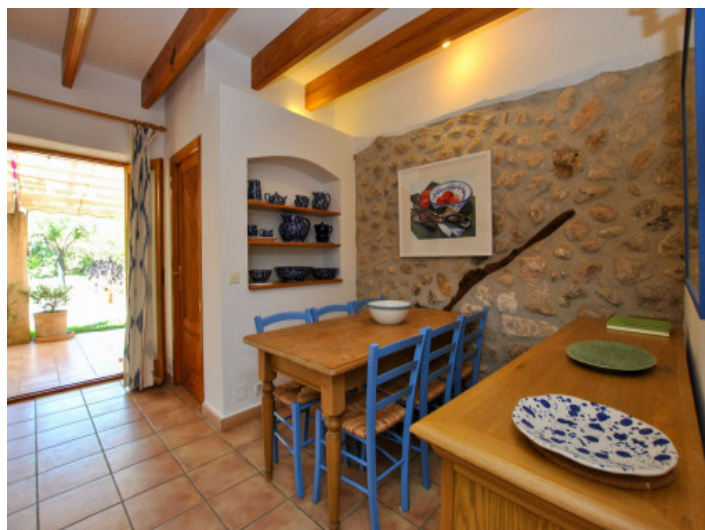
Rustic dining area

All information is correct to the best of our knowledge. Errors and prior sale excepted. This prospectus is purely for information purposes. Only the notarized deed of sale is legally binding.