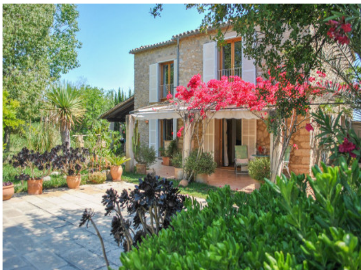
View of the finca