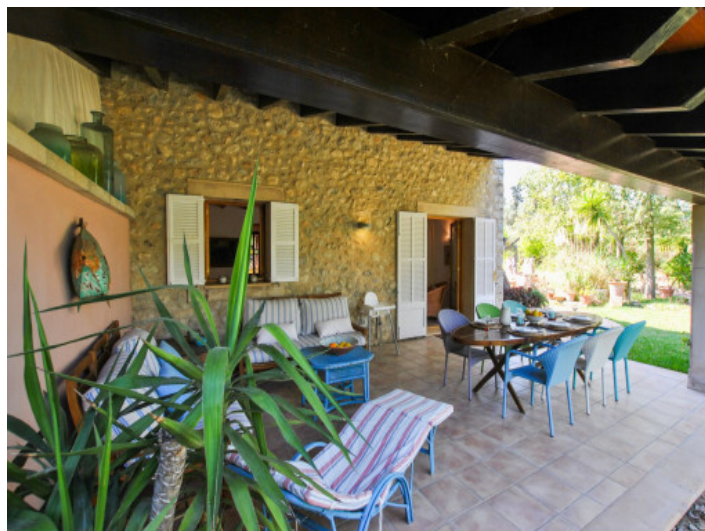
Large covered terrace