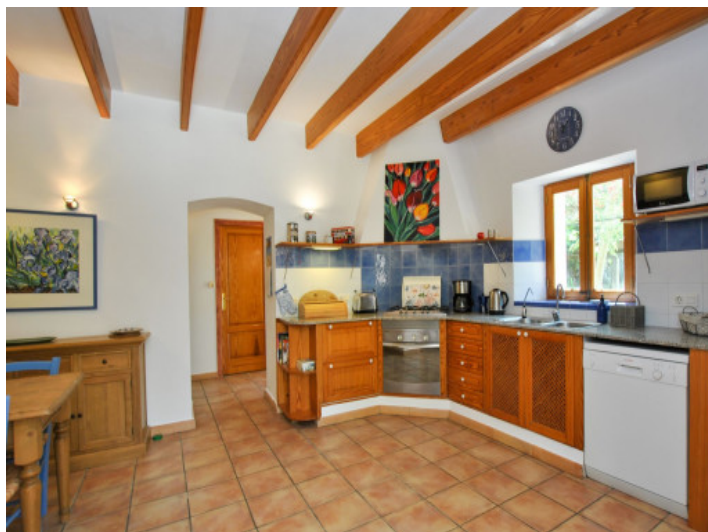
Lovely country house kitchen