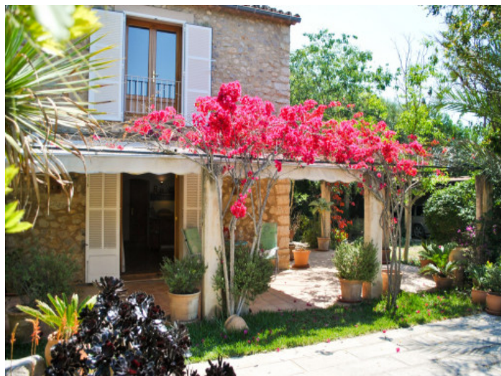
View of the finca

All information is correct to the best of our knowledge. Errors and prior sale excepted. This prospectus is purely for information purposes. Only the notarized deed of sale is legally binding.