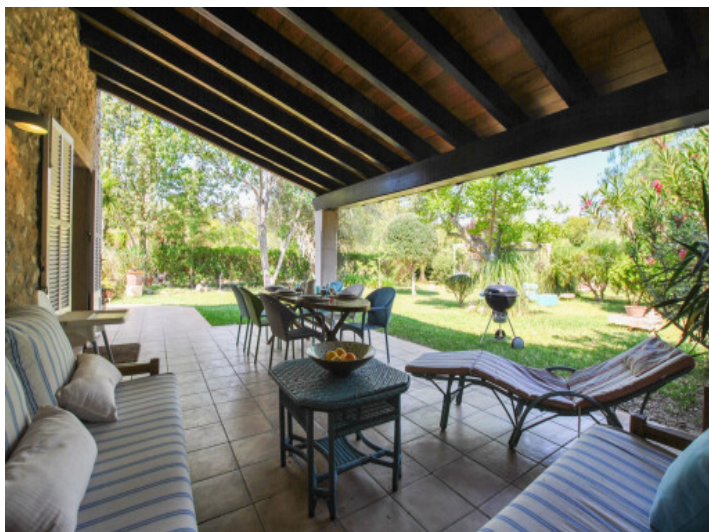
Large terrace with garden views