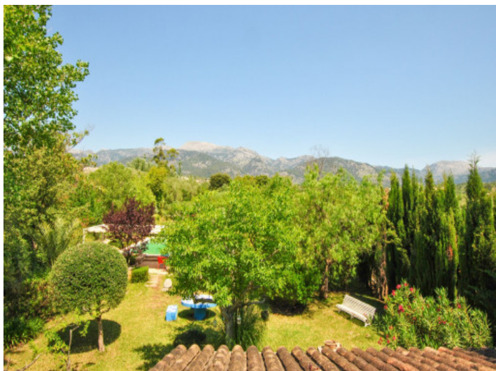
View over the garden