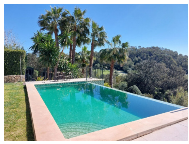
Pool with splendid views

All information is correct to the best of our knowledge. Errors and prior sale excepted. This prospectus is purely for information purposes. Only the notarized deed of sale is legally binding.