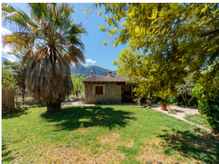
Beautiful mediterranean garden