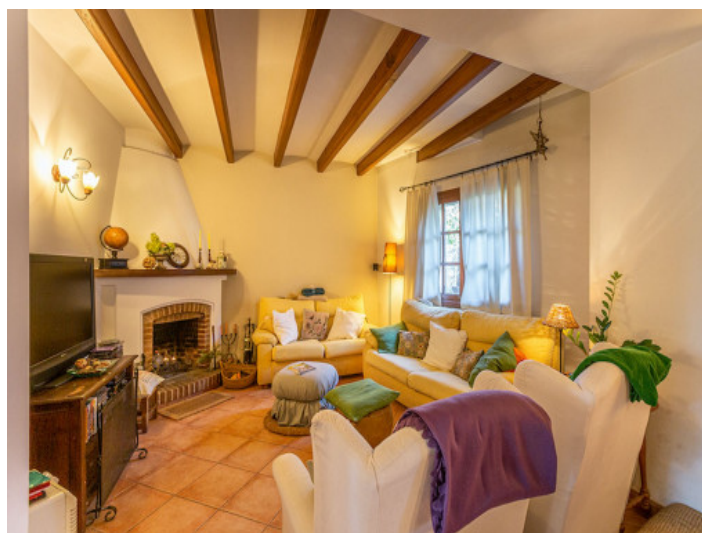
Cosy living area with fireplace