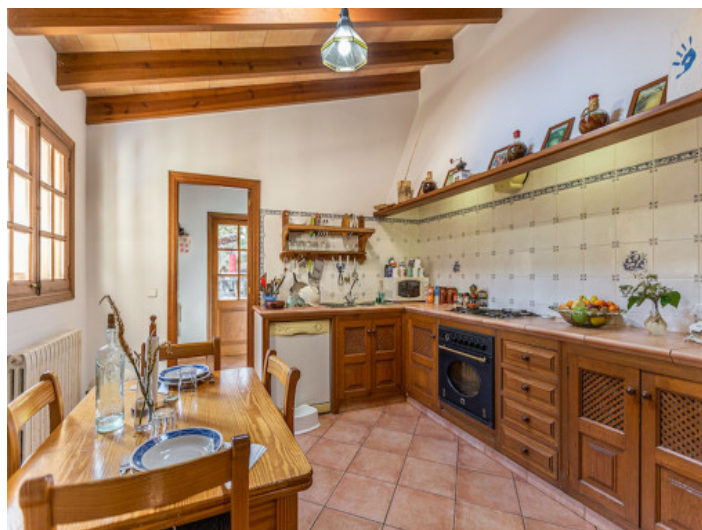
Lovely country house kitchen

All information is correct to the best of our knowledge. Errors and prior sale excepted. This prospectus is purely for information purposes. Only the notarized deed of sale is legally binding.