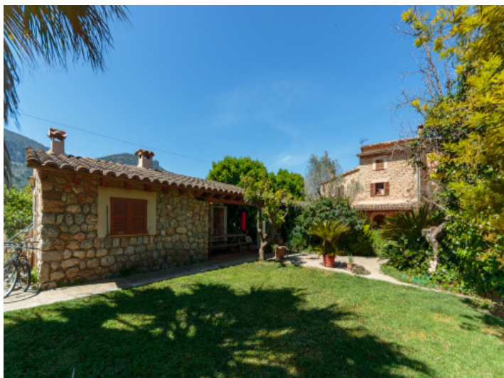
Wonderful country house with charme close to Soller