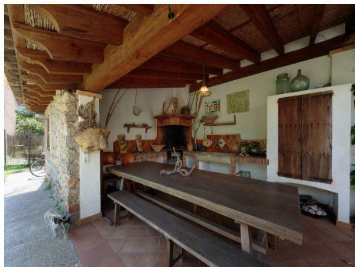
Fantastic outdoor bbq area