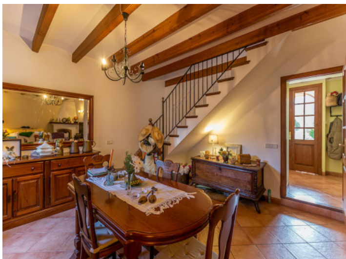
Dining area with wooden ceiling beams