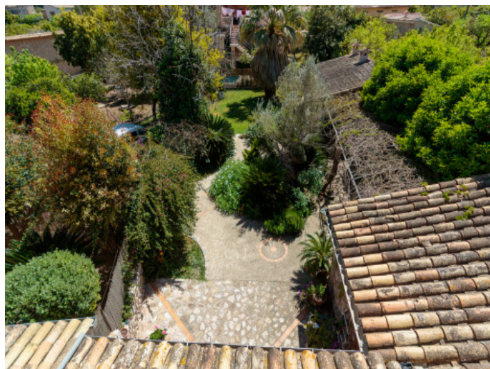
Terrace and garden