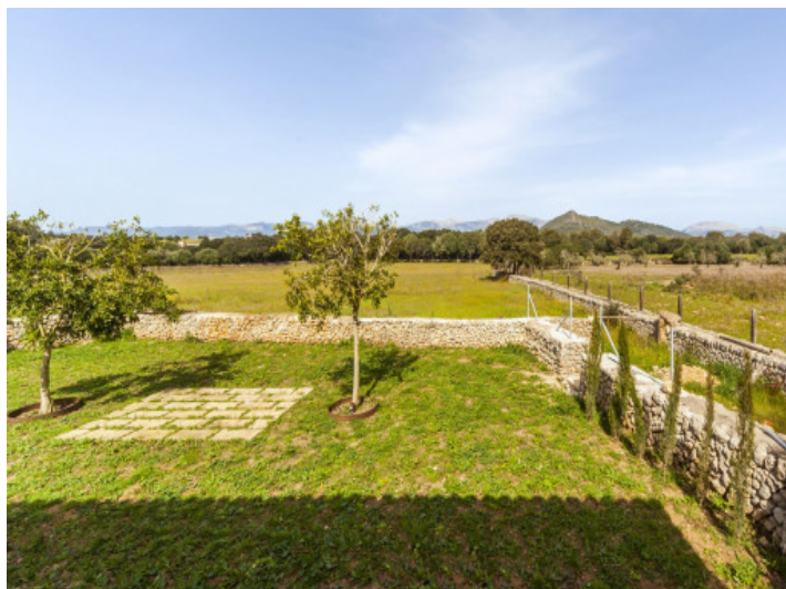
Sweeping views from the plot