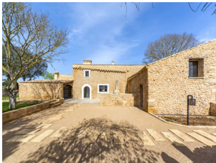
Front view and entrance to the finca