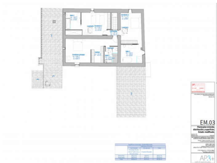
Plan first floor

All information is correct to the best of our knowledge. Errors and prior sale excepted. This prospectus is purely for information purposes. Only the notarized deed of sale is legally binding.