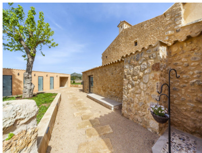
Exterior view and outdoor area