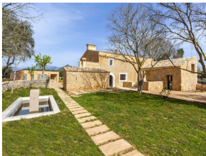
Property with extensive outdoor area