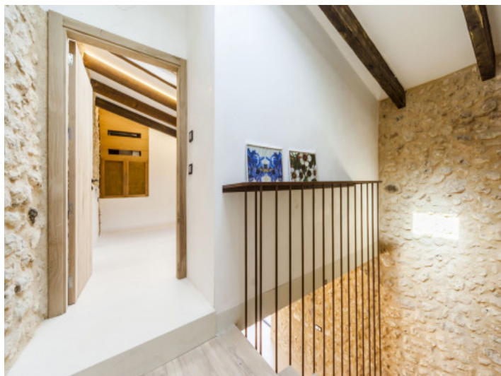
Corridor on the upper floor