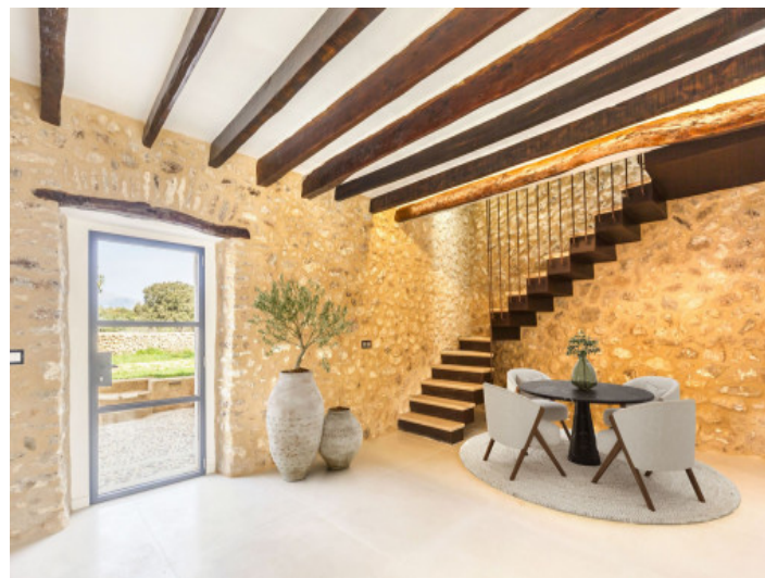
Room with natural stone wall and access from the outside