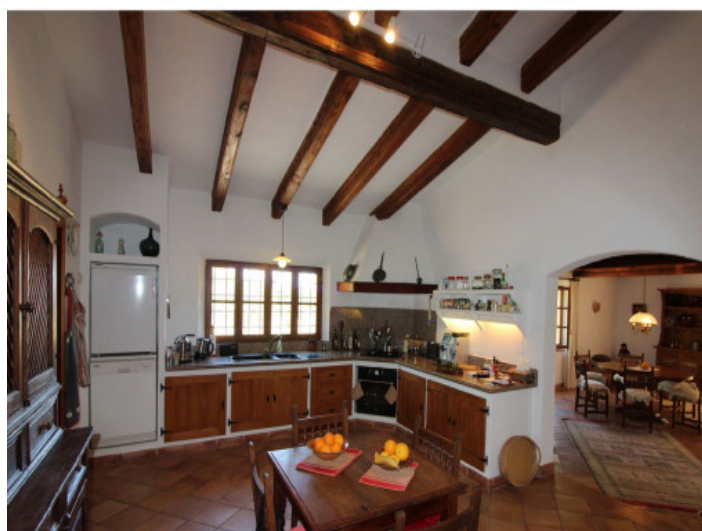
Cosy country house kitchen