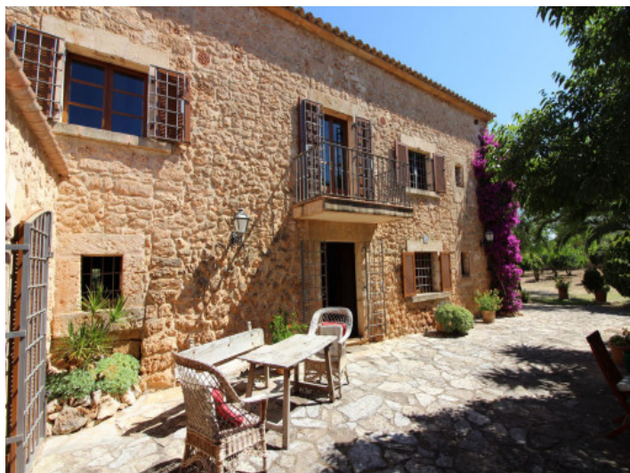
Front view and terrace