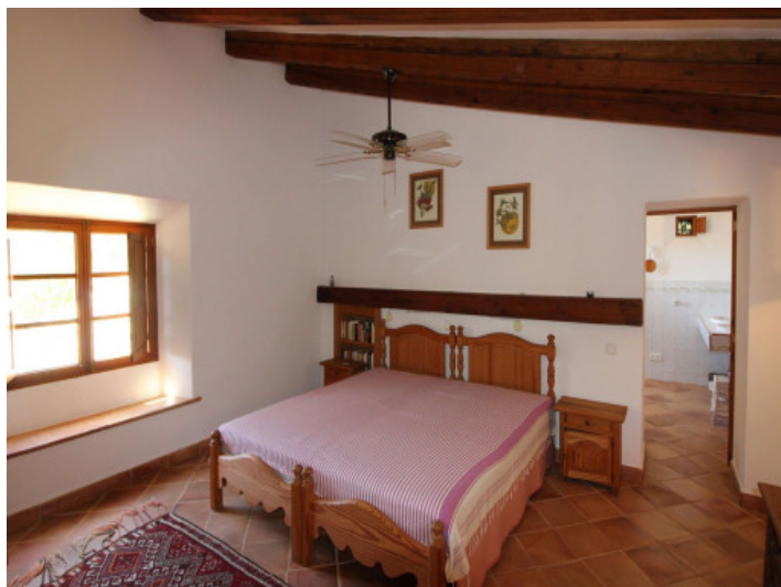
Bedroom with en suite bathroom

All information is correct to the best of our knowledge. Errors and prior sale excepted. This prospectus is purely for information purposes. Only the notarized deed of sale is legally binding.