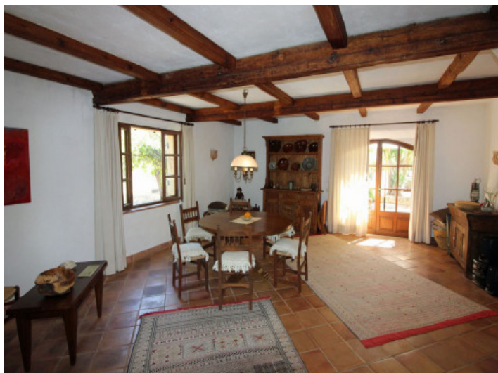
Large dining area