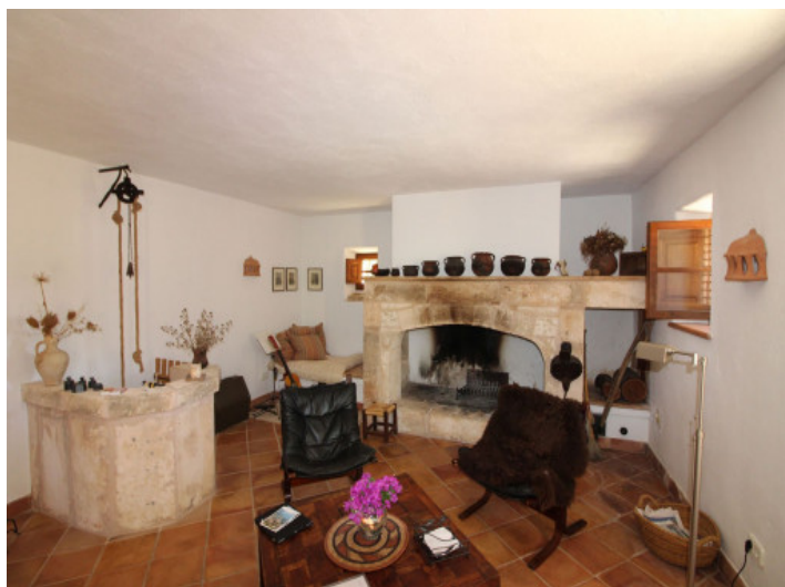
Rustic fireplace area