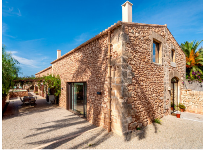
Natural stone façade

PORTA MALLORQUINA® Your home. Our passion.