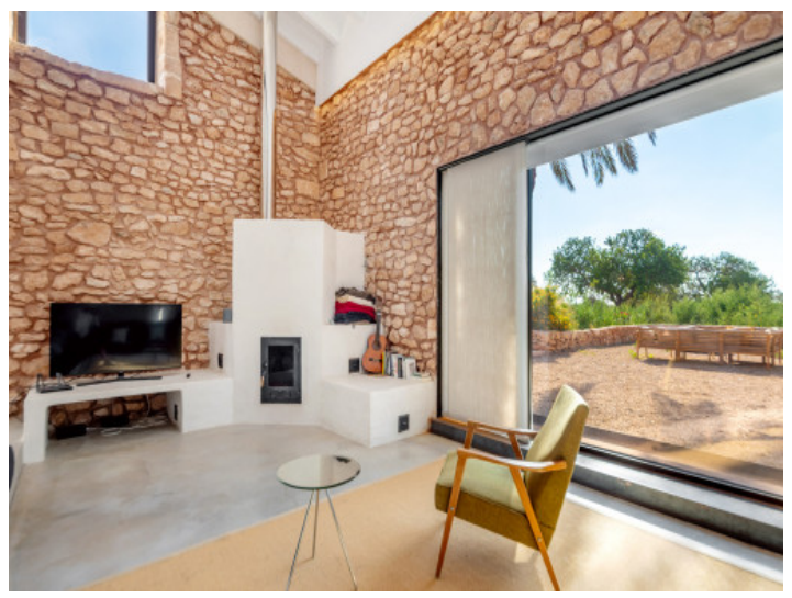
Bright living area Cozy fireplace All information is correct to the best of our knowledge. Errors and prior sale excepted. This prospectus is purely for information purposes. Only the notarized deed of sale is legally binding.