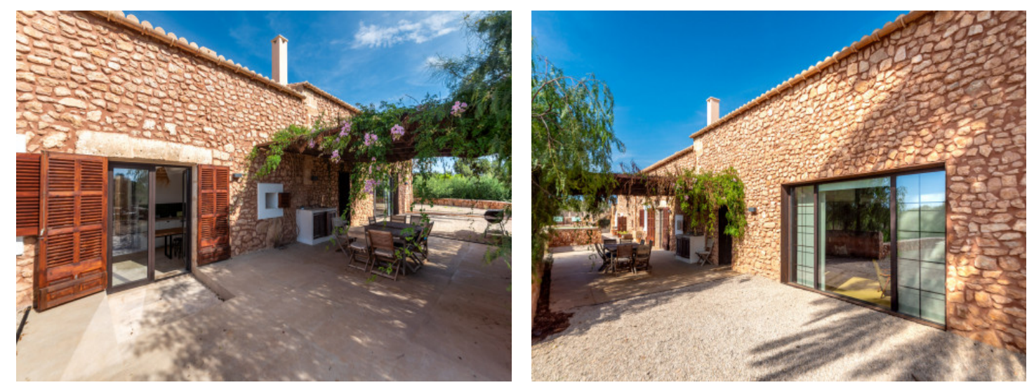
Terrace Tipical finca style All information is correct to the best of our knowledge. Errors and prior sale excepted. This prospectus is purely for information purposes. Only the notarized deed of sale is legally binding.