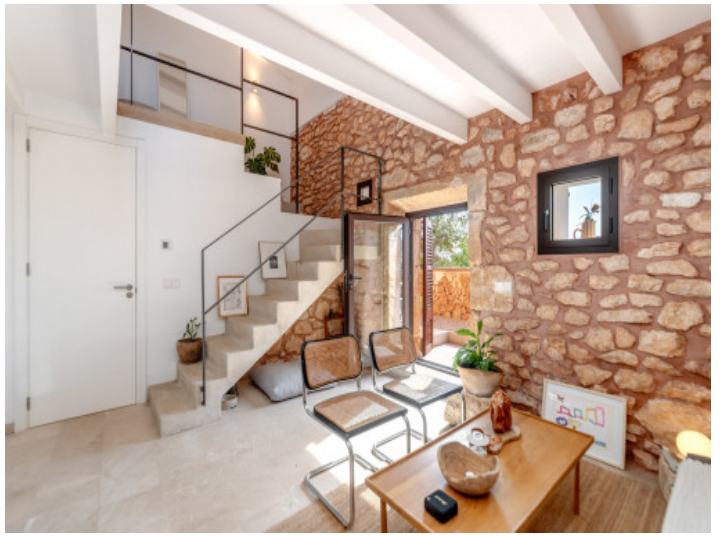
Natural stone walls Cosy sitting area All information is correct to the best of our knowledge. Errors and prior sale excepted. This prospectus is purely for information purposes. Only the notarized deed of sale is legally binding.