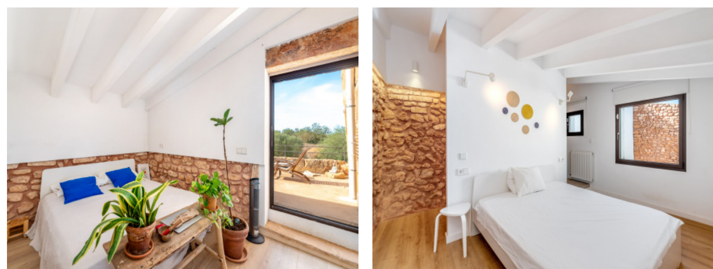
Finca with 6 bedrooms

PORTA MALLORQUINA® Your home. Our passion.