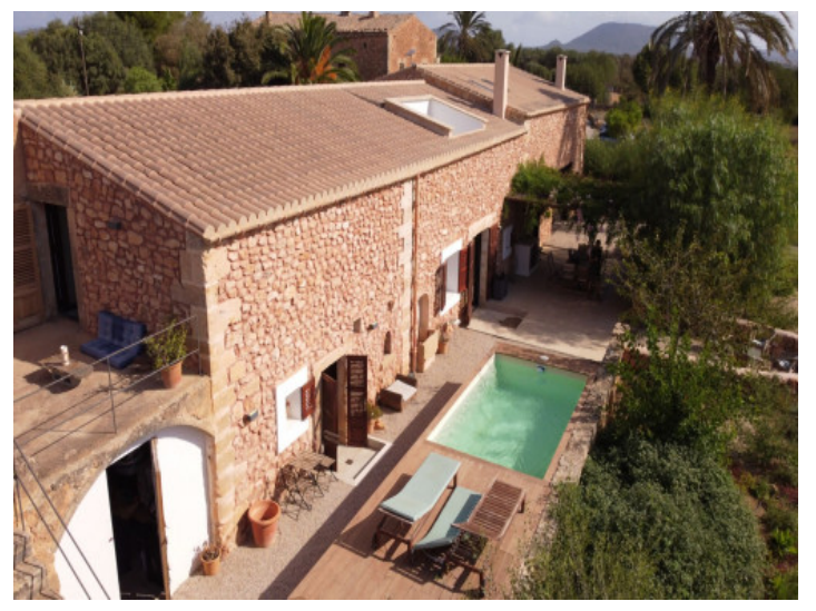
Finca with pool