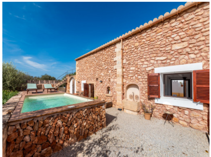
Pool and terrace