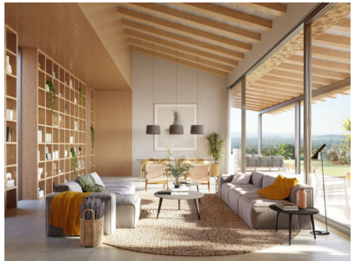
Open living area