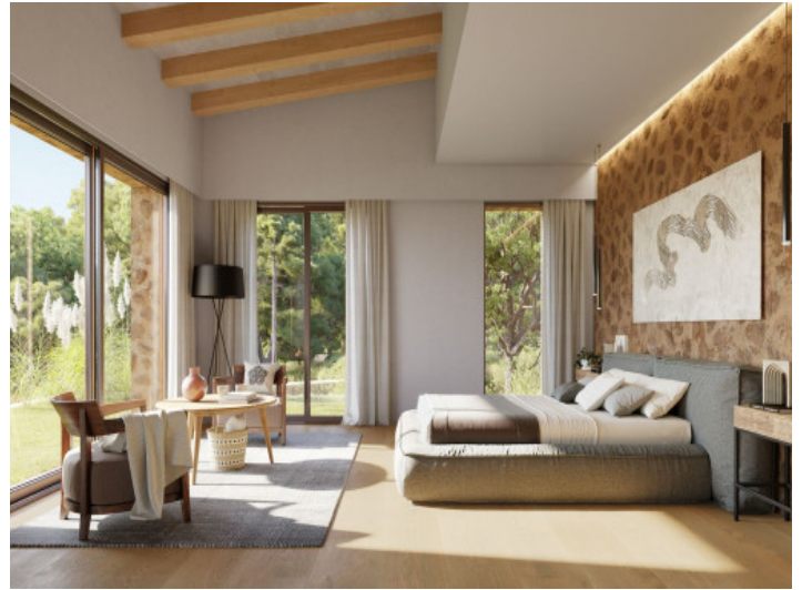
Another cozy bedroom