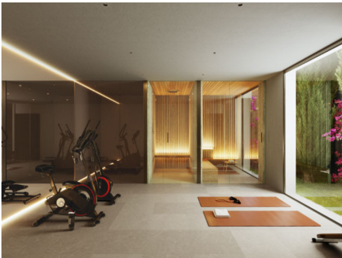
Inviting spa and fitness area