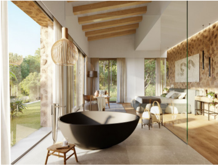
Stylisch bathroom with a view