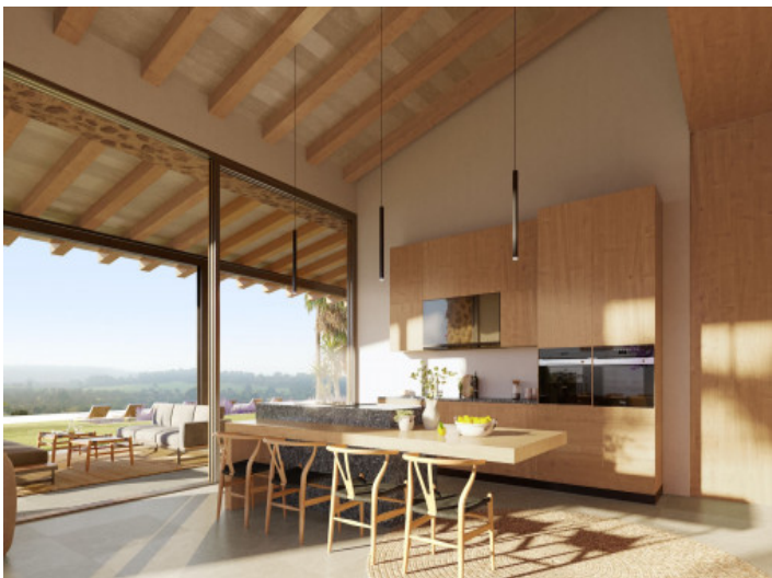
Modern kitchen with cooking island and dining area