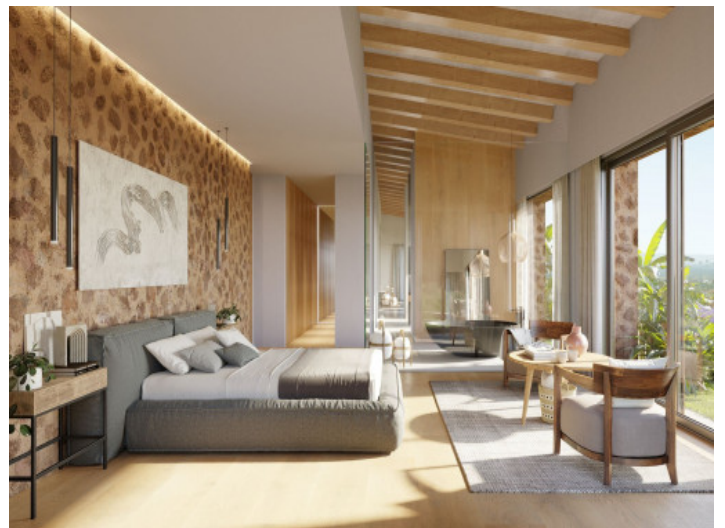
Elegant double bedroom

All information is correct to the best of our knowledge. Errors and prior sale excepted. This prospectus is purely for information purposes. Only the notarized deed of sale is legally binding.