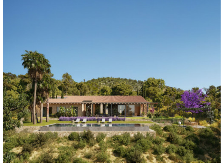
Spacious garden and pool area