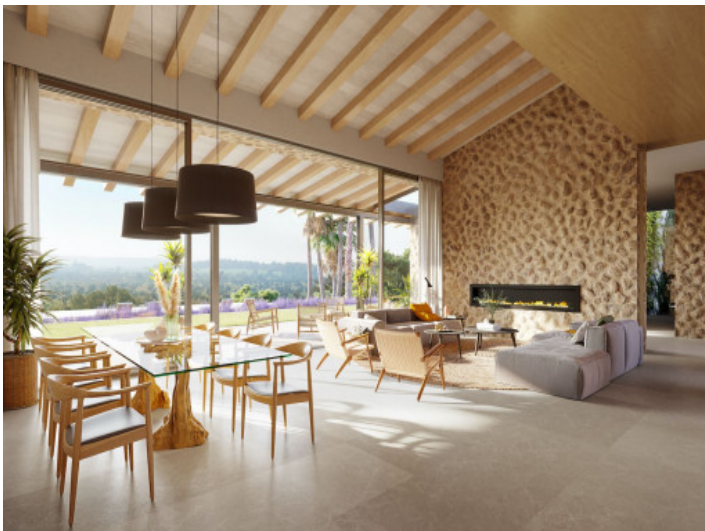
Light flooded living area