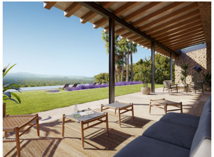
Covered terrace and garden