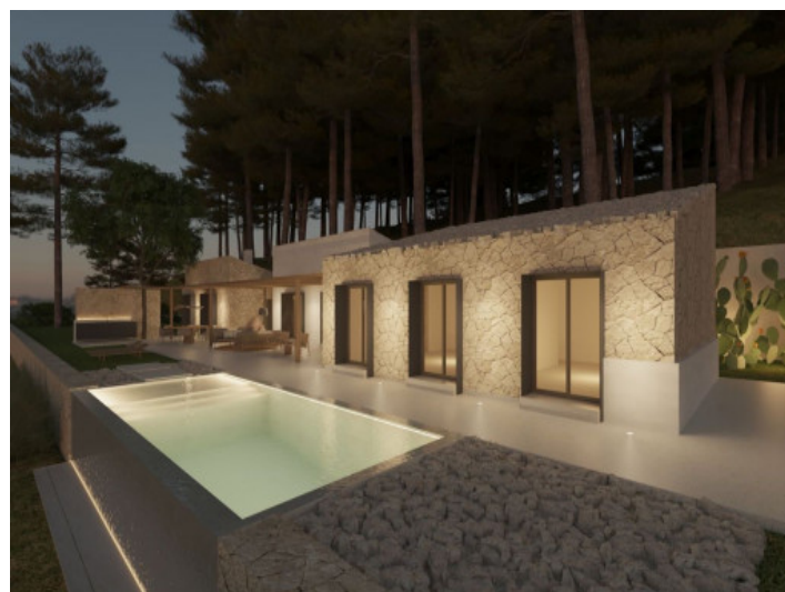
Exterior view by night

All information is correct to the best of our knowledge. Errors and prior sale excepted. This prospectus is purely for information purposes. Only the notarized deed of sale is legally binding.