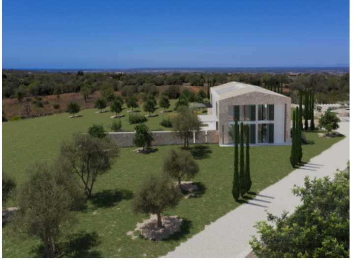
Exterior view of the finca