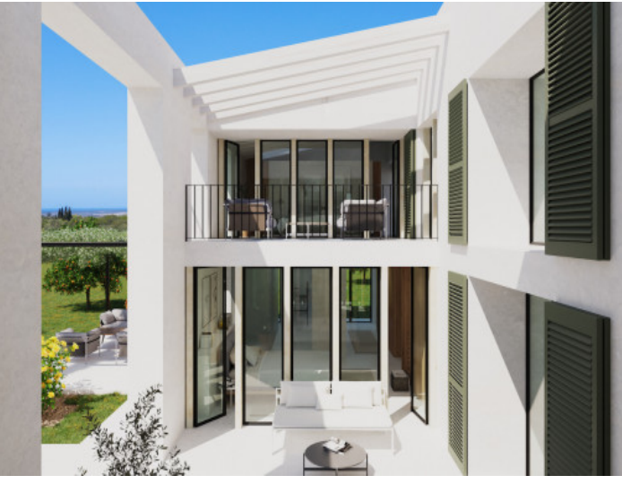
Exterior view of the finca