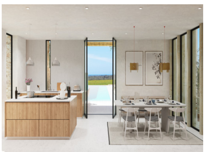
Fully equipped kitchen Kitchen with cooking island All information is correct to the best of our knowledge. Errors and prior sale excepted. This prospectus is purely for information purposes. Only the notarized deed of sale is legally binding.