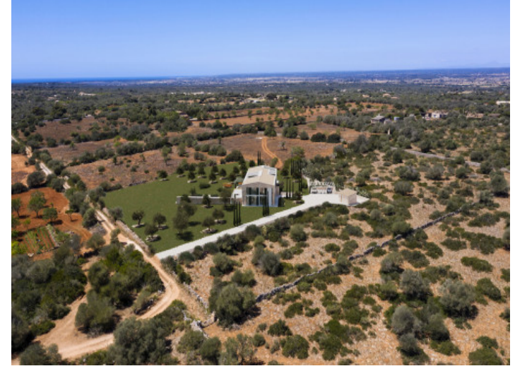
The finca from a birds-eye view