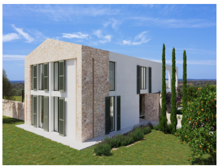
Exterior view of the finca