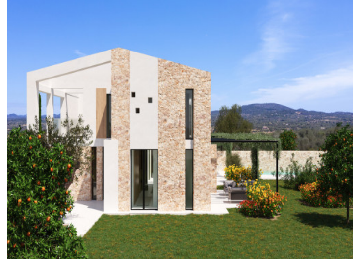
Exterior view of the finca The finca from a birds-eye view All information is correct to the best of our knowledge. Errors and prior sale excepted. This prospectus is purely for information purposes. Only the notarized deed of sale is legally binding.

PORTA MALLORQUINA • THERESIENSTR.: 81, 80333 MUNICH TEL. +34 971 698 242 • INFO@PORTAMALLORQUINA.COM