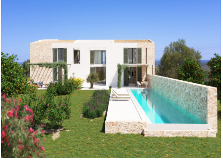
Exterior view of the finca