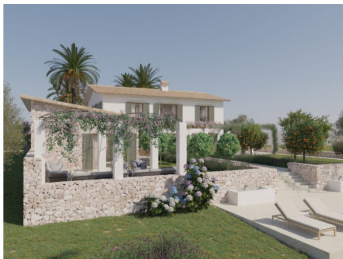
Rear view and pool area

All information is correct to the best of our knowledge. Errors and prior sale excepted. This prospectus is purely for information purposes. Only the notarized deed of sale is legally binding.