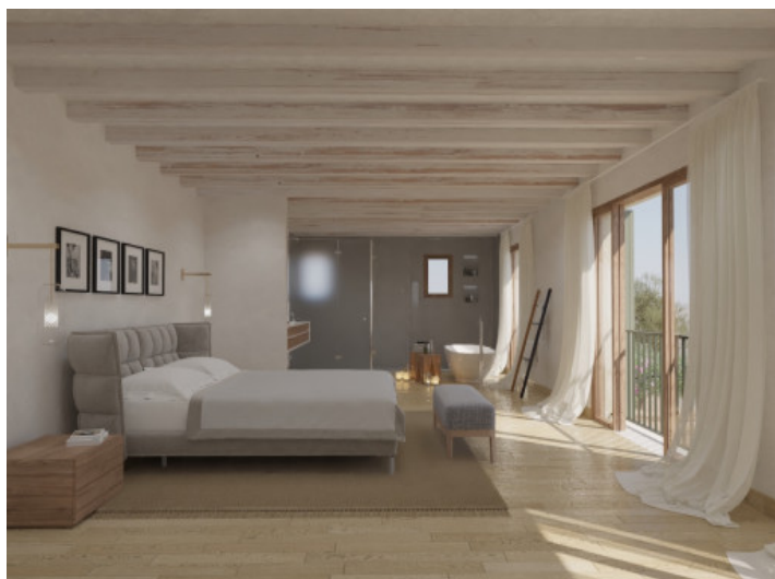
Light flooded bedroom