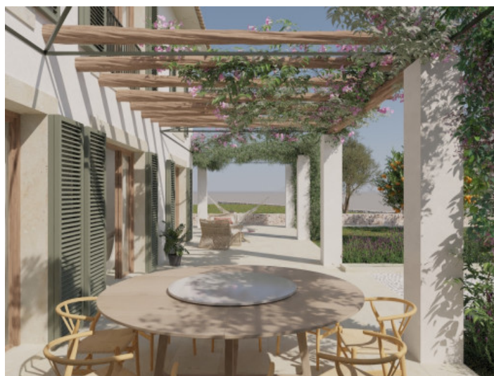
Terrace with dining area