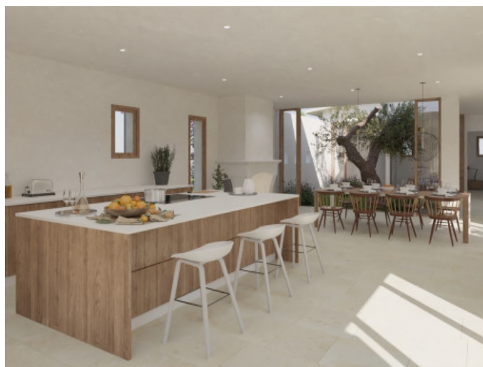
Modern kitchen with cooking island