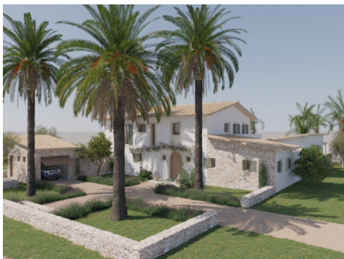
Side view of the finca