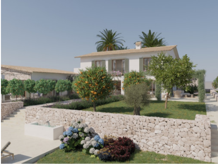
Front view of the newly built project

All information is correct to the best of our knowledge. Errors and prior sale excepted. This prospectus is purely for information purposes. Only the notarized deed of sale is legally binding.