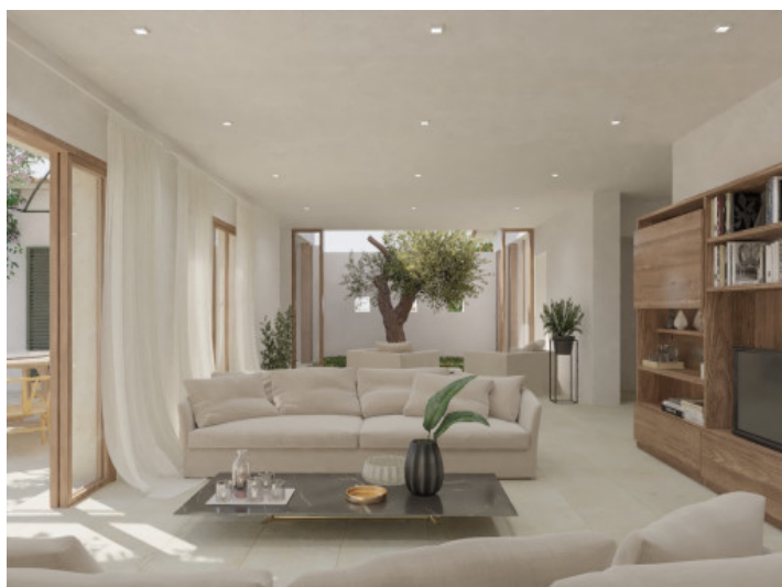
Cozy living area