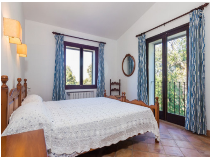
The finca offers 4 double-bedrooms