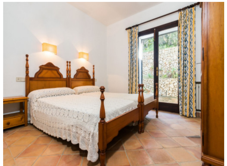
Bright double-bedroom with terrace access

All information is correct to the best of our knowledge. Errors and prior sale excepted. This prospectus is purely for information purposes. Only the notarized deed of sale is legally binding.