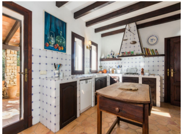
The kitchen offers access to the outside