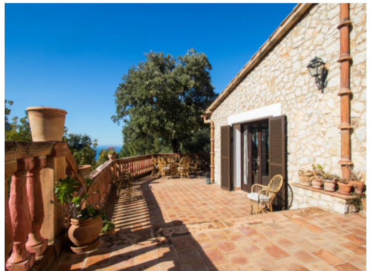
The finca is situated in a dreamlike location

All information is correct to the best of our knowledge. Errors and prior sale excepted. This prospectus is purely for information purposes. Only the notarized deed of sale is legally binding.