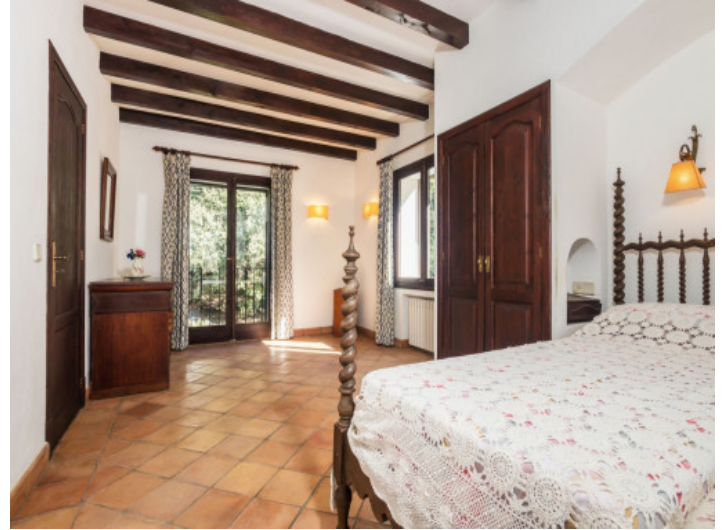
The finca offers a pleasant ambience