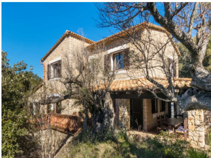
Nature surrounds the stone finca