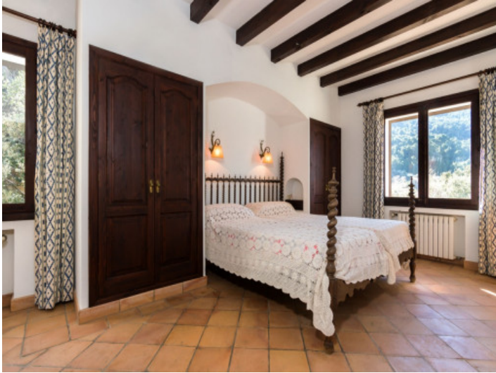
Cosy double-bedroom with built-in wardrobes