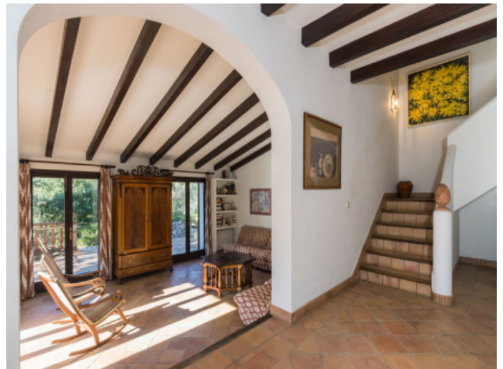
The living area is very light-flooded