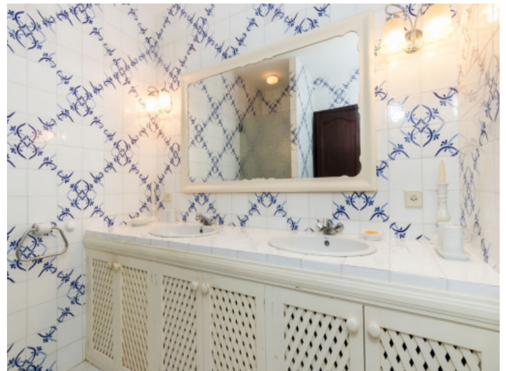
Bathroom with double-washbasin