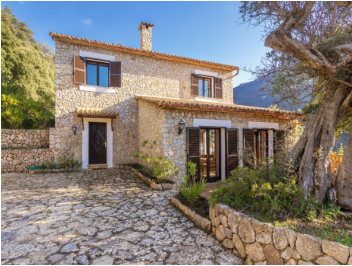
Entrance to the beautiful stone finca