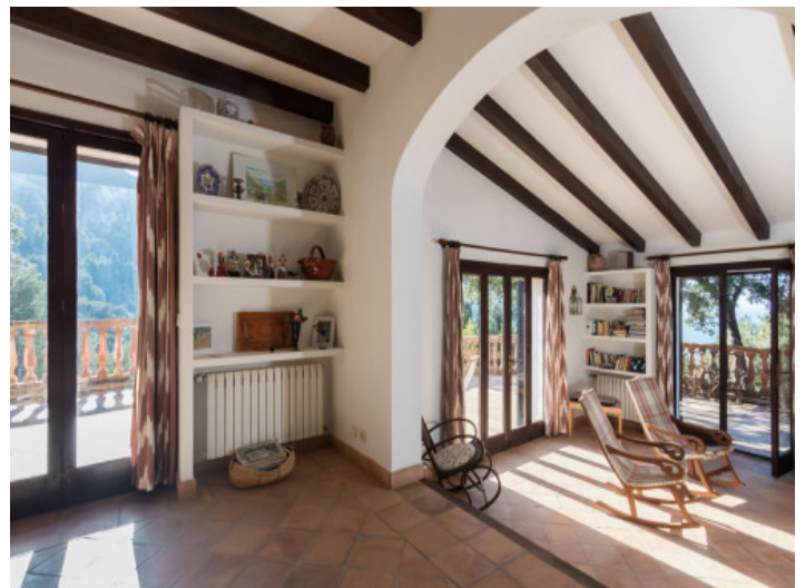
The house has a very typical character

All information is correct to the best of our knowledge. Errors and prior sale excepted. This prospectus is purely for information purposes. Only the notarized deed of sale is legally binding.