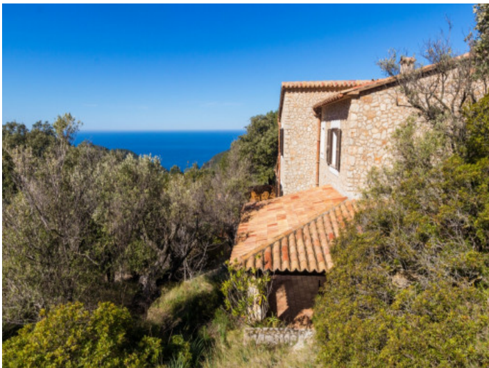
The finca offers wonderful sea views