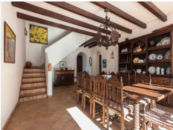
Rustic dining area