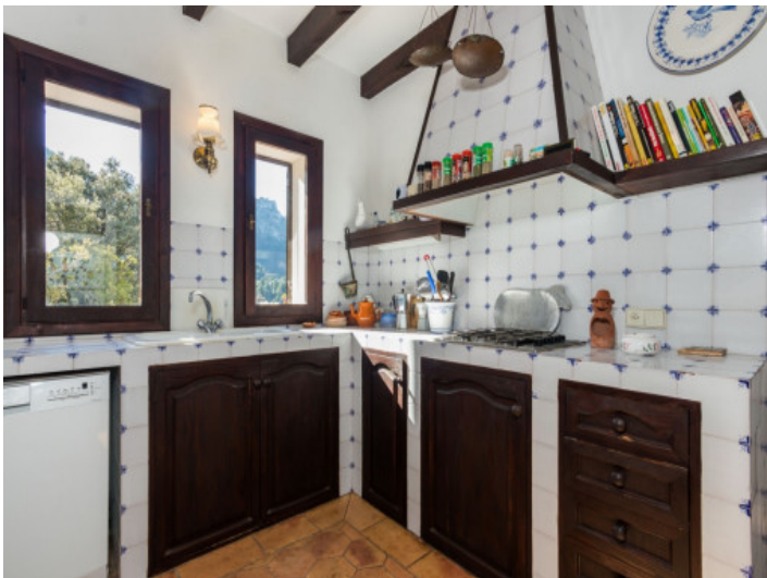
Authentic country style kitchen