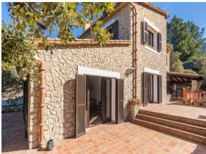
A fantastic terrace surrounds the finca