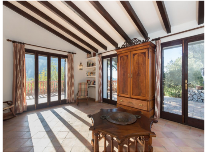
Spacious living area with access to the terrace