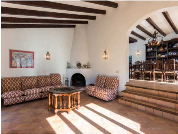
Living area with fireplace corner