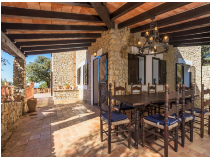
Large dinner table under the covered terrace