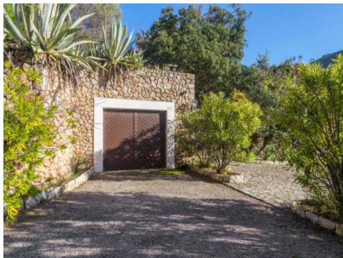
Garage on the mediterranean plot