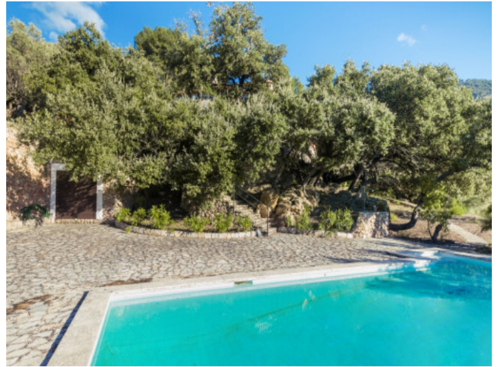
Idyllic pool area