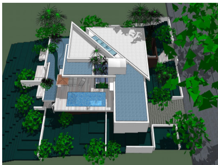
Exterior view of the project