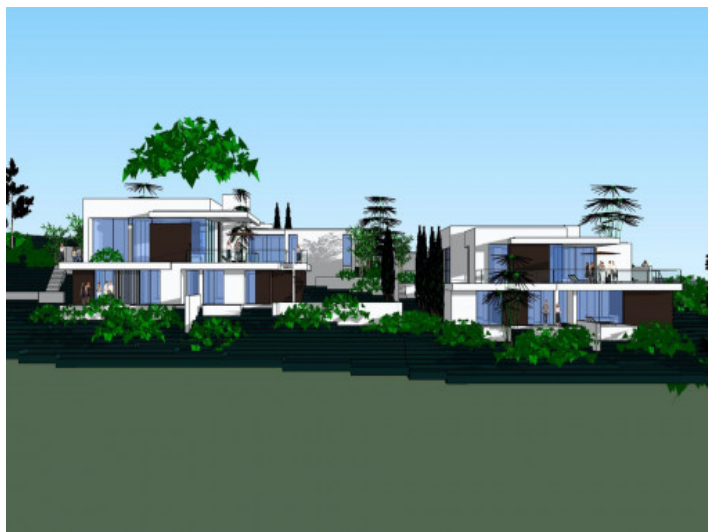
Front view of the villa

All information is correct to the best of our knowledge. Errors and prior sale excepted. This prospectus is purely for information purposes. Only the notarized deed of sale is legally binding.