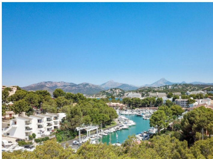
Villa construction project with harbour views in Santa Ponsa