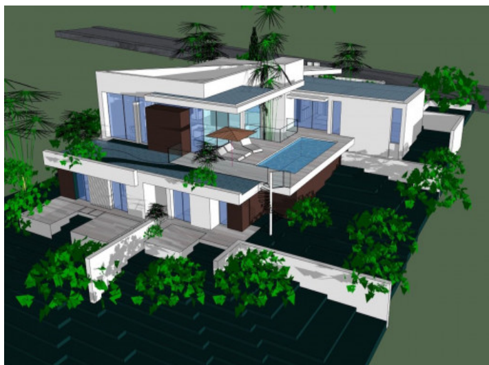
Exterior view of the project