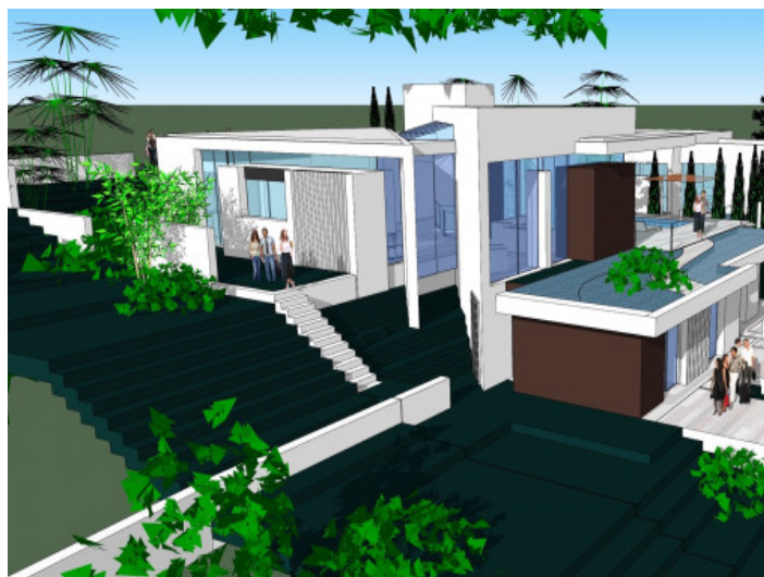
Garden and side view

All information is correct to the best of our knowledge. Errors and prior sale excepted. This prospectus is purely for information purposes. Only the notarized deed of sale is legally binding.