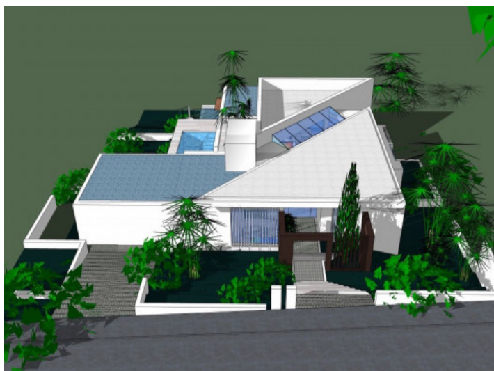
Exterior view of the project