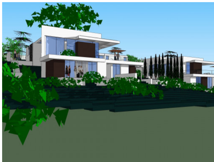
Exterior view of the project