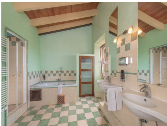
Charming bathroom with bath tub