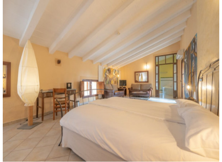
One of 8 master suites with bathroom en suite