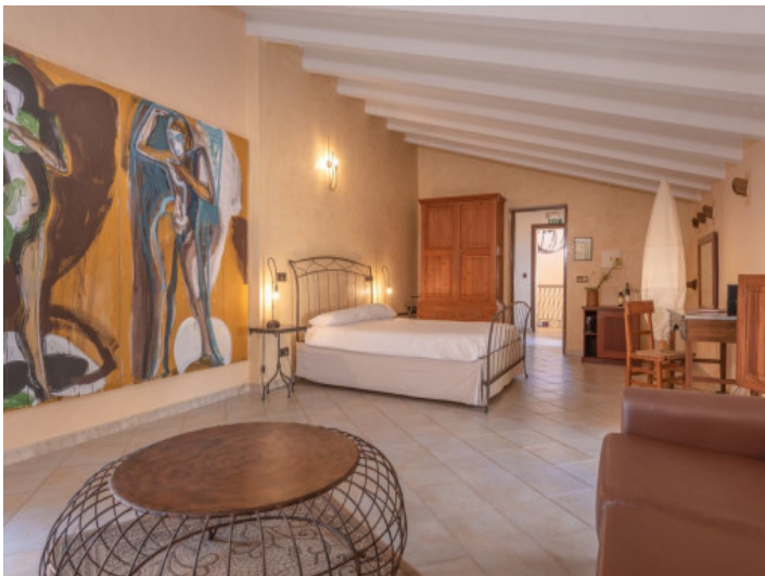
One of 8 master suites with bathroom en suite