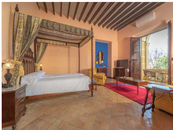
One of 8 master suites with bathroom en suite

All information is correct to the best of our knowledge. Errors and prior sale excepted. This prospectus is purely for information purposes. Only the notarized deed of sale is legally binding.