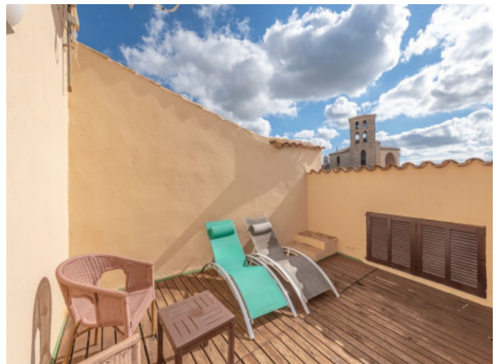
Balcony of this suite

All information is correct to the best of our knowledge. Errors and prior sale excepted. This prospectus is purely for information purposes. Only the notarized deed of sale is legally binding.