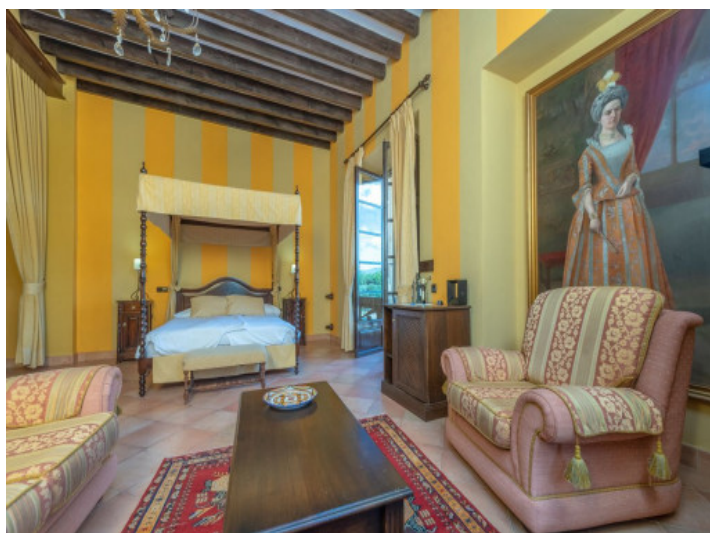
Alternative view of this suite