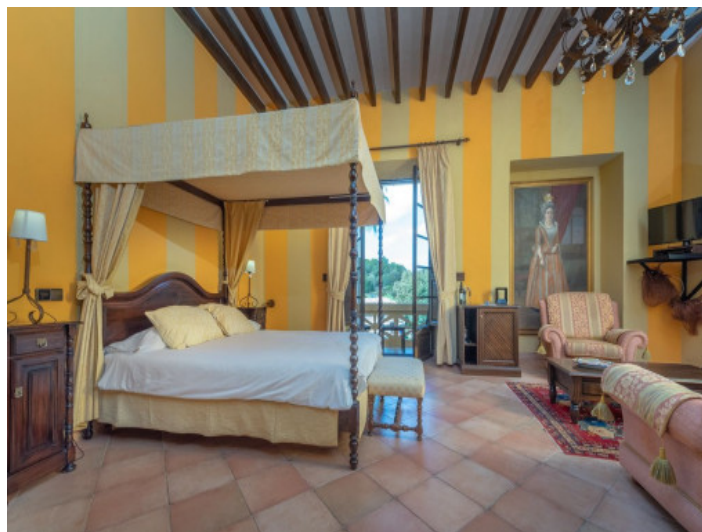
One of 8 master suites with bathroom en suite