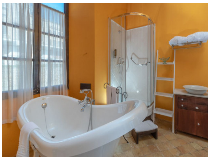
Bathroom with large bath tub