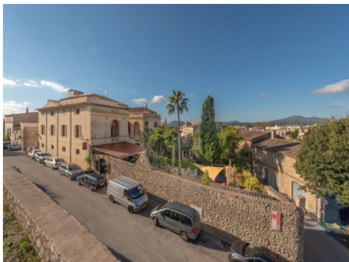
Exterior view of the hotel

All information is correct to the best of our knowledge. Errors and prior sale excepted. This prospectus is purely for information purposes. Only the notarized deed of sale is legally binding.