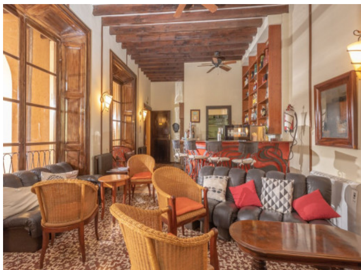
Alternative view of the bar