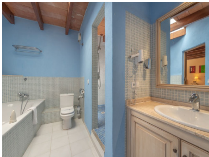
Bathroom en suite with bath tub