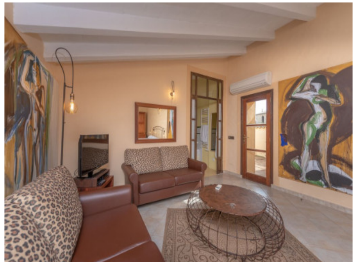
Alternative view of this bedroom