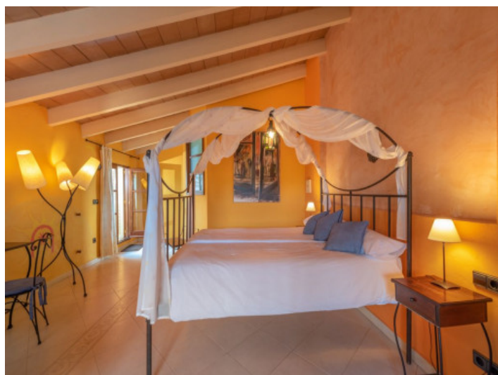
Alternative view of this suite