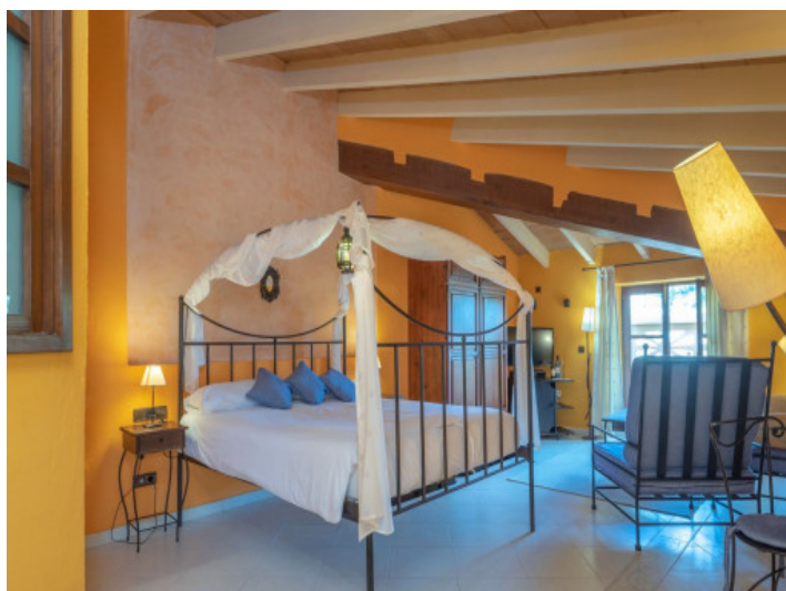
One of 8 master suites with bathroom en suite