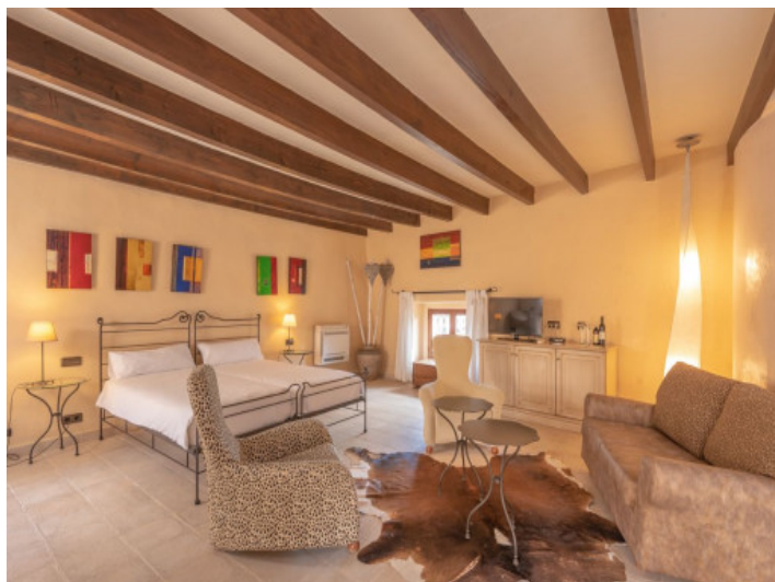
One of 8 master suites with bathroom en suite