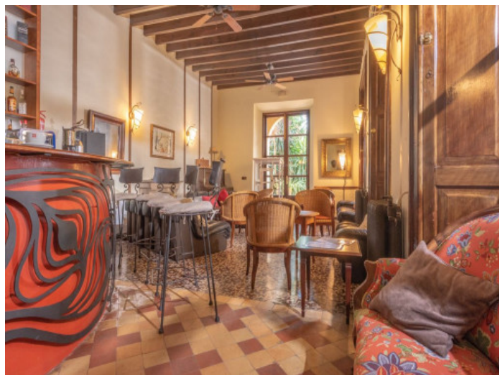
Inviting bar and restaurant