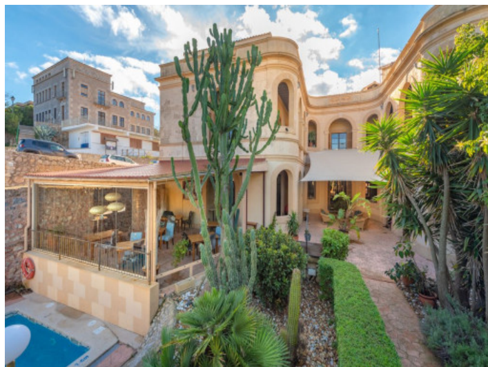
Exterior view of the hotel