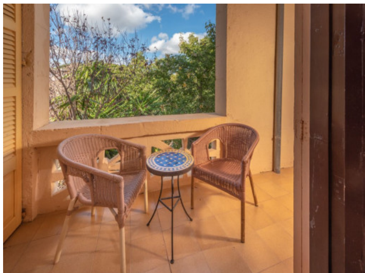
Inviting private balcony