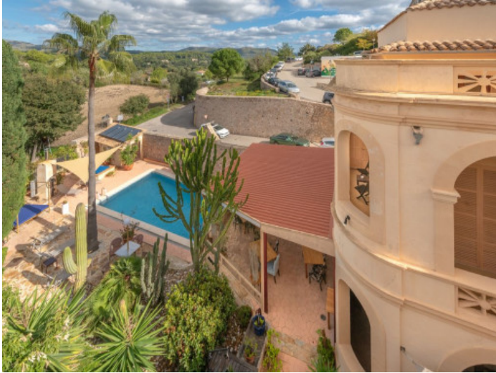
View to the pool and breakfast area