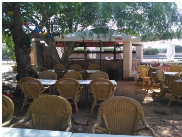
View of the beer garden

All information is correct to the best of our knowledge. Errors and prior sale excepted. This prospectus is purely for information purposes. Only the notarized deed of sale is legally binding.