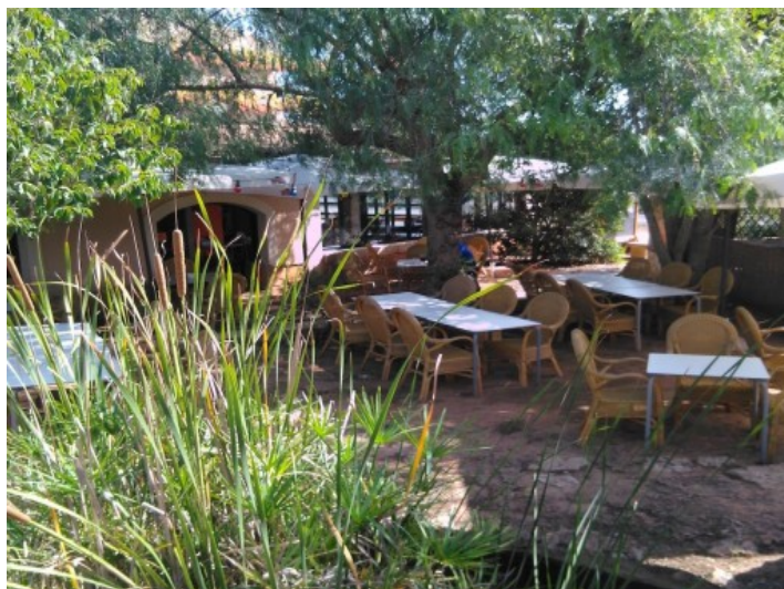
View of the beer garden