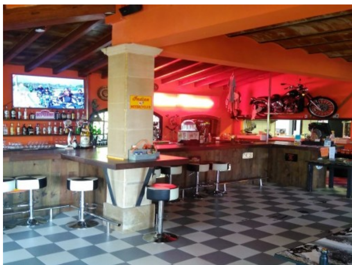
Alternative view of the restaurant