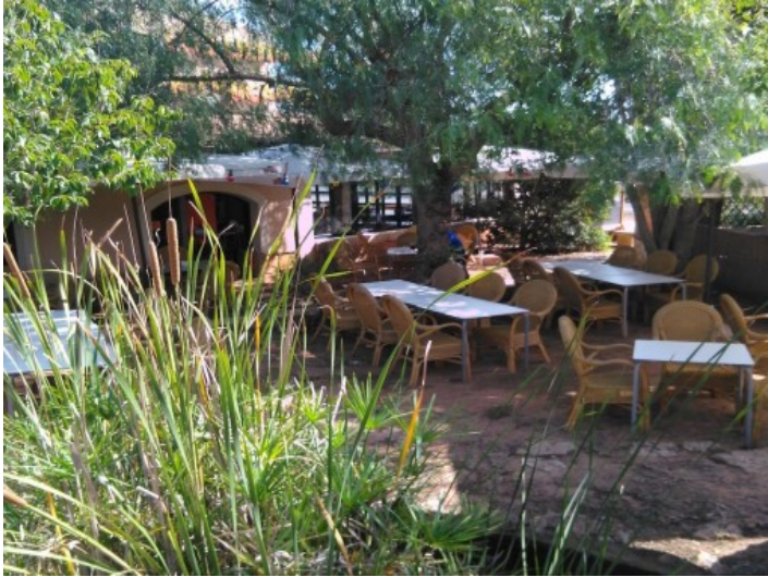
View of the beer garden