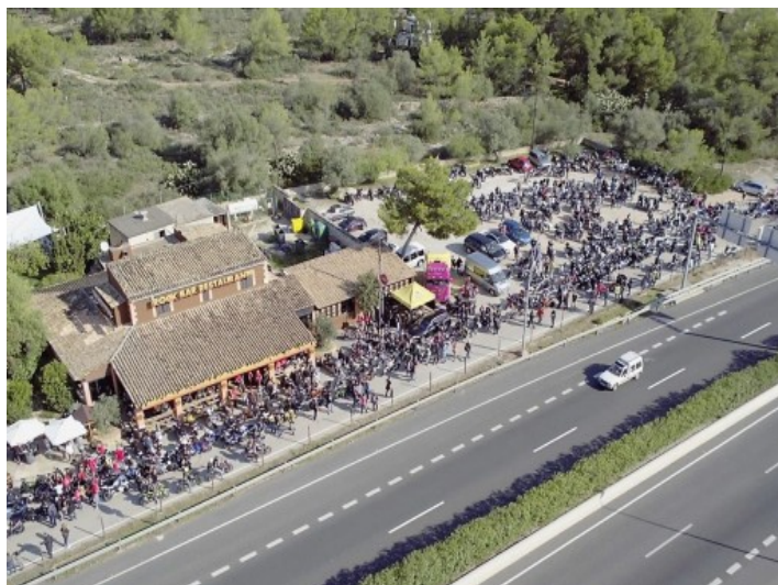
Bird's eye view