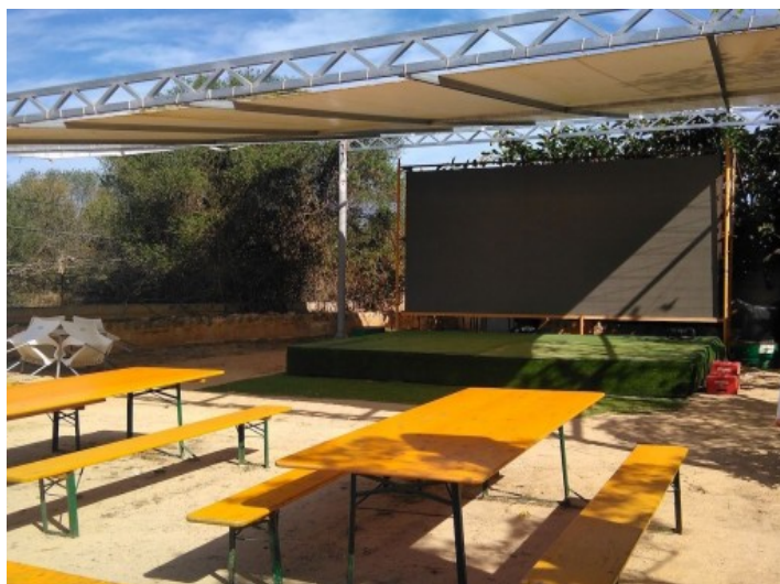
Large beer garden