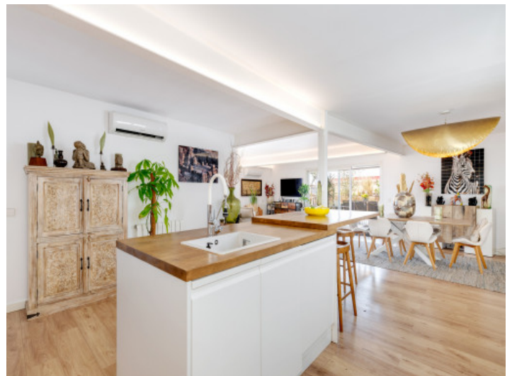
Open plan kitchen

All information is correct to the best of our knowledge. Errors and prior sale excepted. This prospectus is purely for information purposes. Only the notarized deed of sale is legally binding.