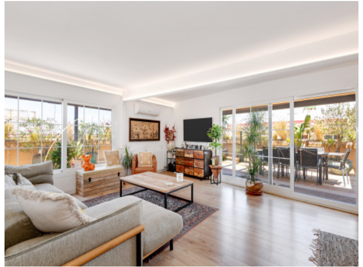
Shiny living room