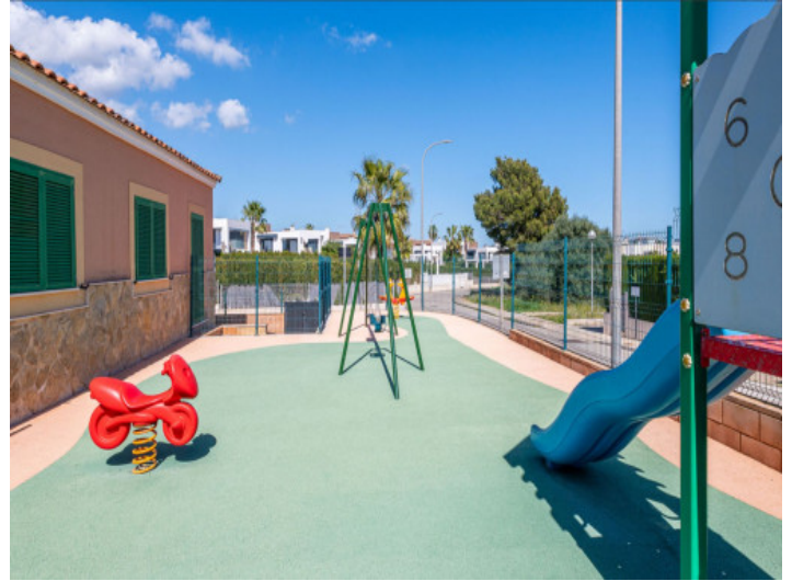
Play ground in community area