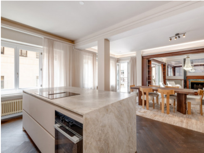
High-quality designer kitchen