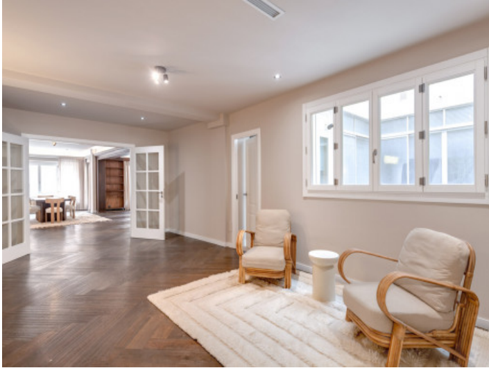
TV room / multifunctional room