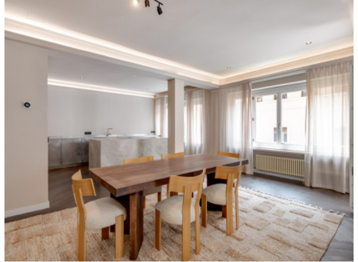
Light-filled dining area