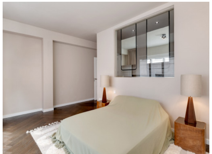
Master bedroom with en-suite bathroom

All information is correct to the best of our knowledge. Errors and prior sale excepted. This prospectus is purely for information purposes. Only the notarized deed of sale is legally binding.