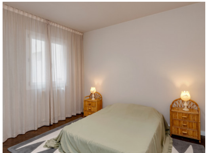
One of the two bedrooms

All information is correct to the best of our knowledge. Errors and prior sale excepted. This prospectus is purely for information purposes. Only the notarized deed of sale is legally binding.