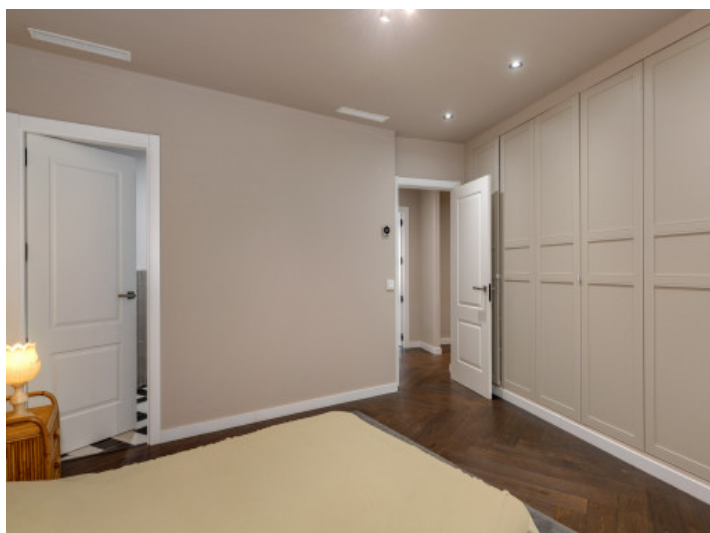
One of the bedrooms with built-in wardrobes

All information is correct to the best of our knowledge. Errors and prior sale excepted. This prospectus is purely for information purposes. Only the notarized deed of sale is legally binding.