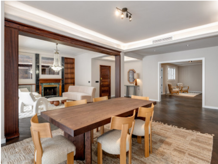
Stylish dining area