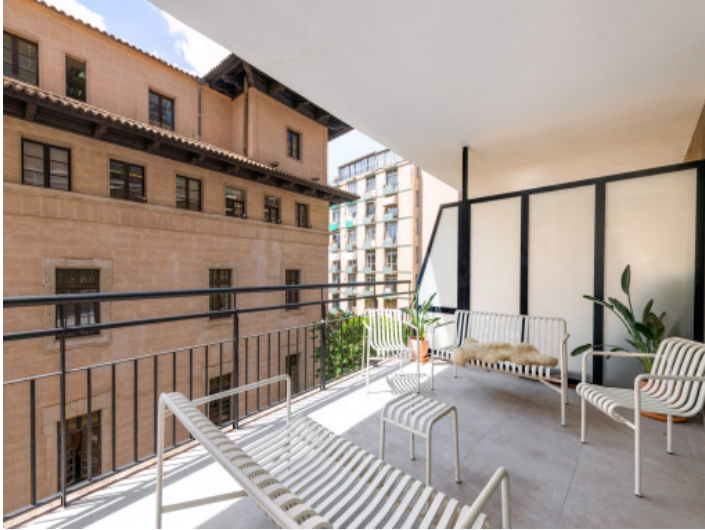
Spacious covered terrace