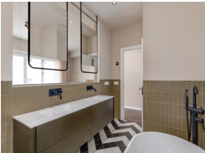
One of the 2 modern bathrooms