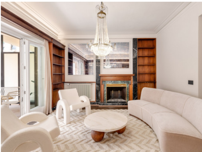
Expansive living area with terrace access